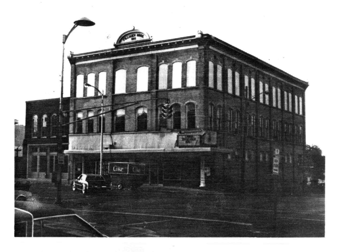
Fillauer Brothers Building Cleveland, Bradley County, Tennessee Historic View ca. 1975