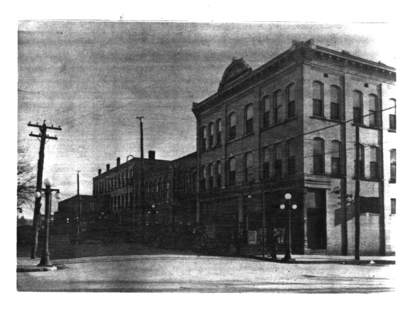
Fillauer Brothers Building Cleveland, Bradley County, Tennessee Historic View ca. 1920