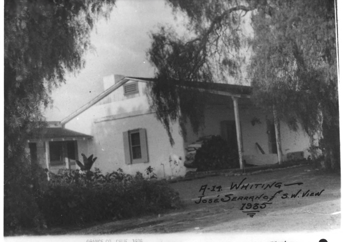
ORANGE CO., CALIF., 1936 W. P. A. No. 3105