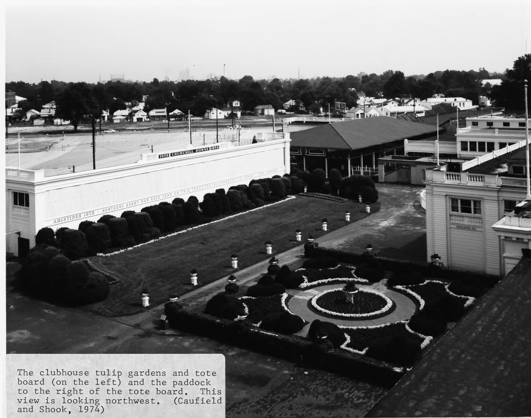
The clubhouse tulip gardens and tote board (on the left) and the paddock to the right of the tote board. This view is looking northwest. (Caufield and Shook, 1974)