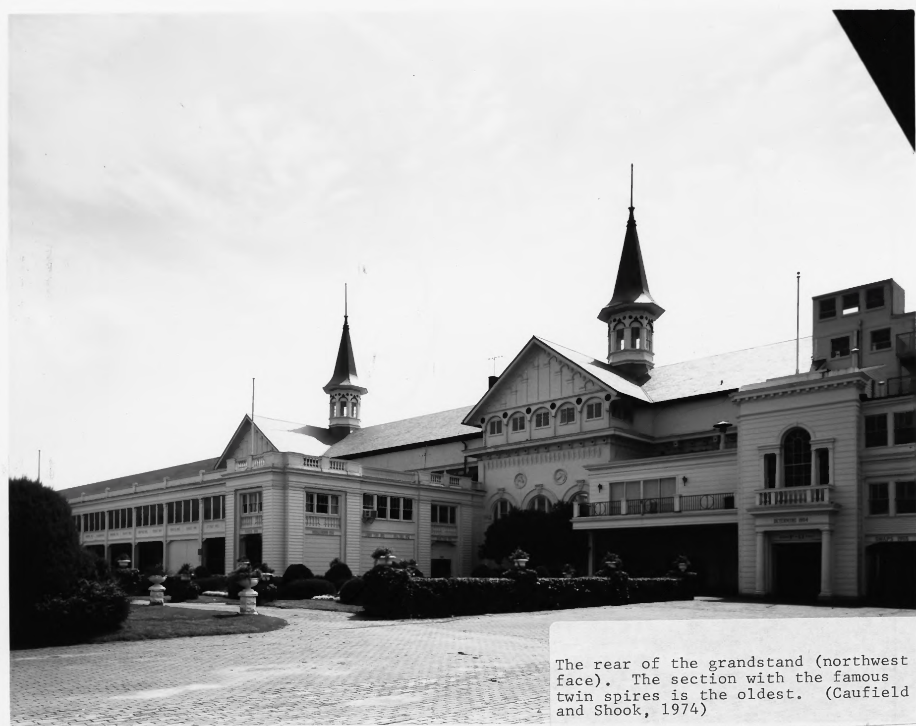
The rear of the grandstand (northwest face). The section with the famous twin spires is the oldest. (Caufield and Shook, 1974)