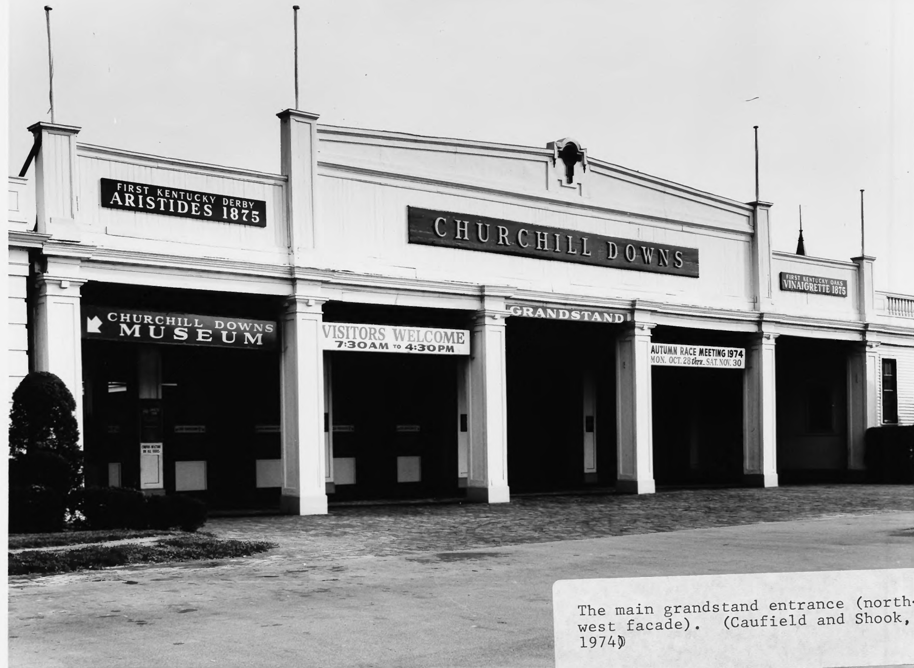
The main grandstand entrance (northwest facade). (Caufield and Shook, 1974)