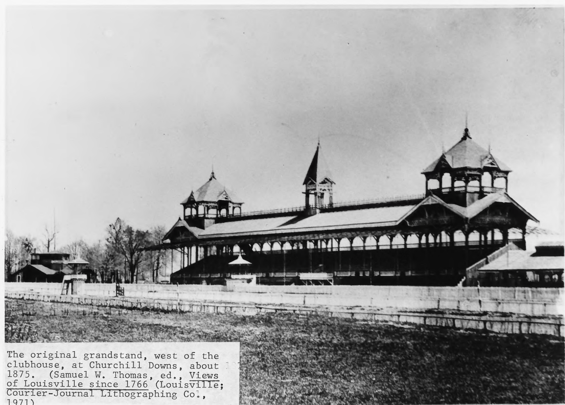
The original grandstand, west of the clubhouse, at Churchill Downs, about 1875.