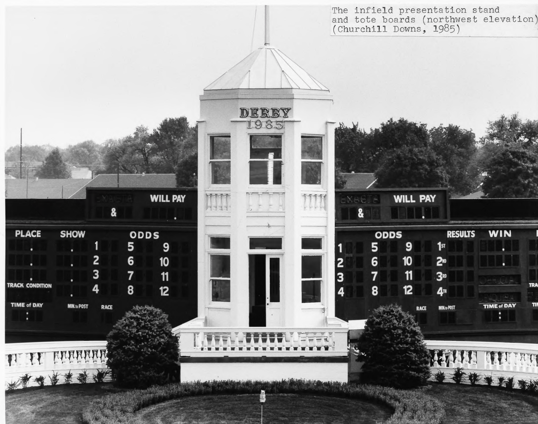
The infield presentation stand and tote boards (northwest elevation) (Churchill Downs, 1985)