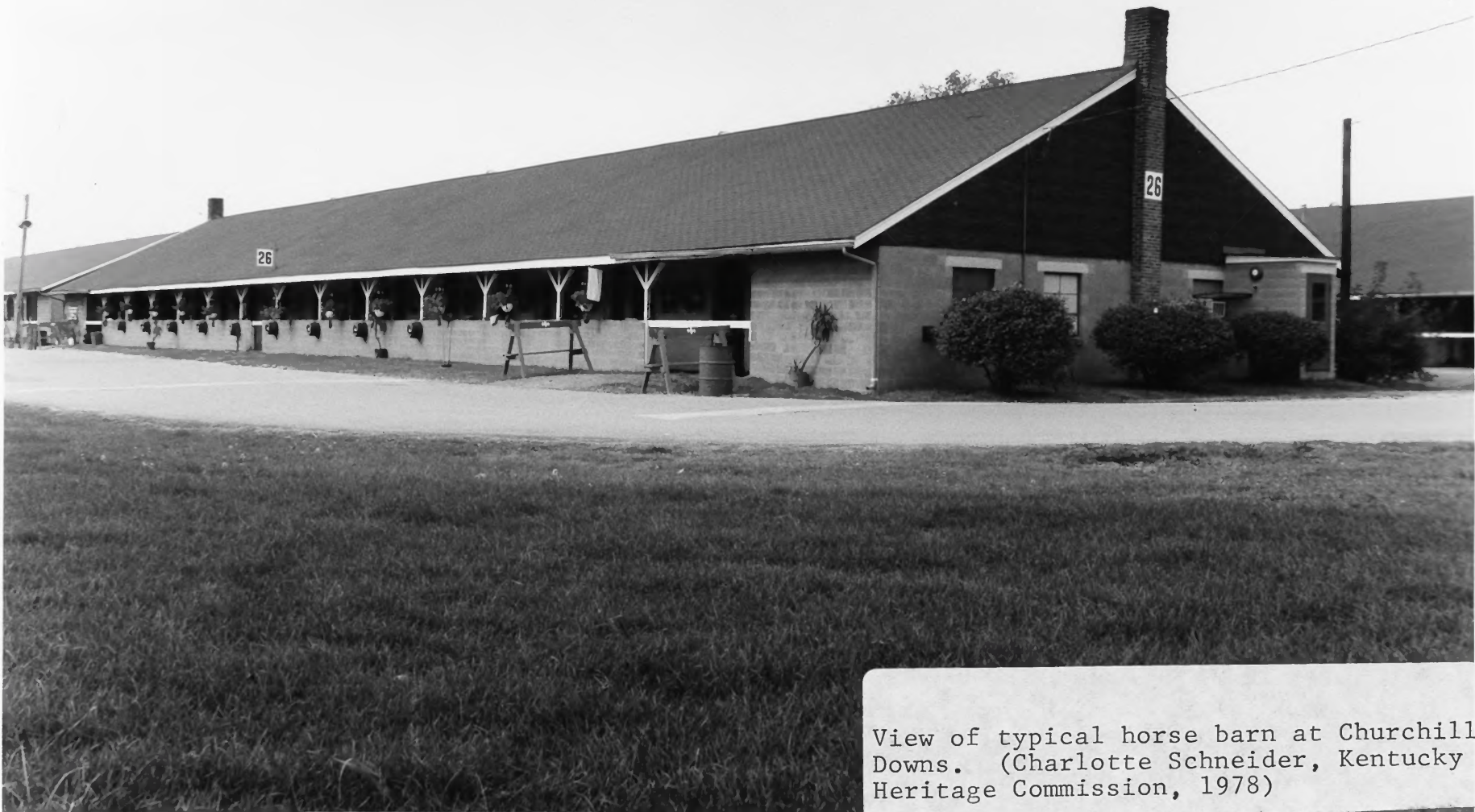
View of typical horse barn at Churchill Downs.