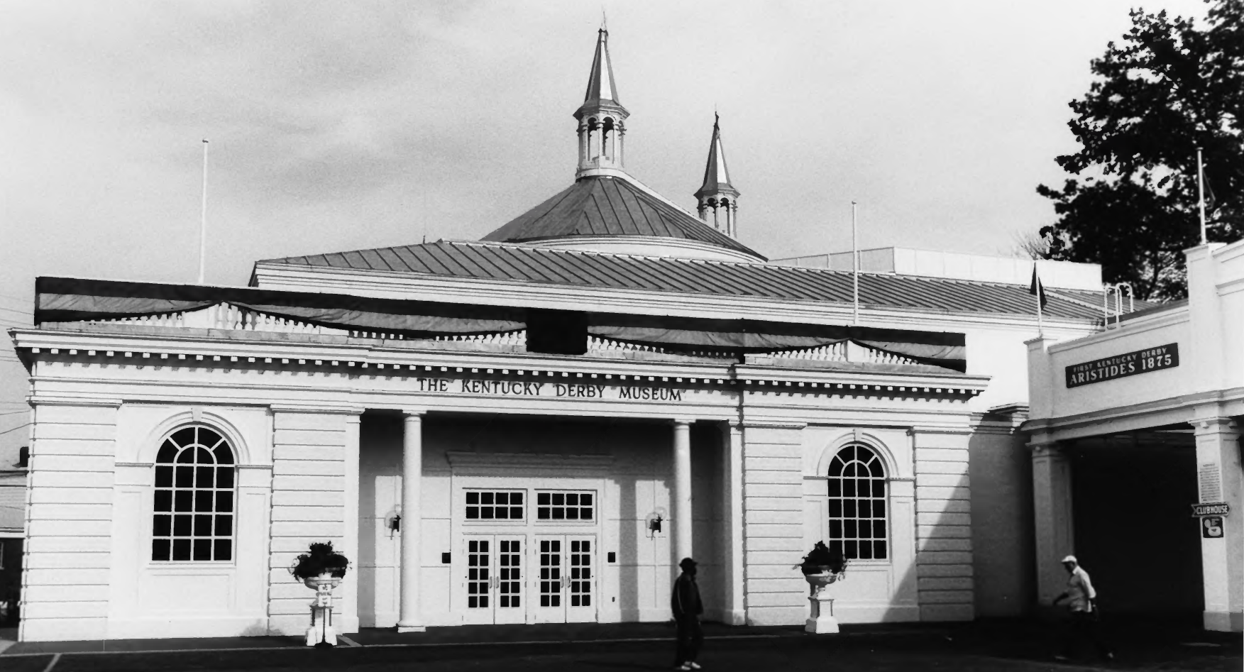
Churchill Downs Kentucky Derby Museum, erected in 1961 in a style compatible w with other features. (Caufield and Shook, 1974)