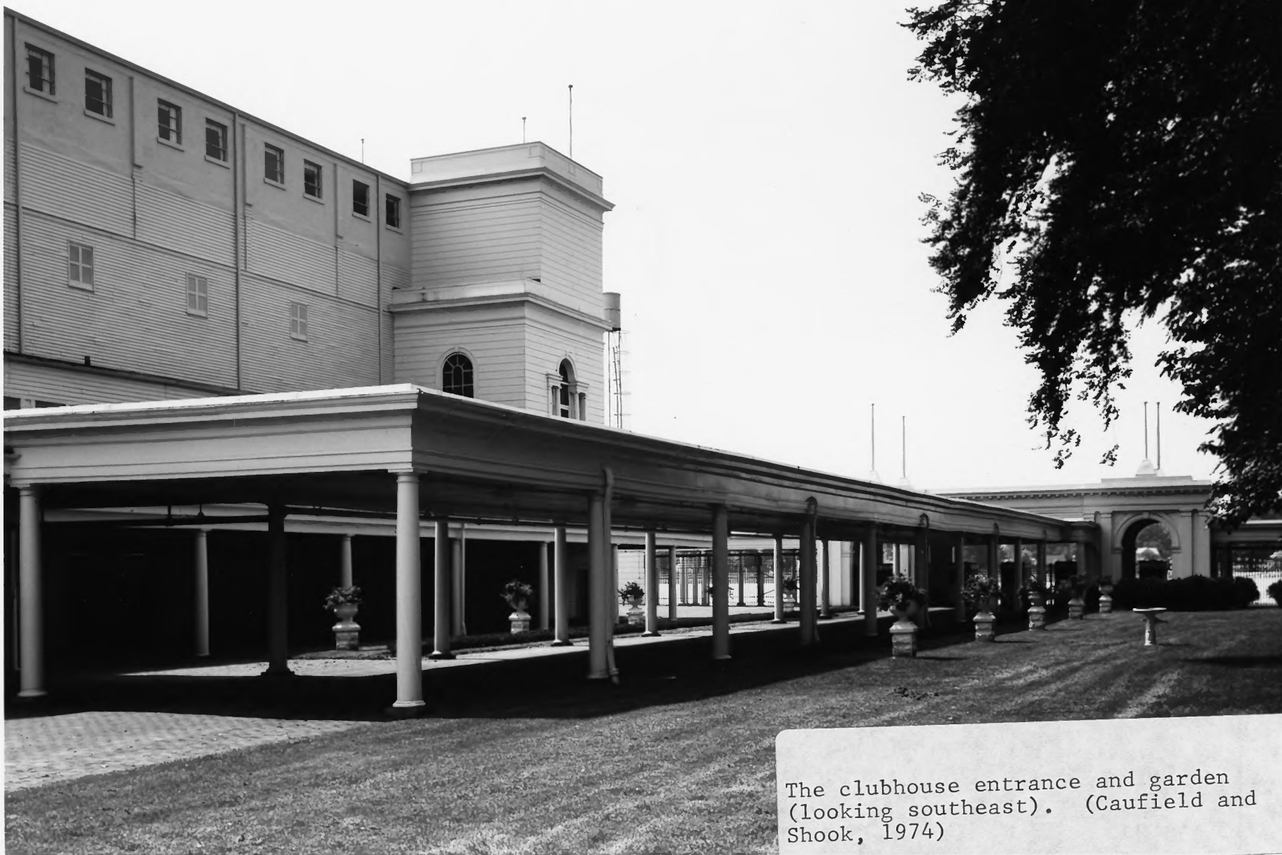
The clubhouse entrance and garden (looking southeast). (Caufield and Shook, 1974)