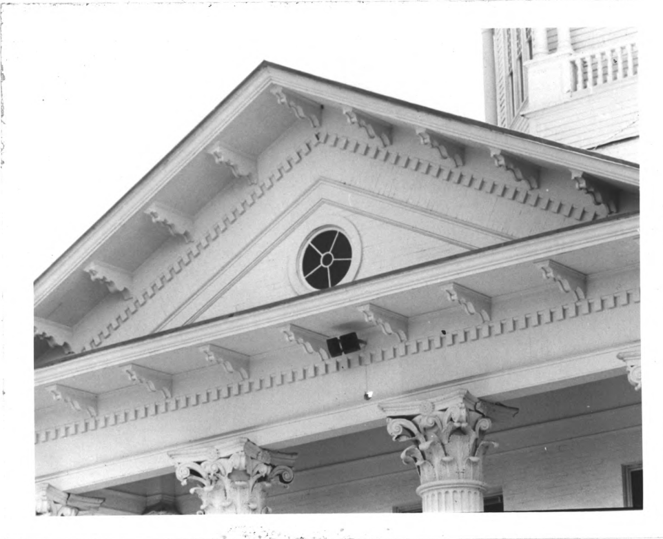
DETAIL - PEDIMENT