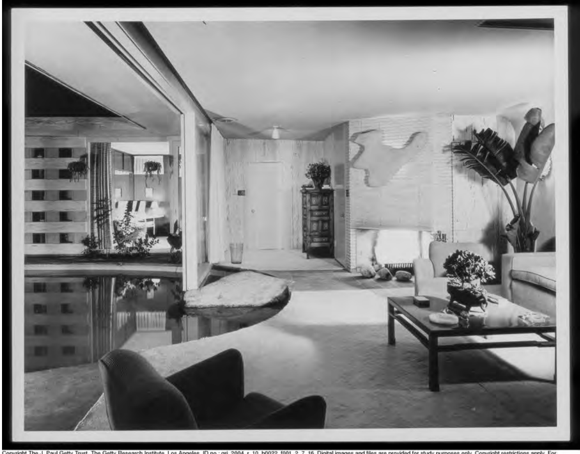
Figure 4. Interior view, living room, looking west, 1947.