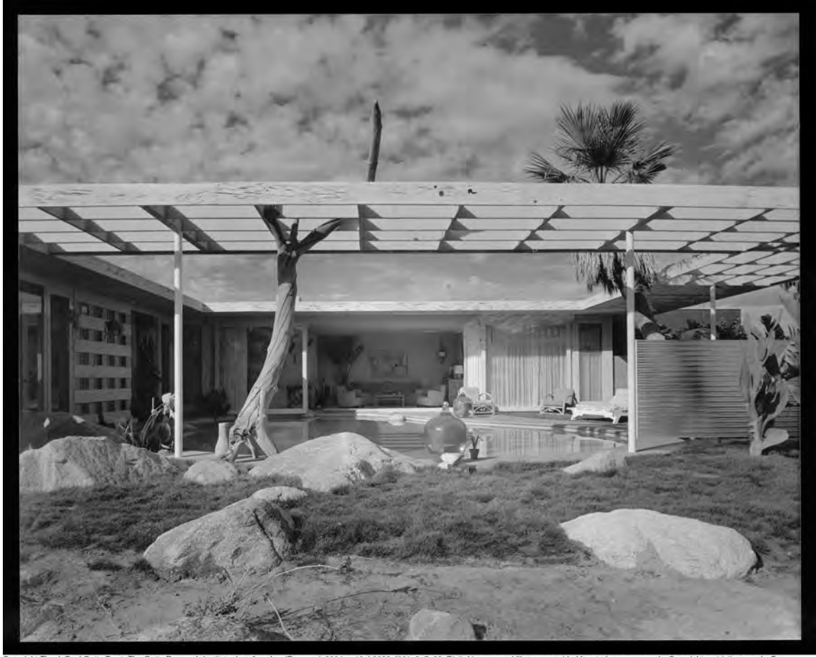
Figure 6. South elevation, looking north, 1947.