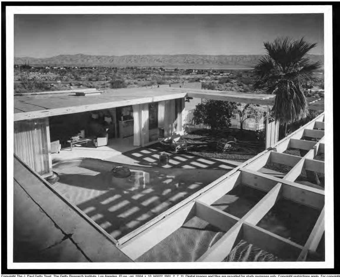
Figure 2. South and west elevations, looking northeast, 1947.

Loewy HouseRiverside, CaliforniaName of PropertyCounty and State