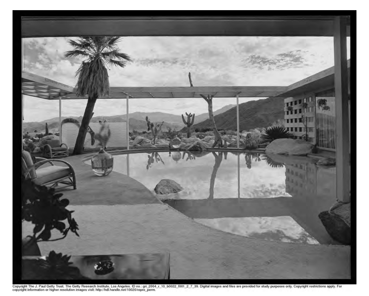
Figure 7. Looking south from living room, 1947.