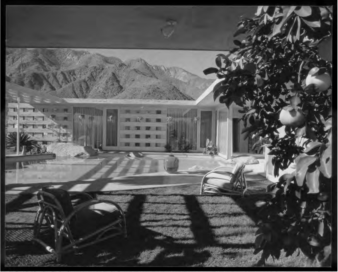
Figure 5. East elevation, looking west, 1947.