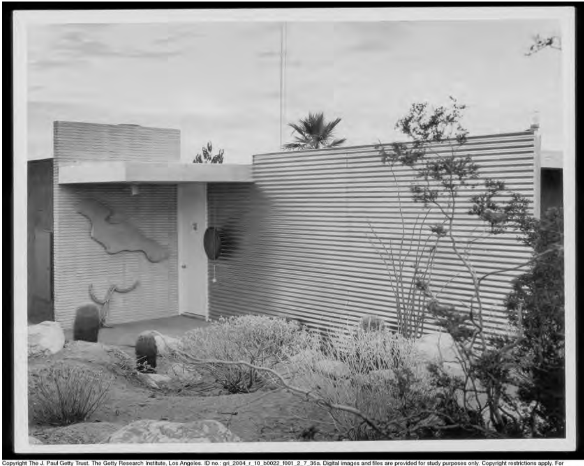
Figure 3. Main entrance, looking southeast, 1947.