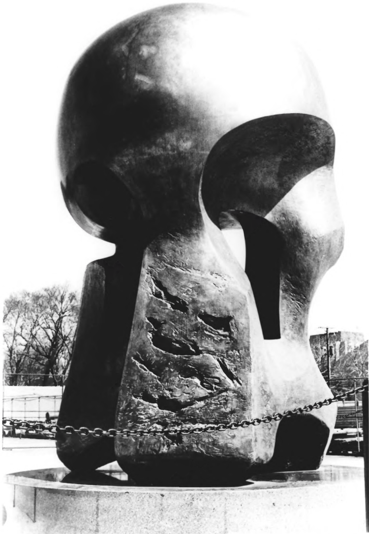
"NUCLEAR ENERGY", BY HENRY MOORE, COMMEMORATING THE 25TH ANNIVERSARY OF THE FIRST CONTROLLED NUCLEAR CHAIN REACTION AT THE UNIVERSITY OF CHICAGO.