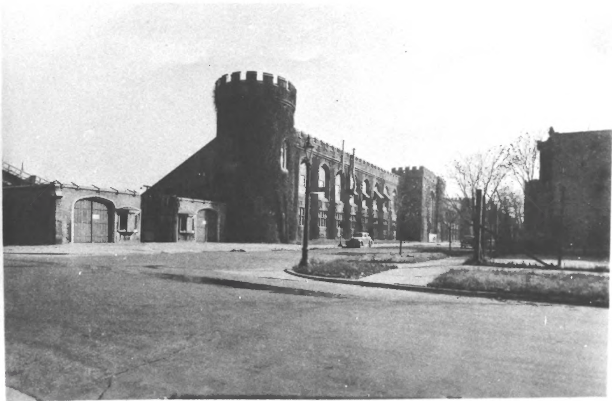
West Stands at Stagg Field housed the first reactor.