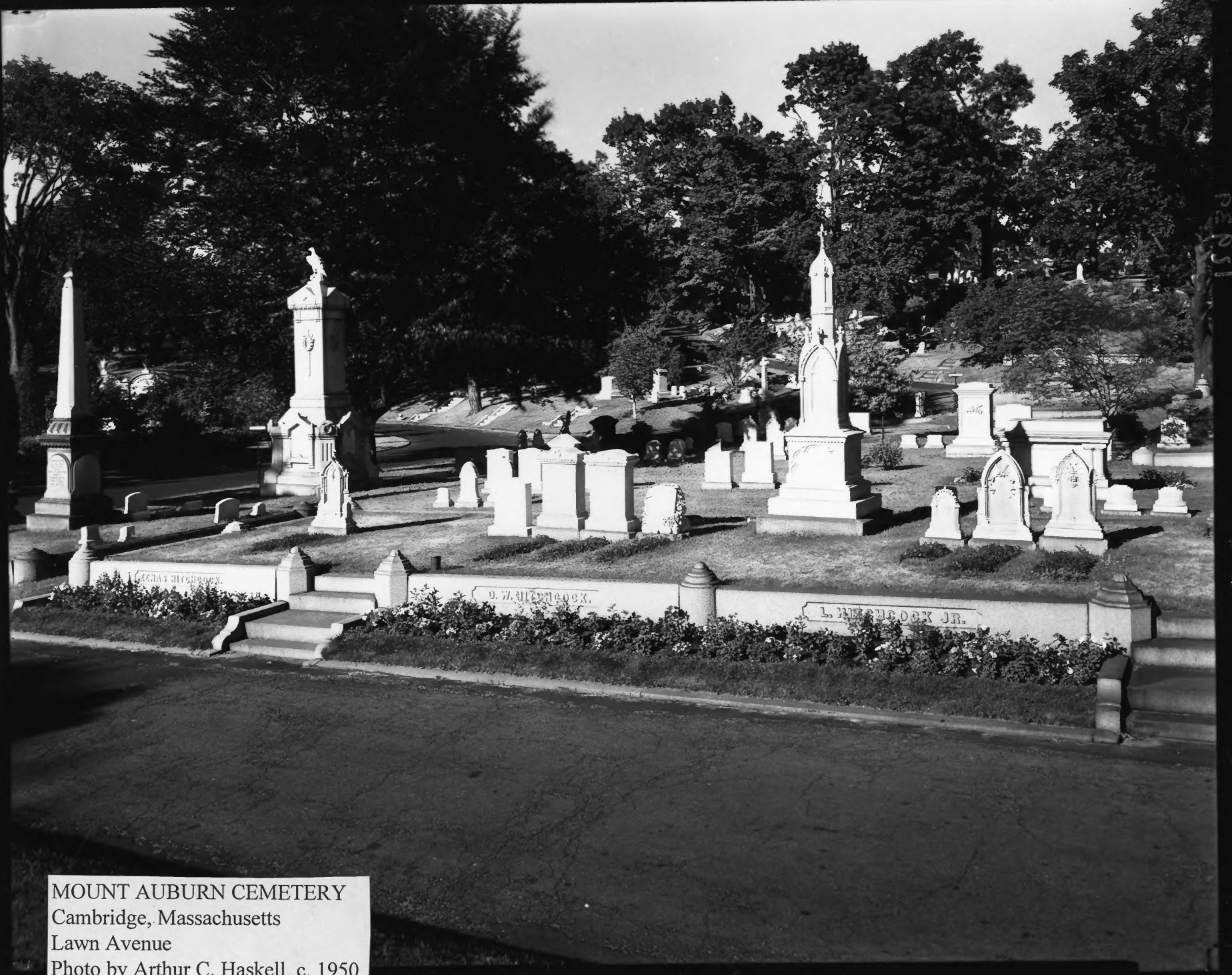
MOUNT AUBURN CEMETERY Cambridge, Massachusetts Lawn Avenue Photo by Arthur C. Haskell, c. 1950