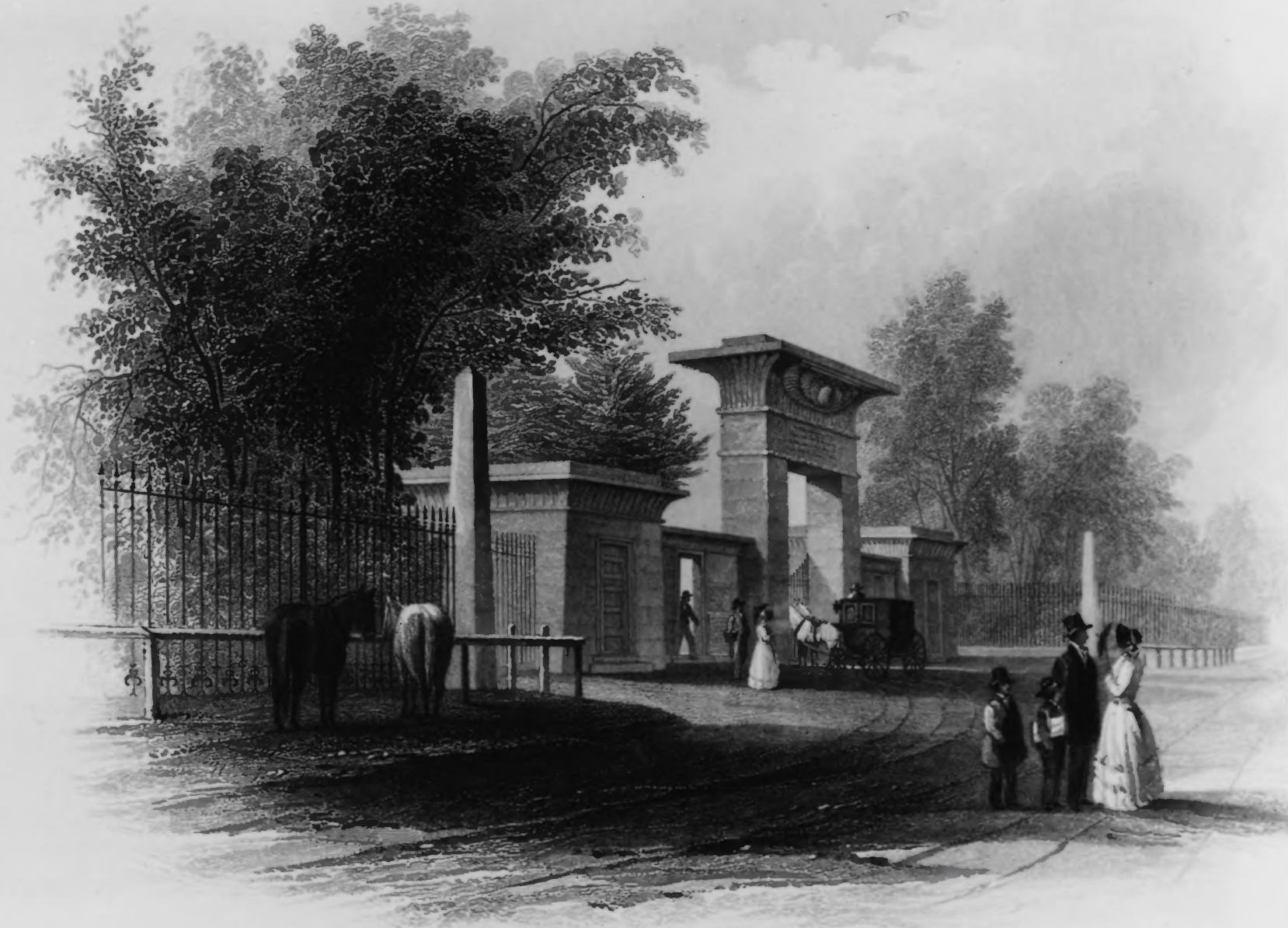
Drawn & Engraved by James Smillie