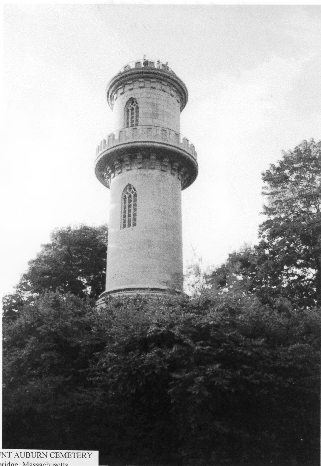
MOUNT AUBURN CEMETERY Cambridge, Massachusetts Washington Tower Photo by Janet Heywood, 1999