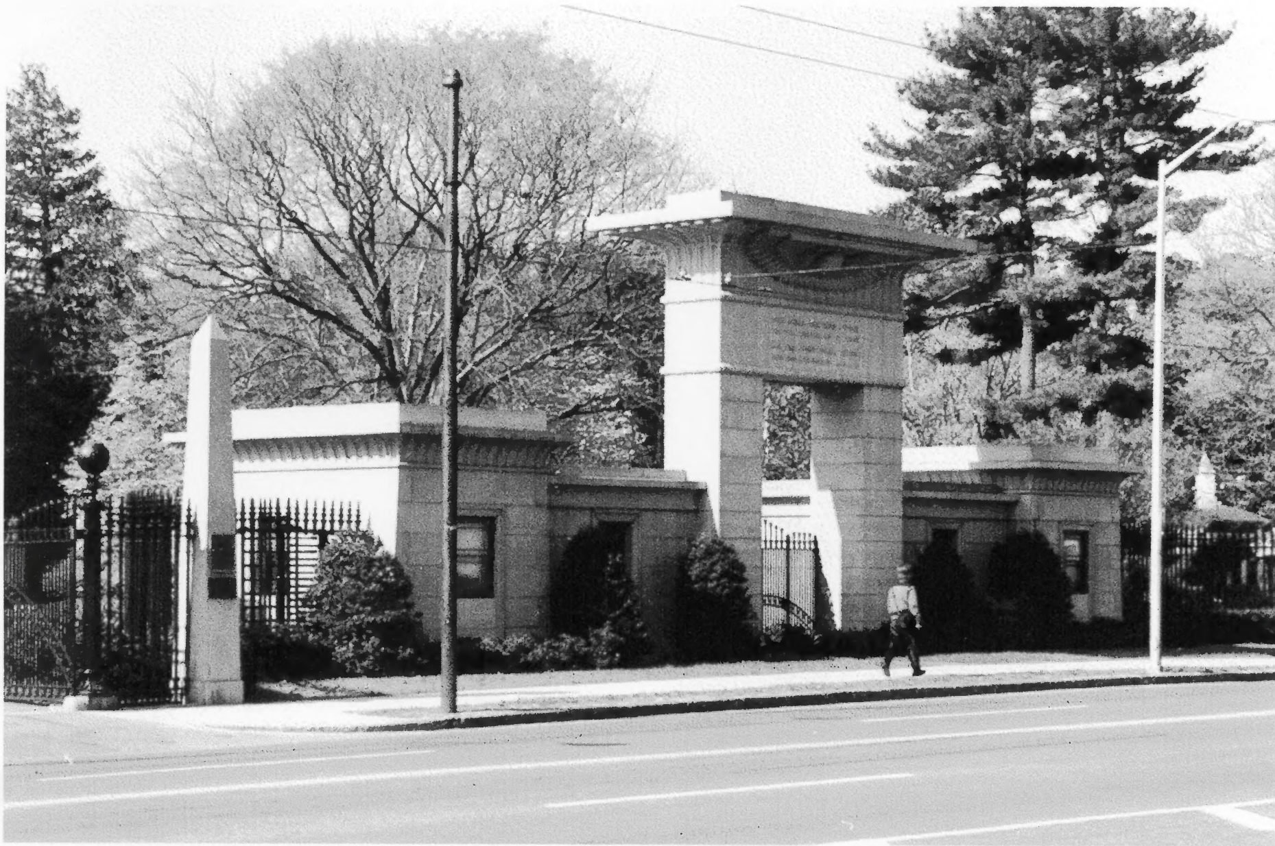
MOUNT AUBURN CEMETERY Cambridge, Massachusetts Mount Auburn Entrance Photo by Janet Heywood, 1999