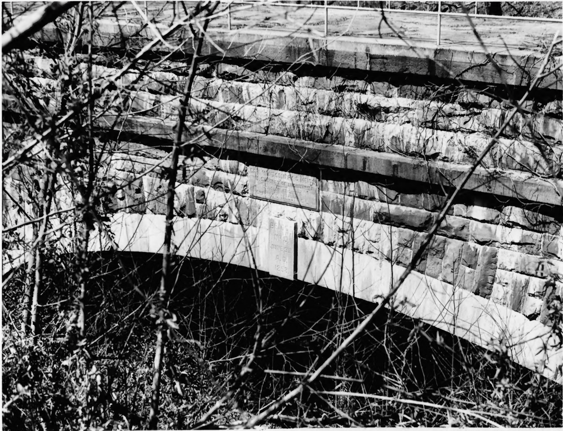
Washington Aqueduct, Bridge No. 3, Washington, D.C.