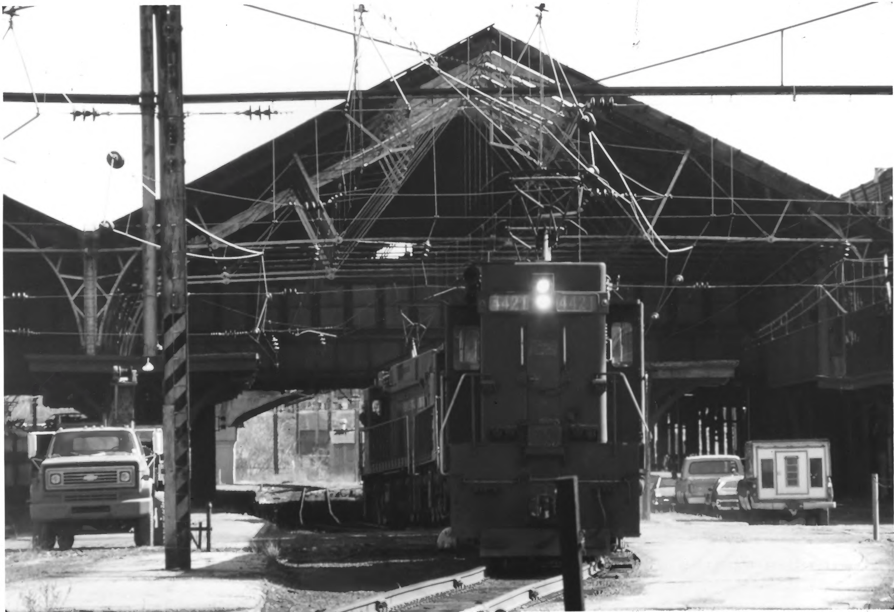
Penn Central Railroad Station and Shed, Harrisburg, Pennsylvania