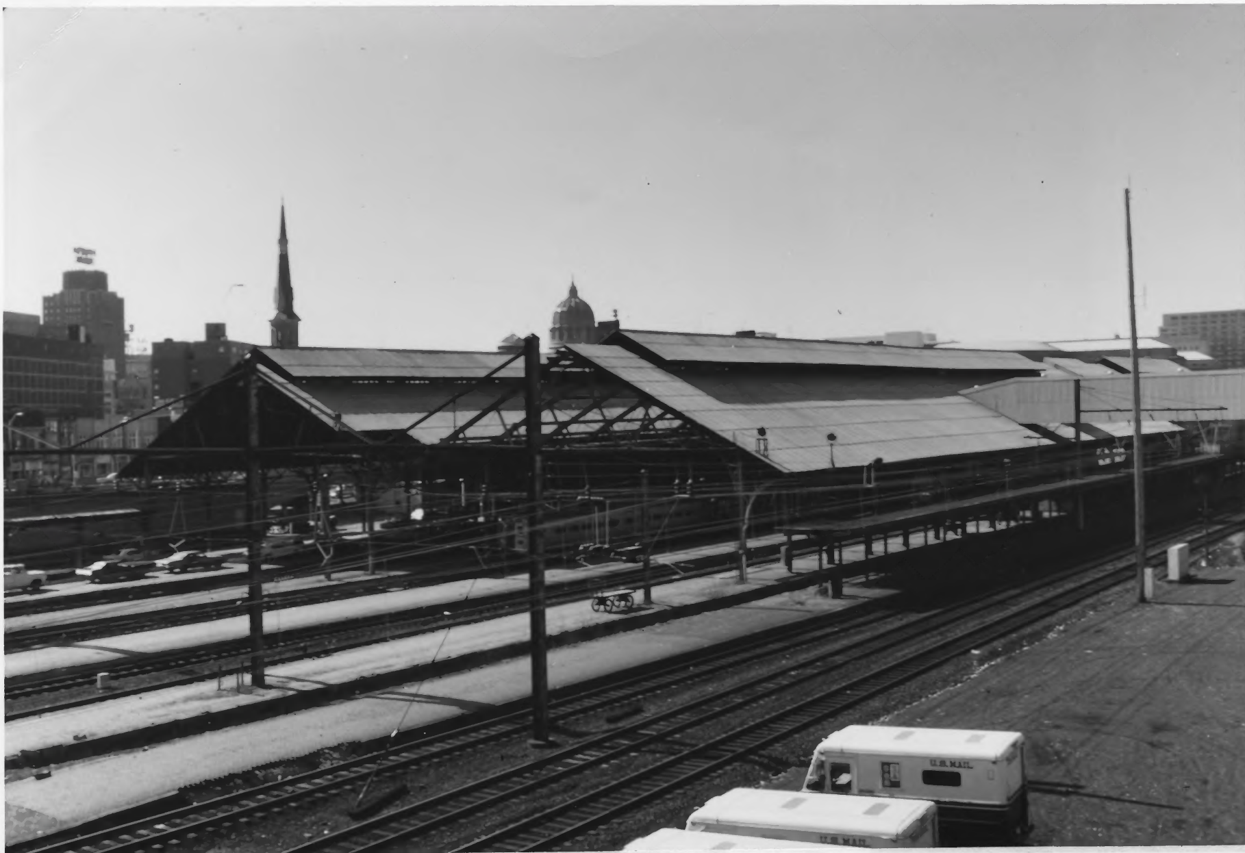
Penn Central Railroad Station and Shed, Harrisburg, Pennsylvania Aberdeen Street