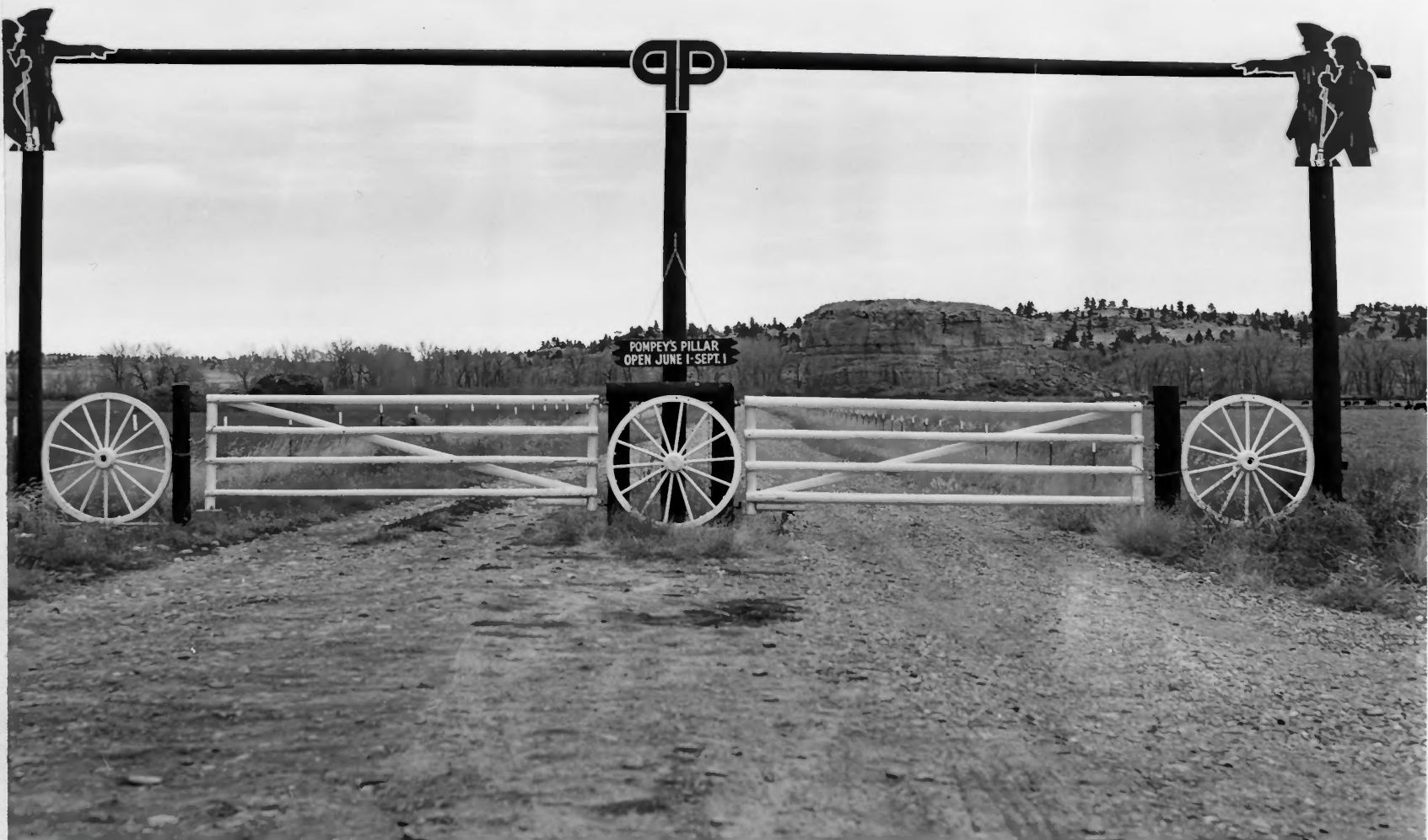
POMPEY'S PILLAR NATIONAL HISTORICAL LANDMARK Entrance gate to the Pillar