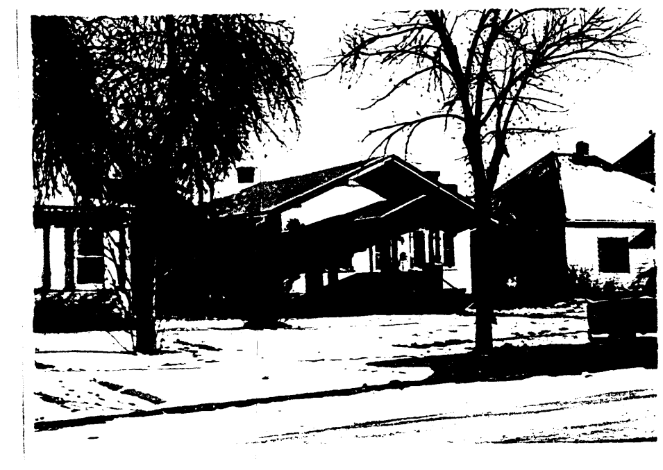
Roll# 33 Frame# 24 Roll# 38 Frame# 18

<u>Legal Description</u>:Morris-Smith-McCulloh Addition, Block 2, lots 5 & 6