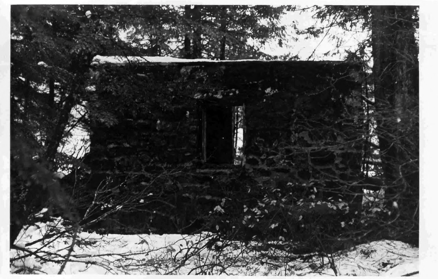
1896 Halibut Engineer Nov Bay, Storehouse Portland Canal #3