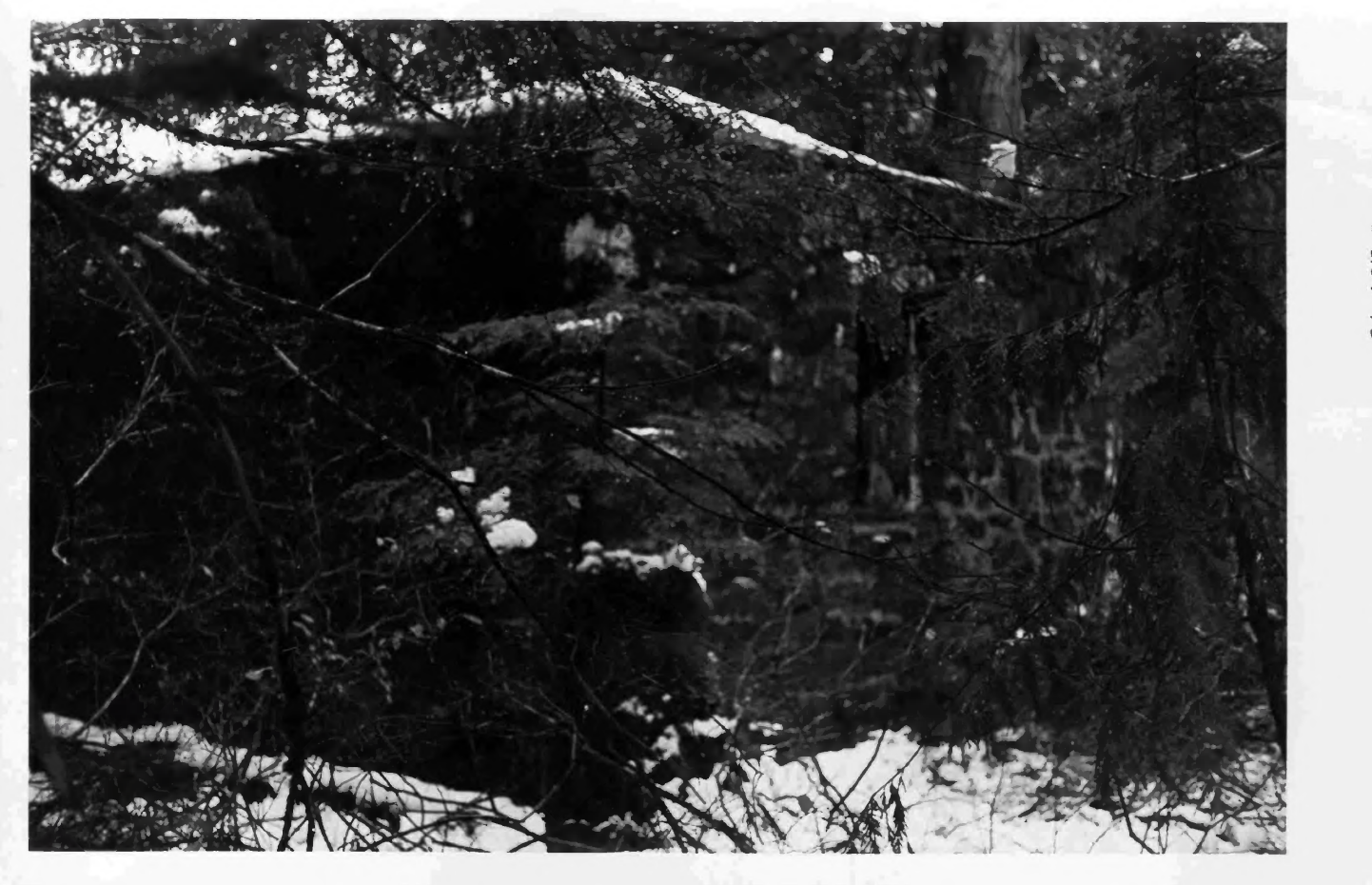
1896 Engineer Storehouse Halibut Bay, off Pon 1 Nov off Portland Canal #3