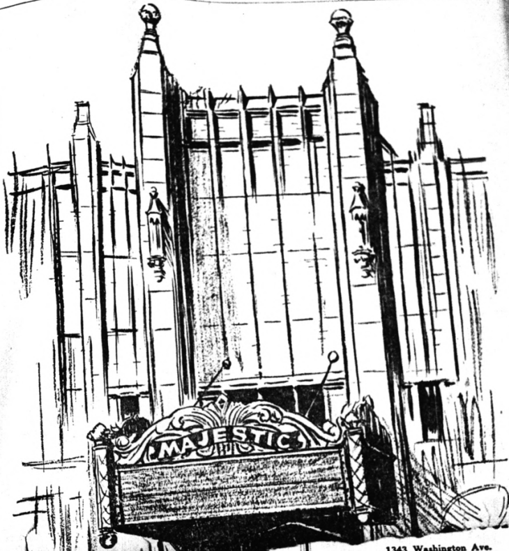
1343 Washington Ave.

...the artist de... ...the grandest of... ...the history in the... ...is equipped to... ...of that rapidly... ...of the city and the... ...with the procedure... ...in the structure... ...and stage pump... ...heater of water is... ...for staging the... ...of "Uptown." ...is the pride of "U... ...of Racine." The... ...of the tribute which... ...paid them in mak... ...investment in their... ...They will enjoy... ...appreciation in a... ...by attending the... ...and in various... ...town in this special... ...if they be Majestic... ...day, but as the... ...now pass in proced... ...continue in that role... ...interest of build... ...the new theater as... ...interest, ever ready... ...in the still greater... ..."Uptown—the Heart... ...is the biggest aim... ...has come to that... ...and reflects the spirit... ...in which pervades... ...to "Uptown," said... ...of that dis... ...the most welcomed... ...people could have... ...another expression... ...to the worth of... ...greater project to the... ...well as the residents... ...will.