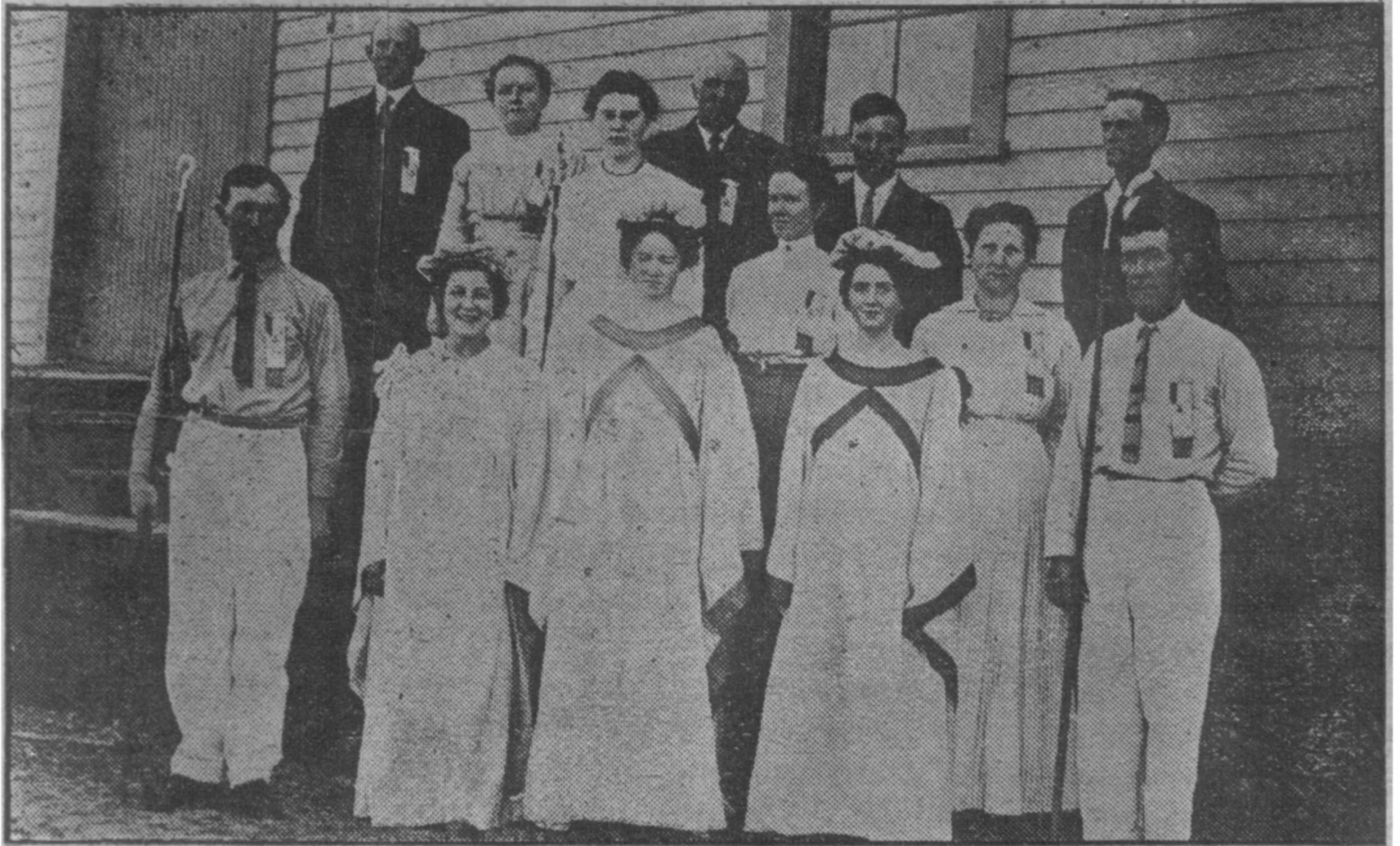
MT. VIEW DEGREE TEAM, CORVALLIS