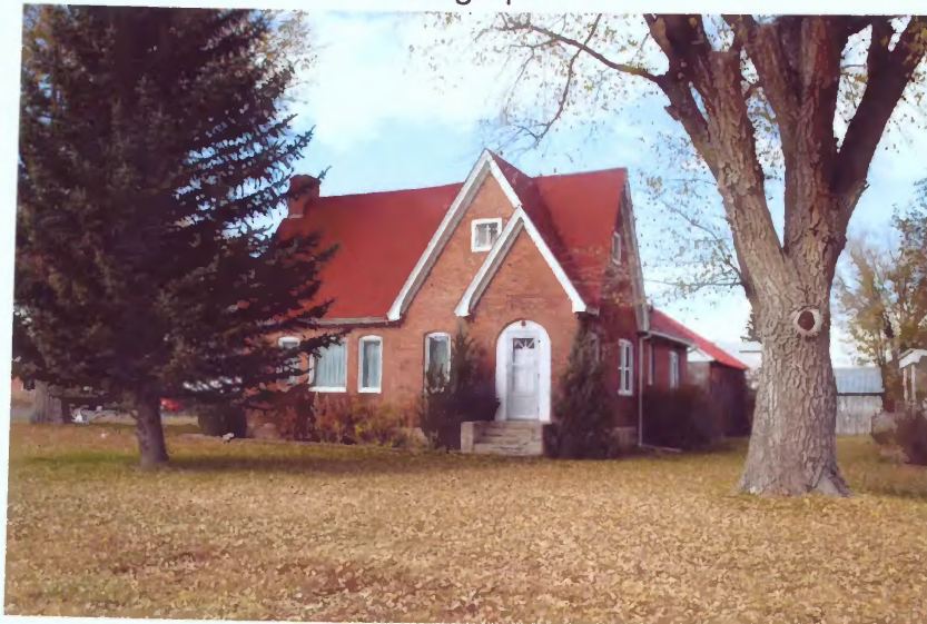
190 W. 100 South Photograph 43