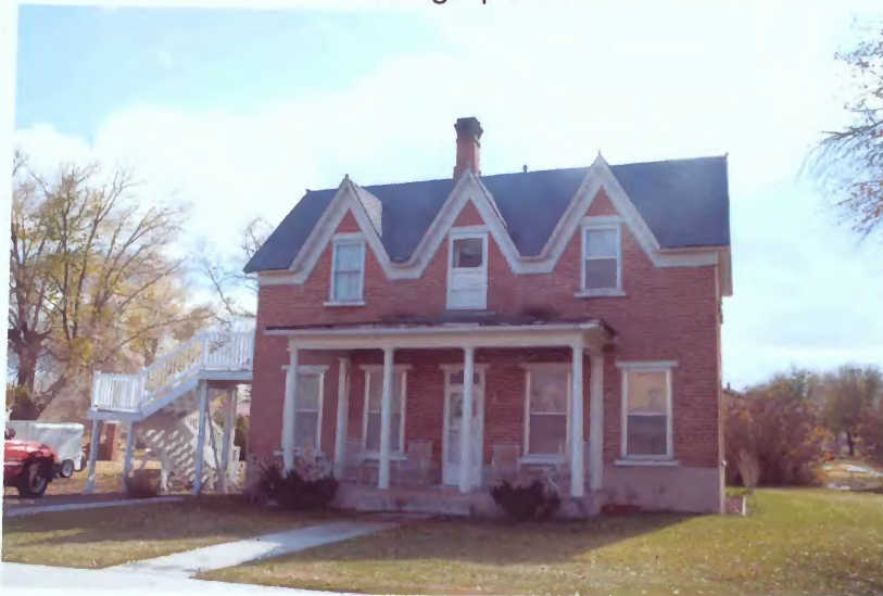
95 W. Center Street Photograph 15