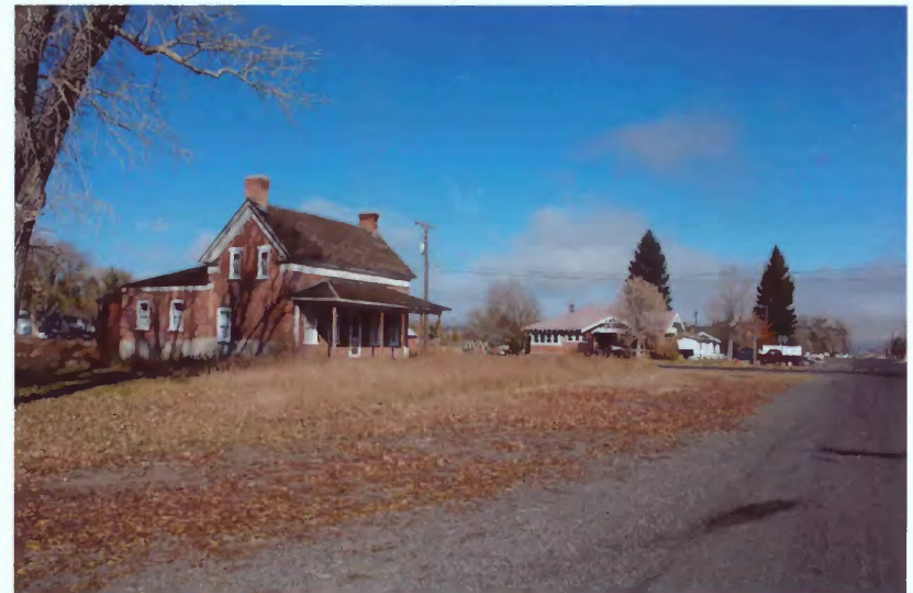
View of 100 West from approximately 50 South Photograph 4