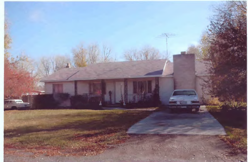
241 S. 100 West Photograph 62