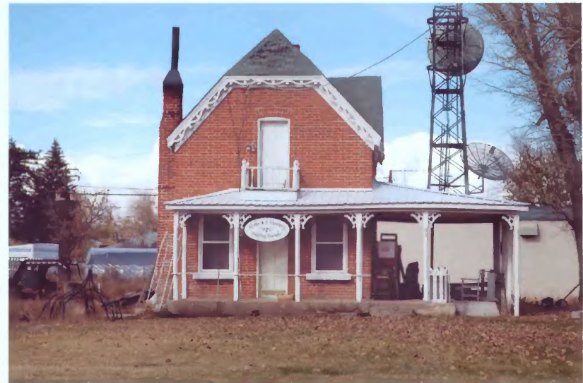
88 S. Main Street Photograph 22