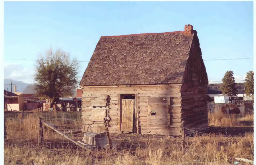
387 E. 200 South Photograph 8