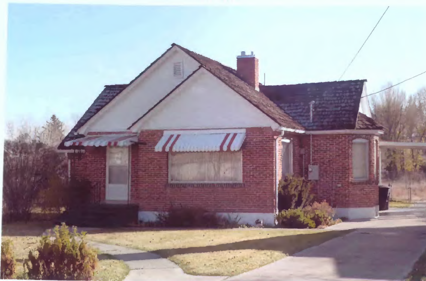
280 N. 100 West Photograph 55