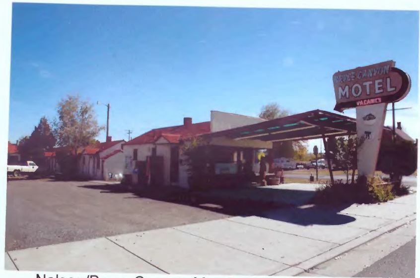
Nelson/Bryce Canyon Motel, 302? N. Main Street Photograph 66