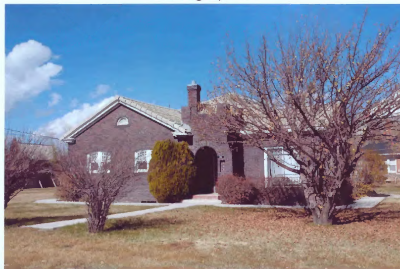
35 W. 200 North Photograph 36