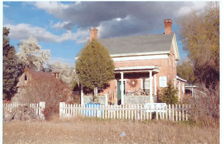
185 S. 300 East Photograph 12