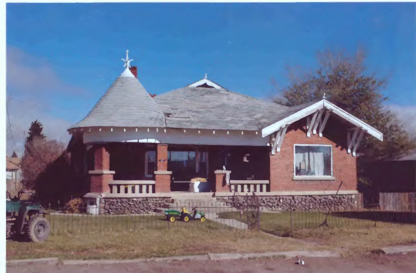
121 E. 100 North Photograph 40