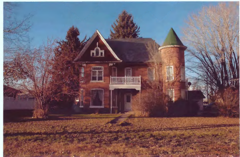
182 S. 200 East Photograph 20