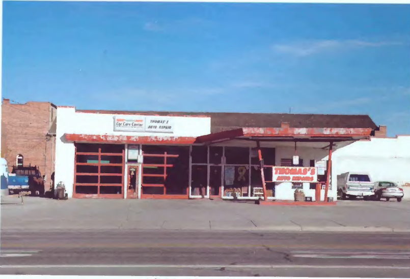
18 N. Main Street Photograph 69