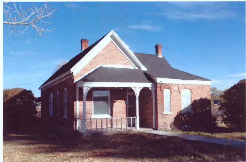
117 S. Main Street Photograph 16