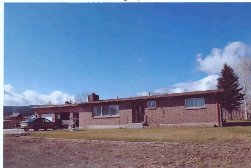
360 S. 200 West Photograph 60