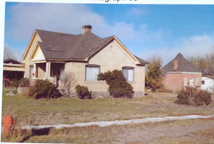
110 W. 100 North Photograph 35