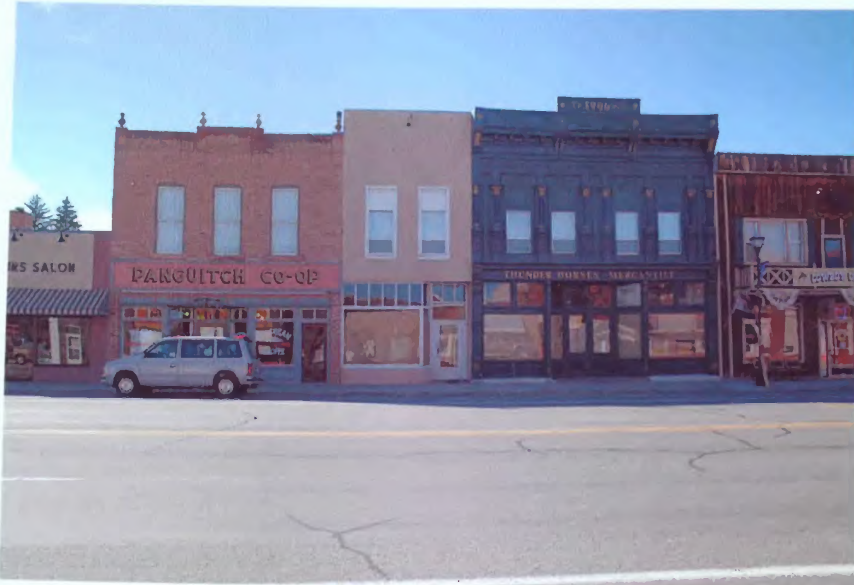
41-47 N. Main Street Photograph 5