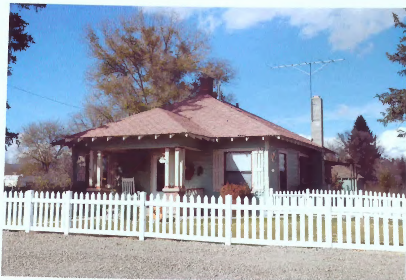
50 W. 200 South Photograph 33