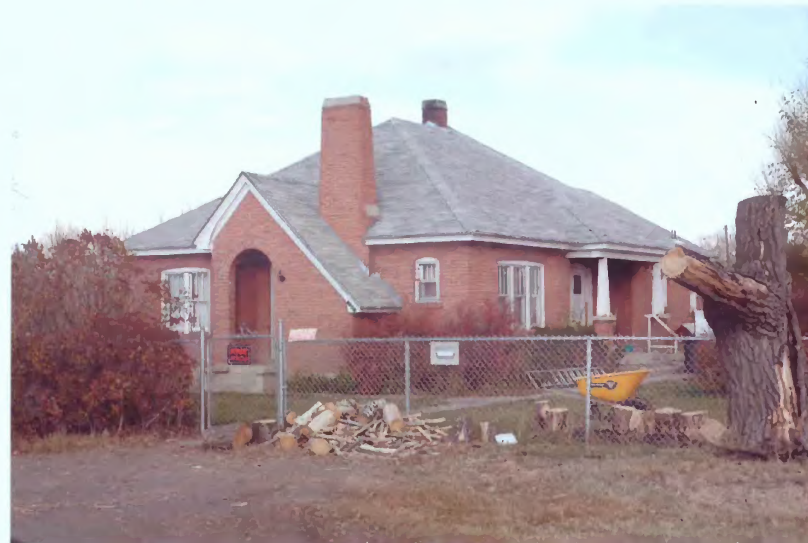
190 N. 200 East Photograph 46