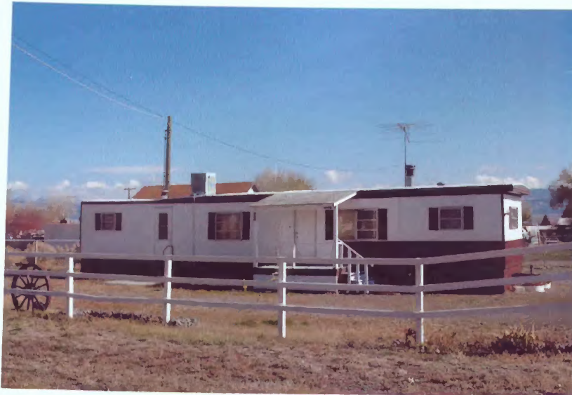
335 S. 300 West Photograph 61