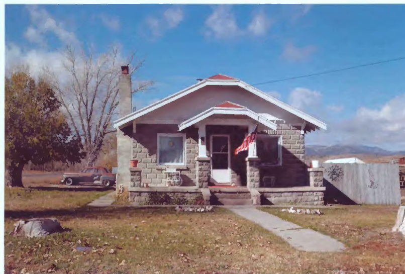
213 N. 200 West Photograph 34