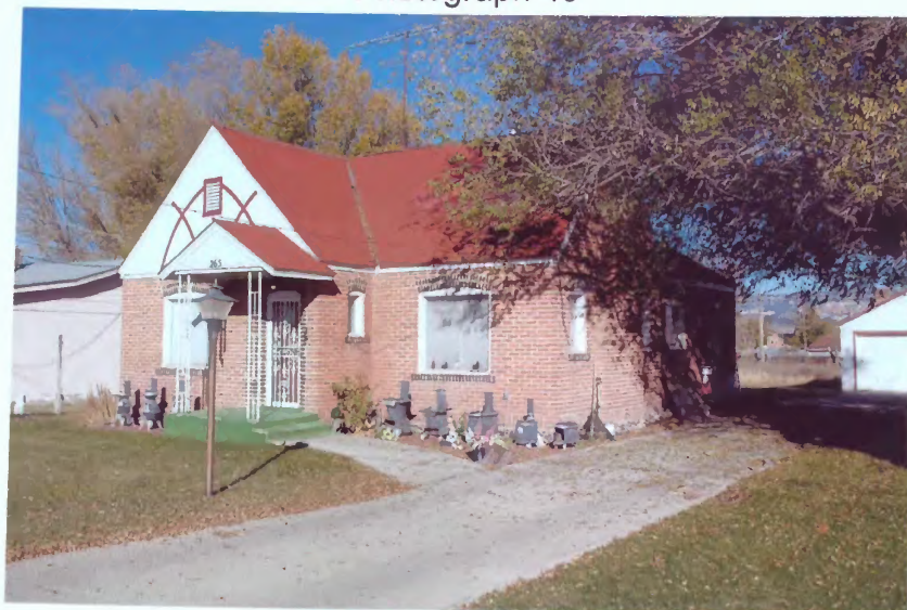
265 S. Main Street Photograph 47