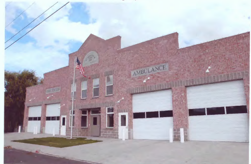
Panguitch Fire Station, 46 N. 100 East Photograph 72