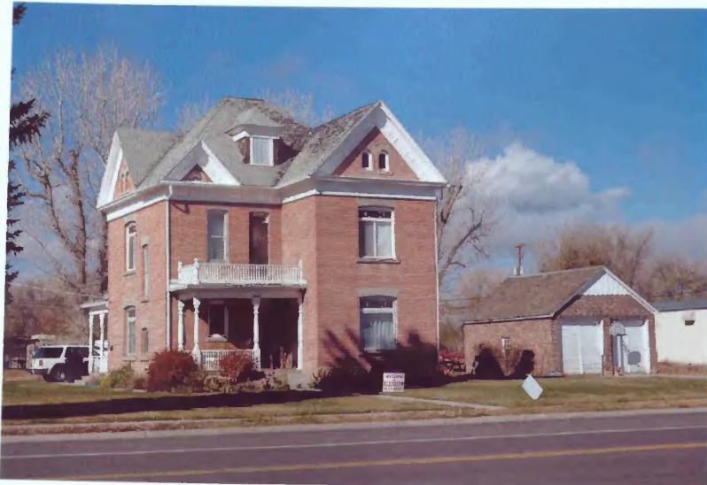
98 S. Main Street Photograph 21