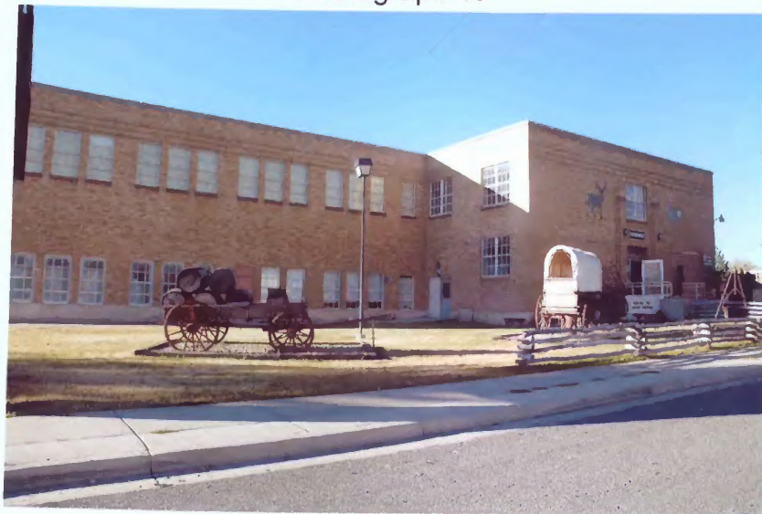
Panguitch High School, 250 E. Center Photograph 51