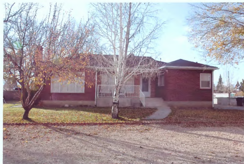
169 N. 300 East Photograph 58