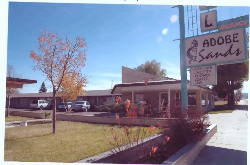
Adobe Sands, 390 N. Main Street Photograph 68