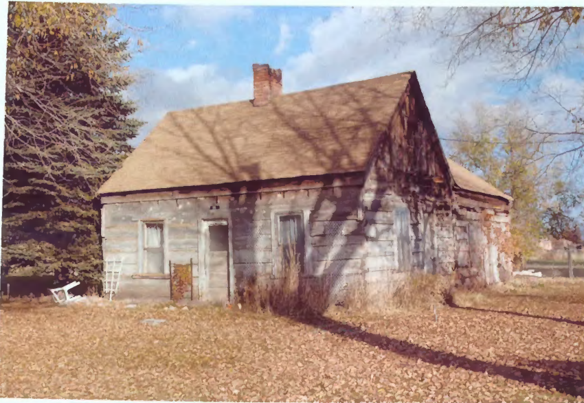
91 E. 200 North Photograph 9