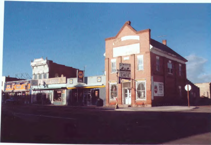
Garfield Exchange, 95 N. Main Street Photograph 13