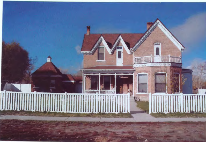
109 W. 100 North Photograph 17