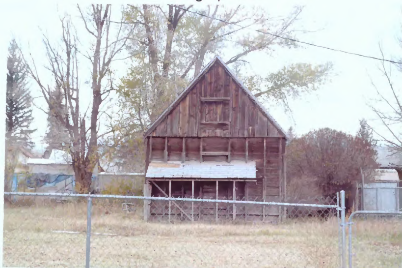
95 E. 400 North Photograph 27