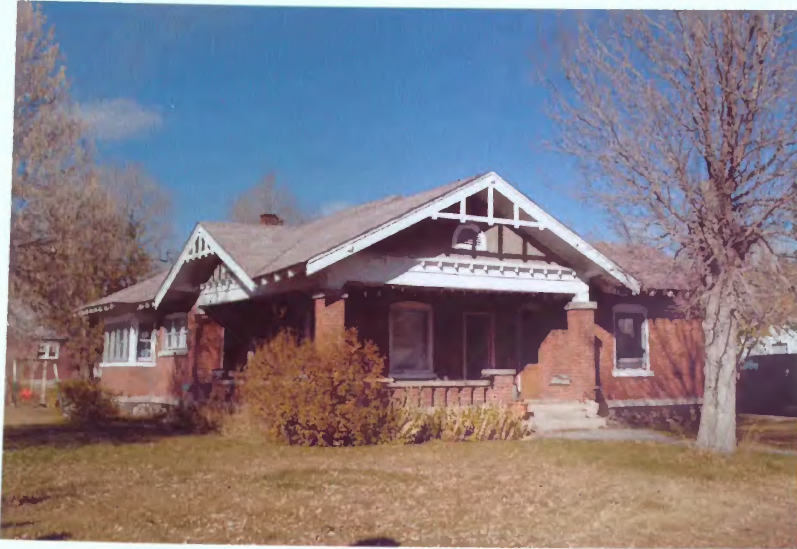
15 N. 100 West Photograph 41