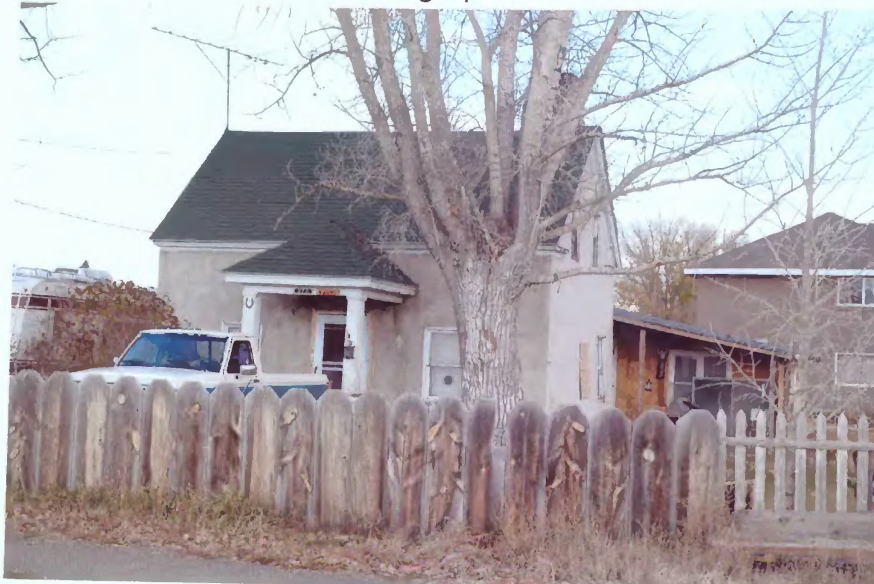
275 S. 100 East Photograph 11