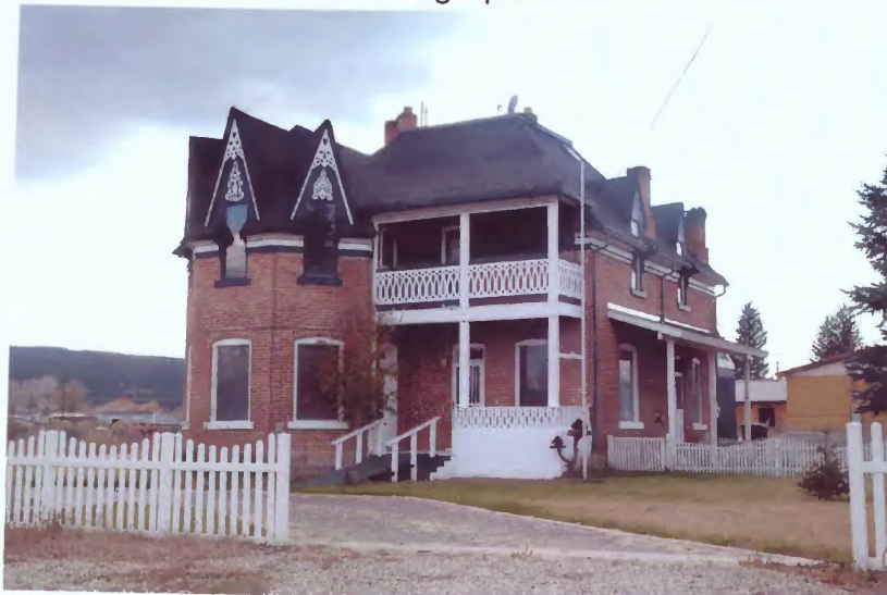
210 S. 100 East Photograph 23