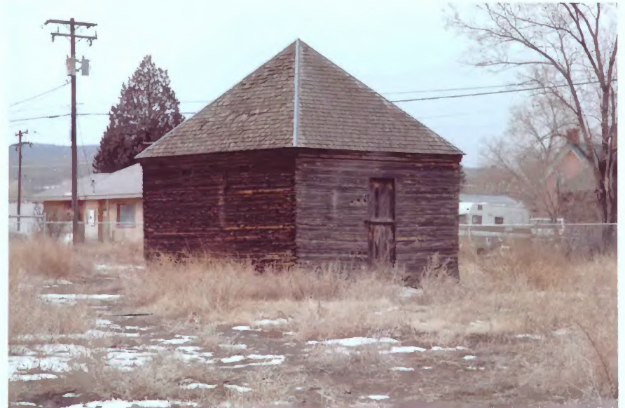
191? N. Main Street Photograph 10