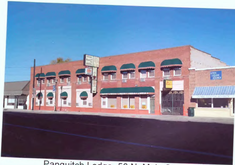
Panguitch Lodge, 50 N. Main Street Photograph 65