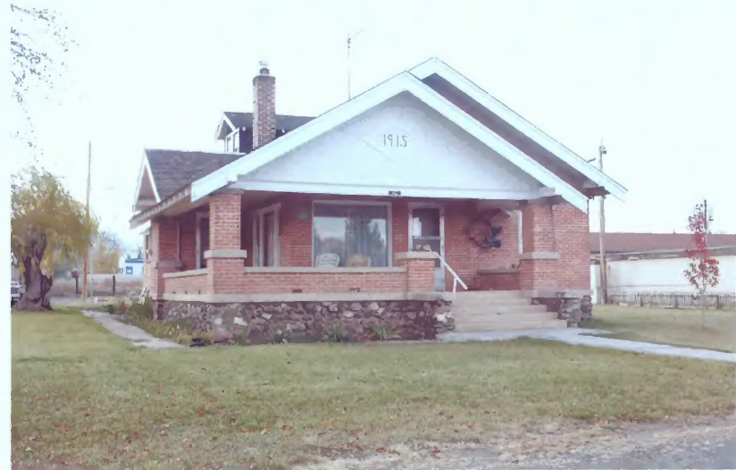
40 S. 200 East Photograph 38