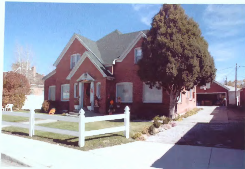
140 N. Main Street Photograph 45