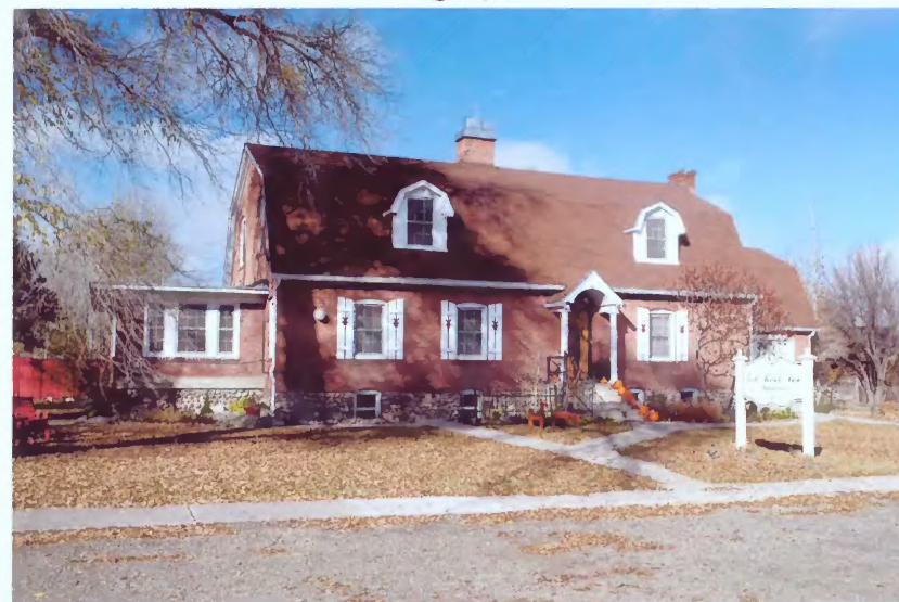
161 N. 100 West Photograph 48