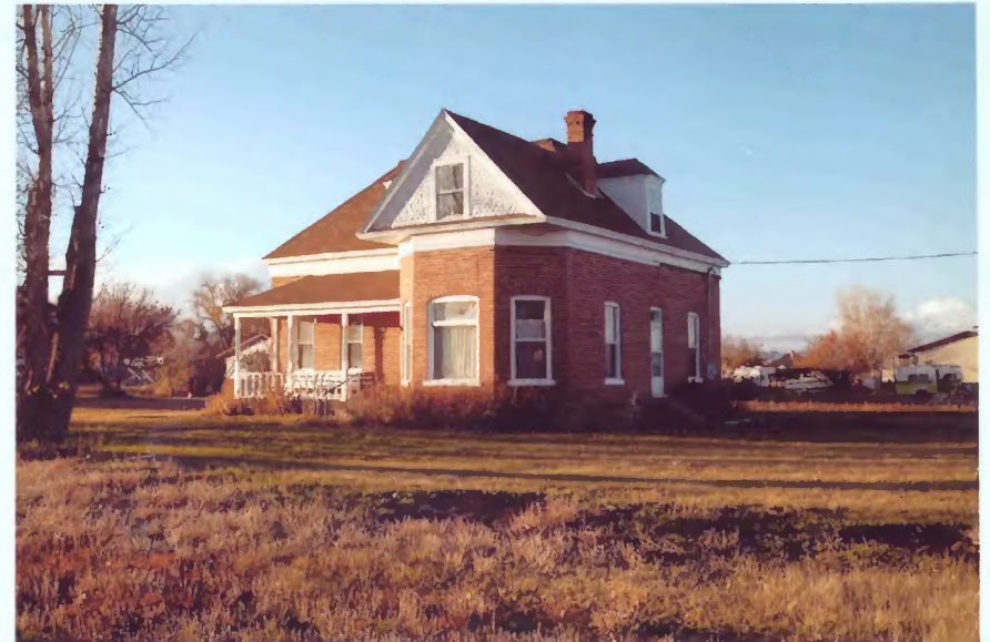
Heywood House, 375 E. 100 North on an acre of land Photograph 6