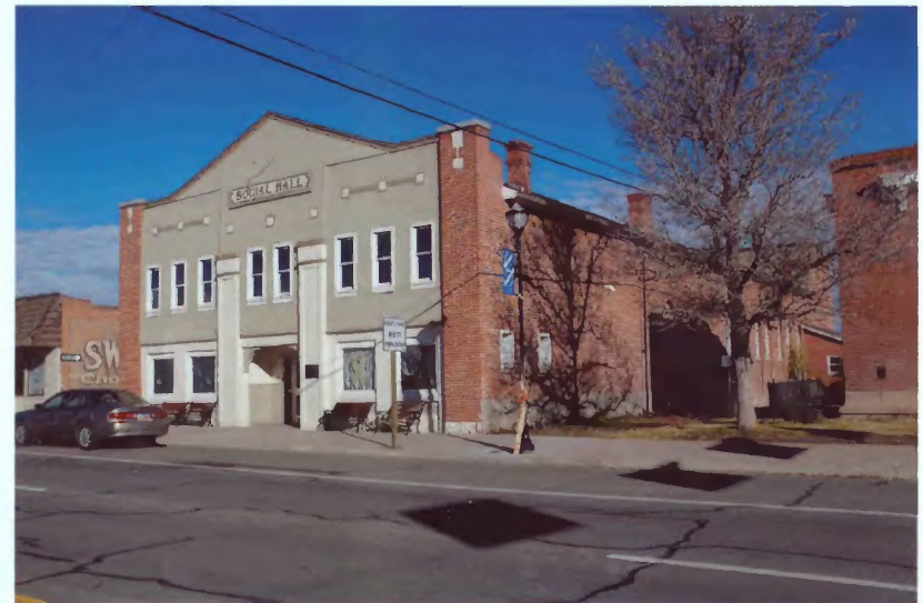
Panguitch Social Hall, 55 E. Center Street Photograph 2