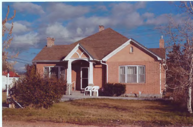
57 E. 300 North Photograph 54