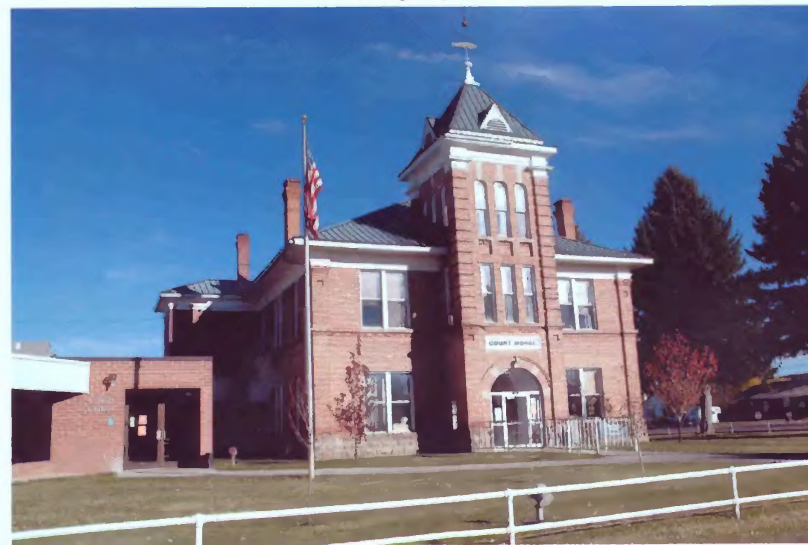
55 S. Main Street Photograph 28