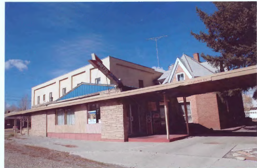
Cameron Hotel complex, 78 W. Center Street Photograph 64