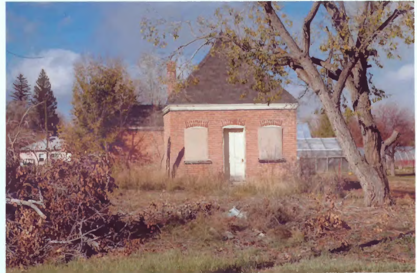
Rear of 110 W. 100 North Photograph 18