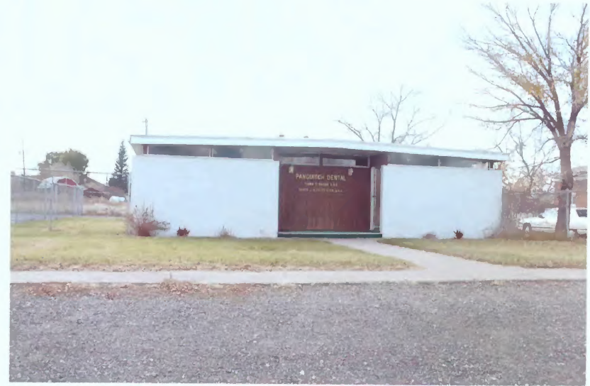
Panguitch Dental, 75 N. 200 East Photograph 70