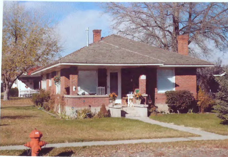
205 N. 100 West Photograph 37