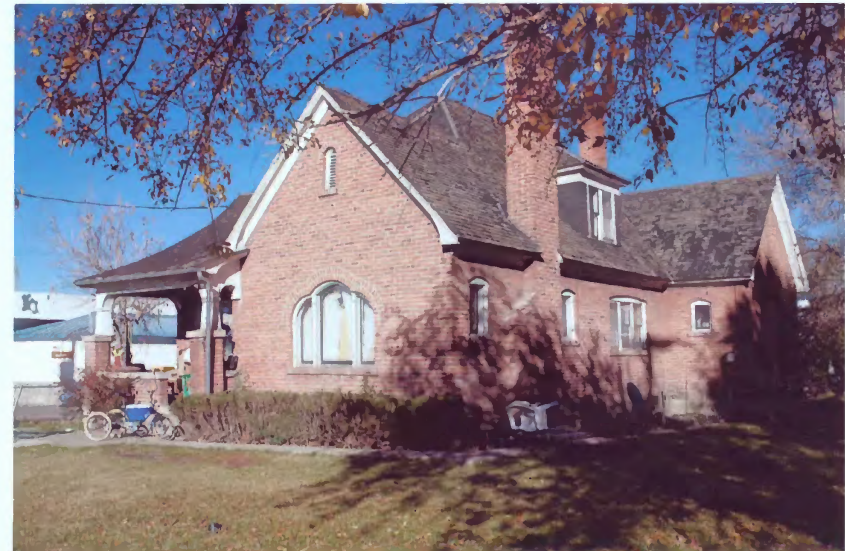
25 S. Main Street Photograph 44