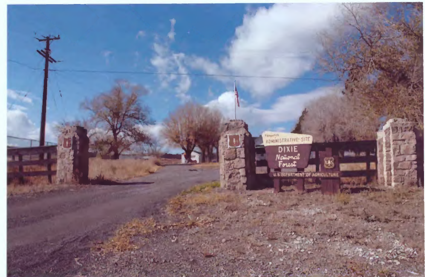
Entrance to Panguitch Administrative Site Photograph 52