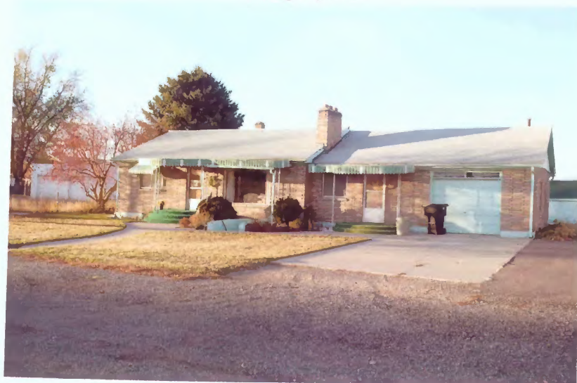
151 E. 100 South Photograph 59