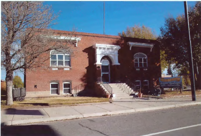
Panguitch Carnegie Library, 75 E. Center Street Photograph 1