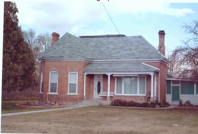
220 N. 200 East Photograph 19