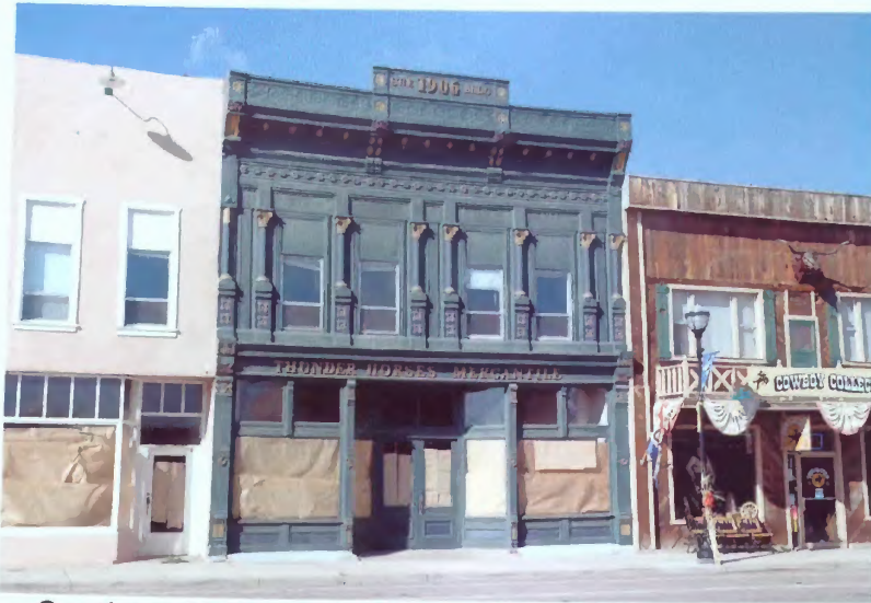
Southern Utah Equitable Building, 47 N. Main Street Photograph 29