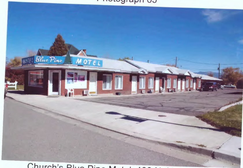
Church's Blue Pine Motel, 130 N. Main Street Photograph 67