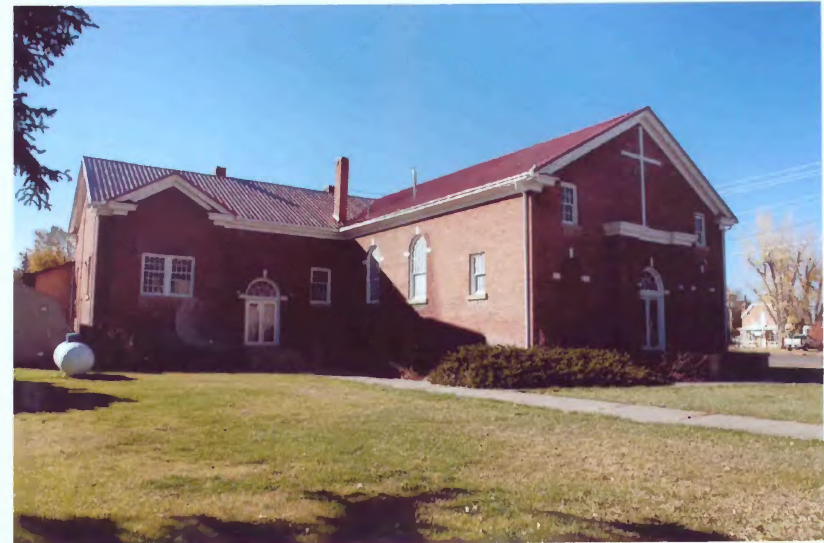
LDS Church South Ward Meetinghouse, 110 S. Main Street