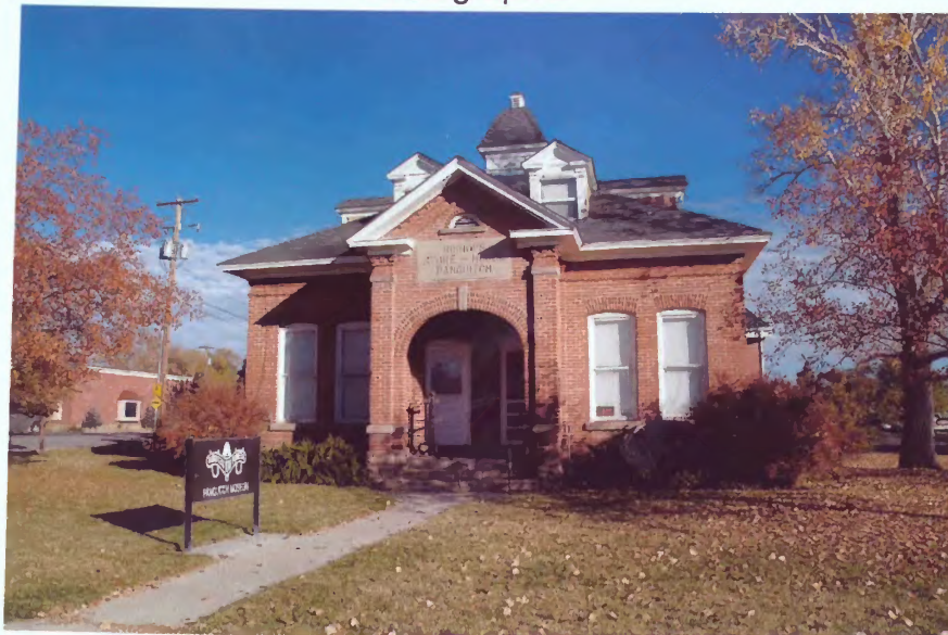
Panguitch Tithing Office, 105 E. Center Street Photograph 7