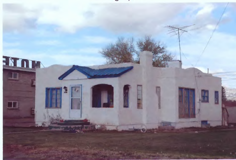
49 S. 100 East Photograph 56