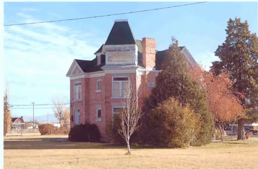
329 E. Center Street Photograph 24