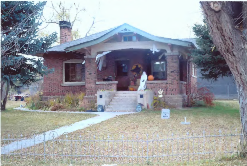
Owens House, 95 N. 100 East Photograph 3