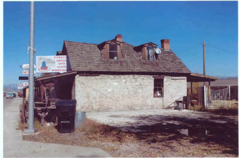
506 N. Main Street Photograph 14