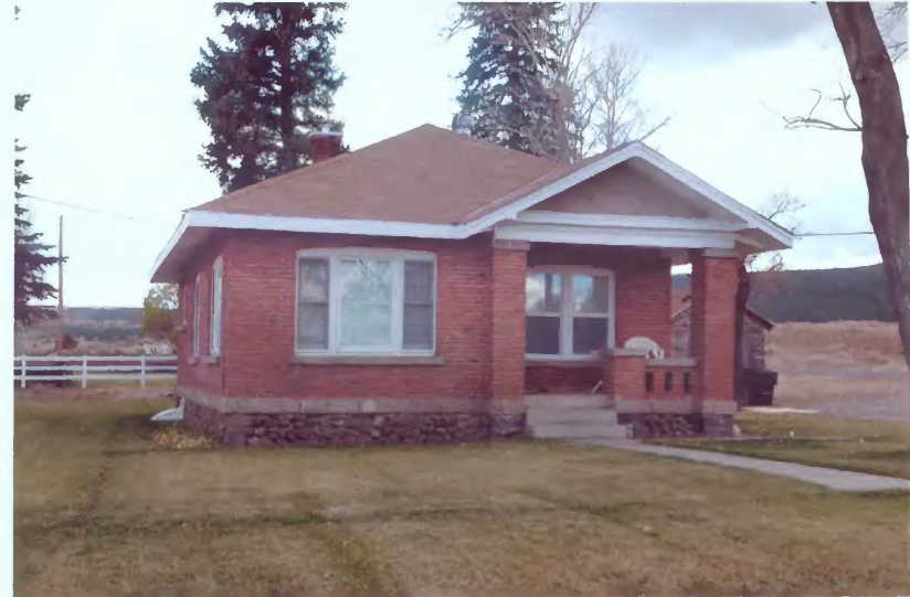
289 W. 400 South Photograph 42