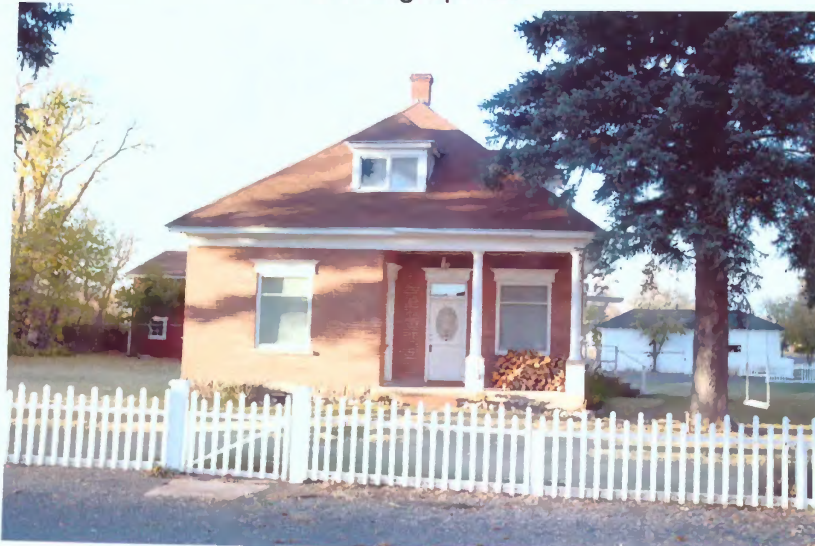
93 E. 100 North Photograph 31