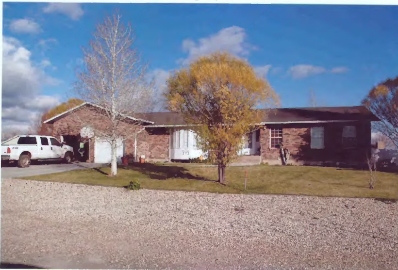
167 E. 400 North Photograph 71