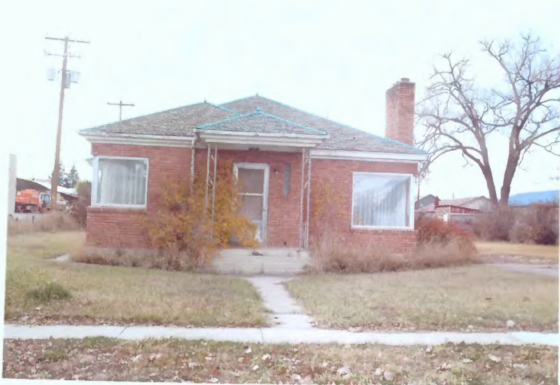
55 N. 100 East Photograph 57