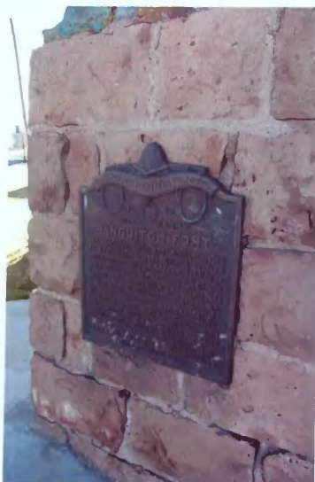
Panguitch Fort Marker, erected 1940, 200 E. Center Street