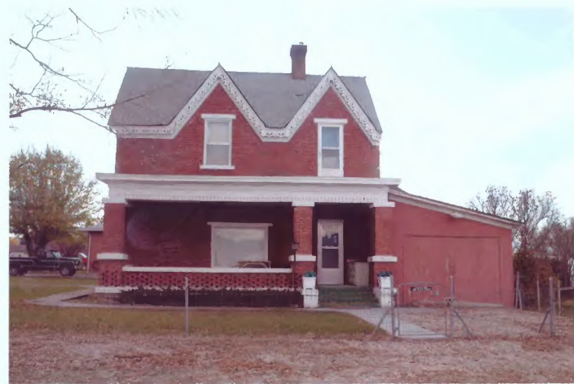
90? S. 200 East Photograph 30