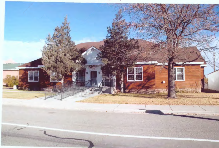
Panguitch Hospital, 145 E. Center Street Photograph 63