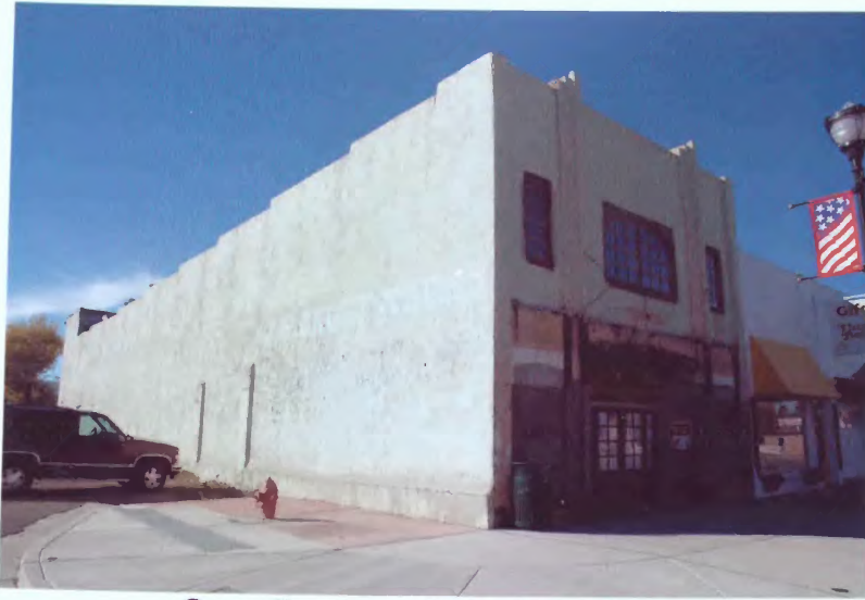
Gem Theater, 105 N. Main Street Photograph 49