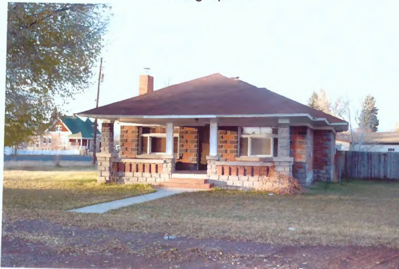
105 E. 100 North Photograph 39