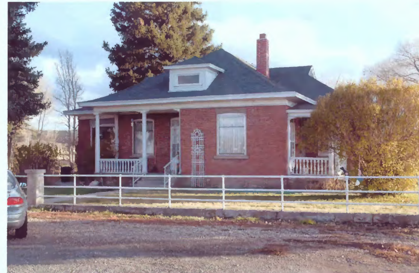
320 E. 300 South Photograph 32