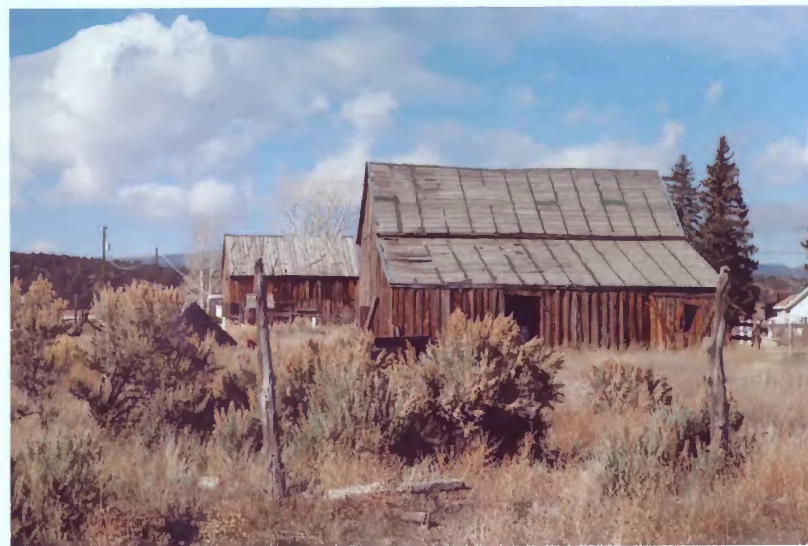
Barns associated with 418 S. 200 West Photograph 26