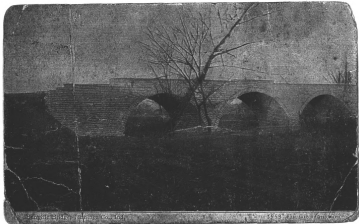
Bridge at [illegible] [illegible] [illegible]