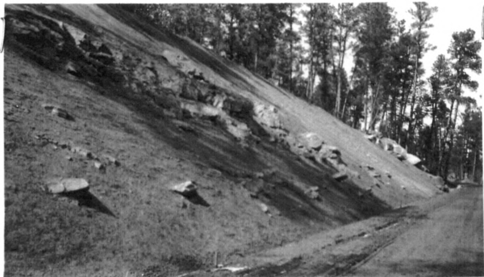
"Cut slope after flattening and rounding. Note all existing rocks strongly imbedded, not disturbed."