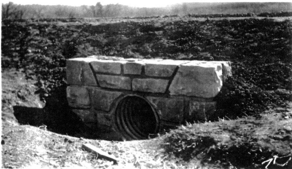
"Showing headwall typical of those constructed along entrance highway"