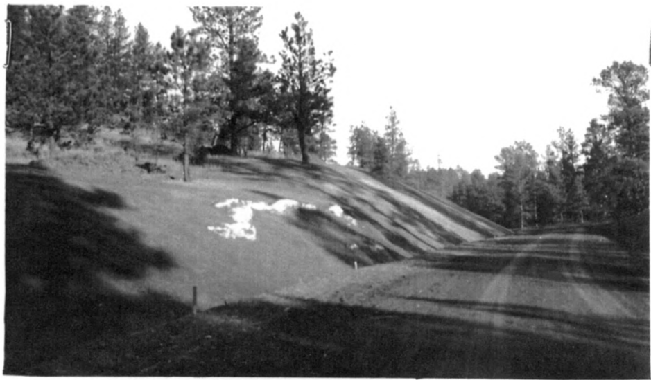
"Showing cut slope after flattening and rounding."