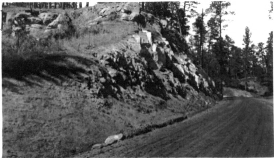
"Showing manner in which rock cut slopes left in rough state."