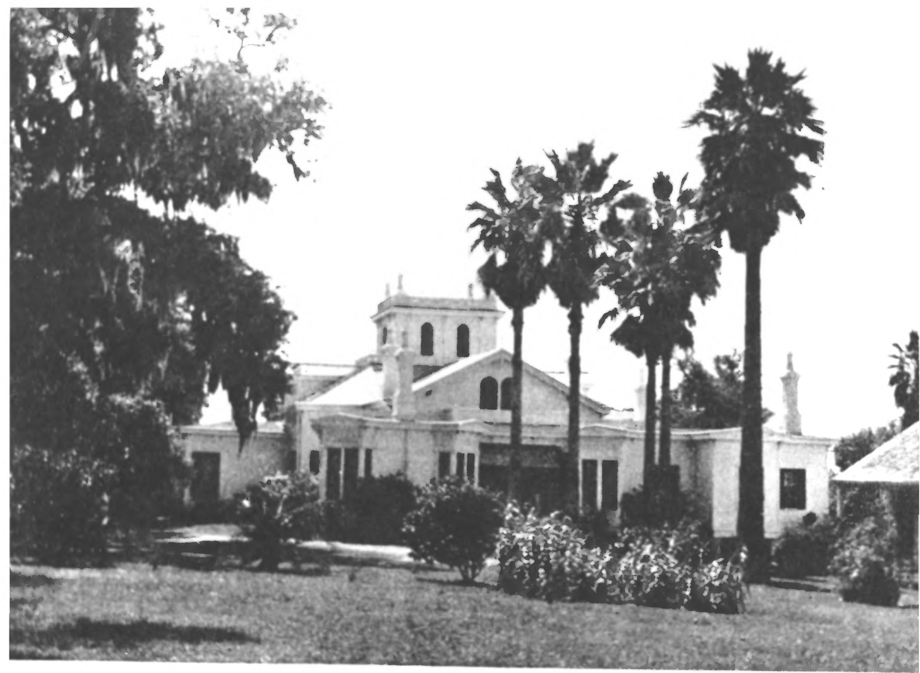
Magnificent mansion built by Joseph Jefferson at Jefferson Island.