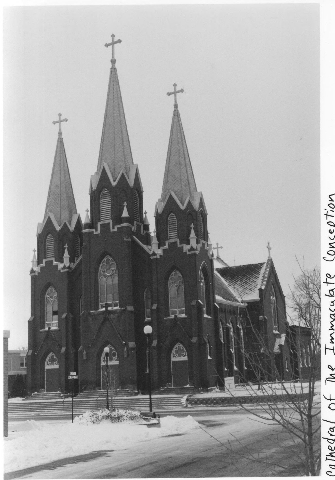
Cathedral of The Immaculate Conception Polk Co, Mn