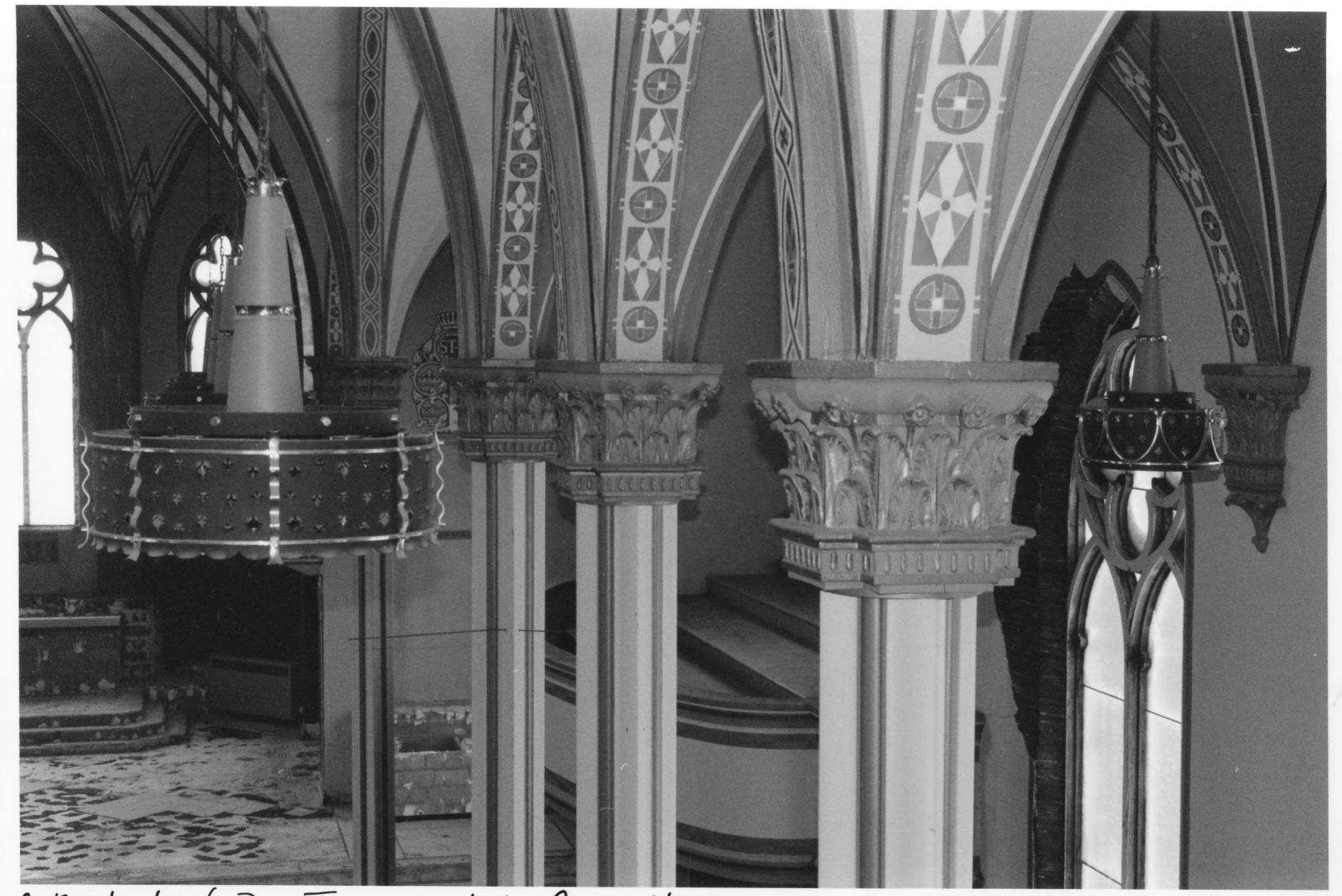
Cathedral of The Immaculate Conception POIK Co., Mn 013278-9A/10