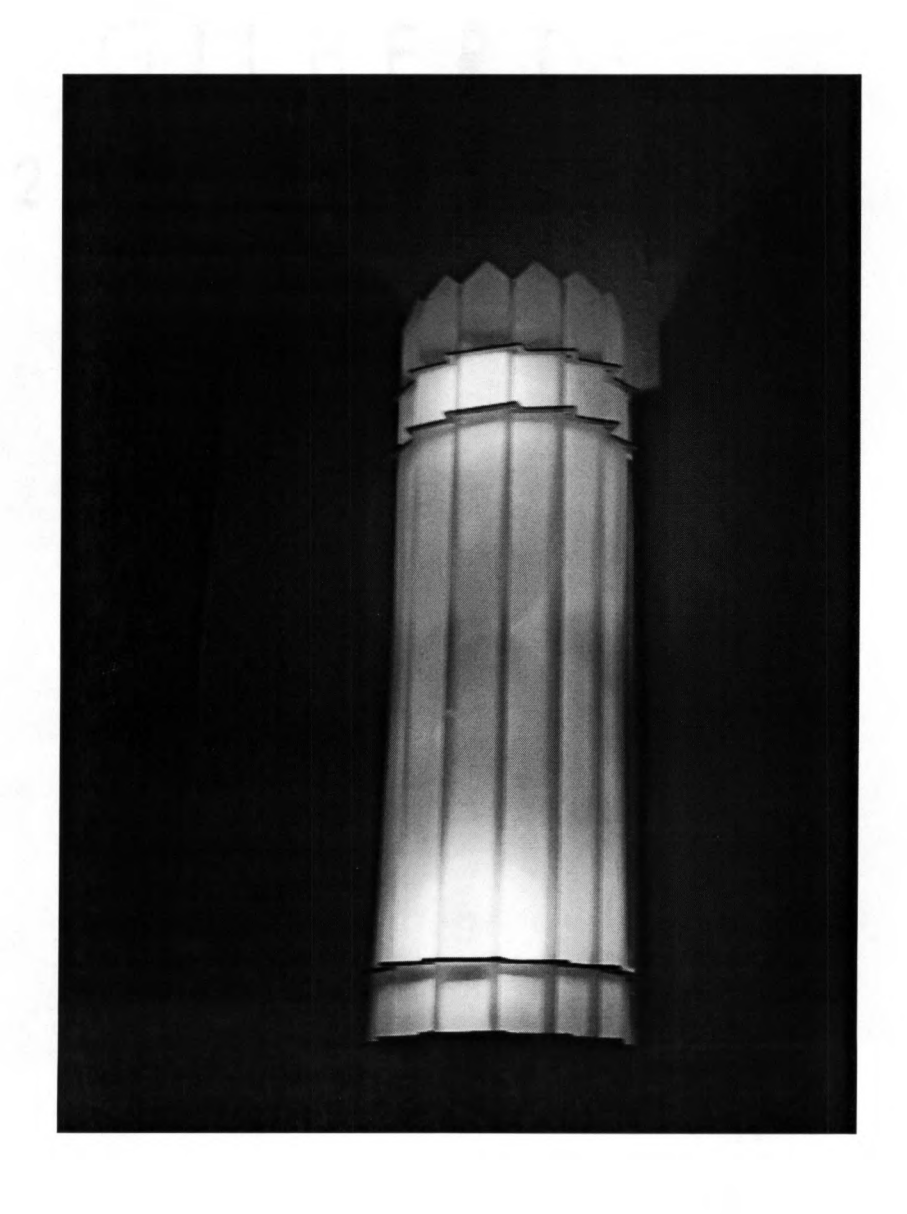
Figure 7-2: Art Deco Wall Sconce (2006)

Luna Theater Clayton, Union County, New Mexico