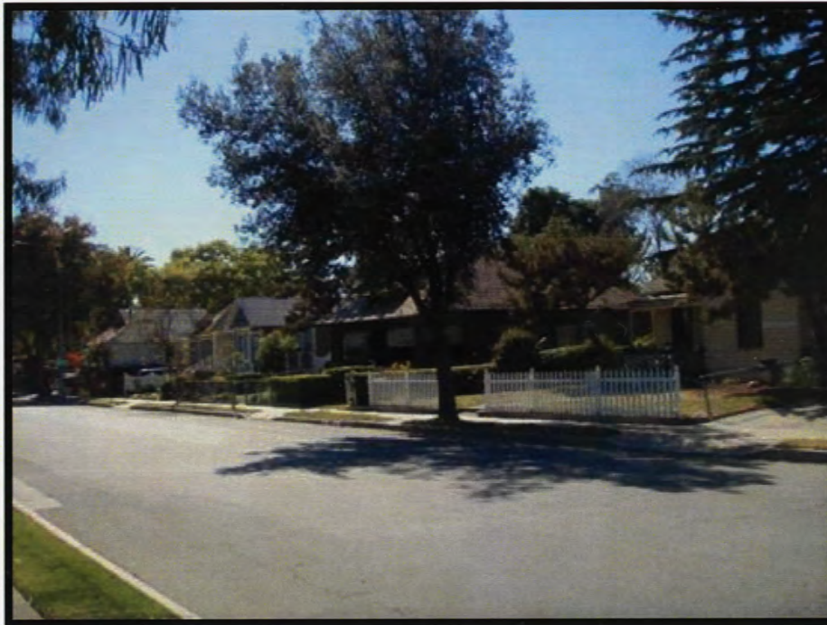
CA_Los Angeles County_New Fair Oaks Historic District_0001