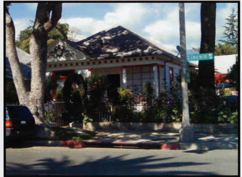
CA_Los Angeles County_New Fair Oaks Historic District_0002