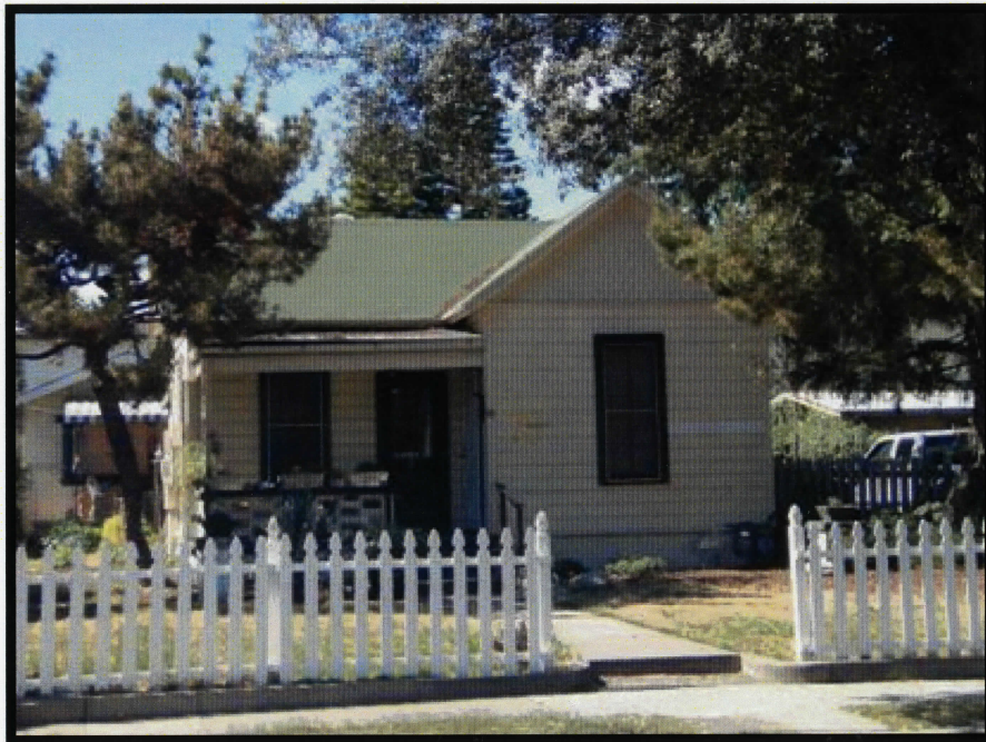
CA_Los Angeles County_New Fair Oaks Historic District_0007