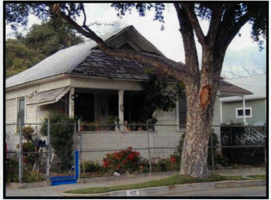
CA_Los Angeles County_New Fair Oaks Historic District_0010