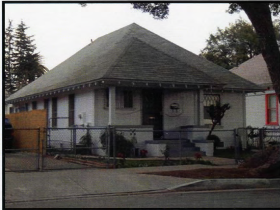
CA_Los Angeles County_New Fair Oaks Historic District_0003