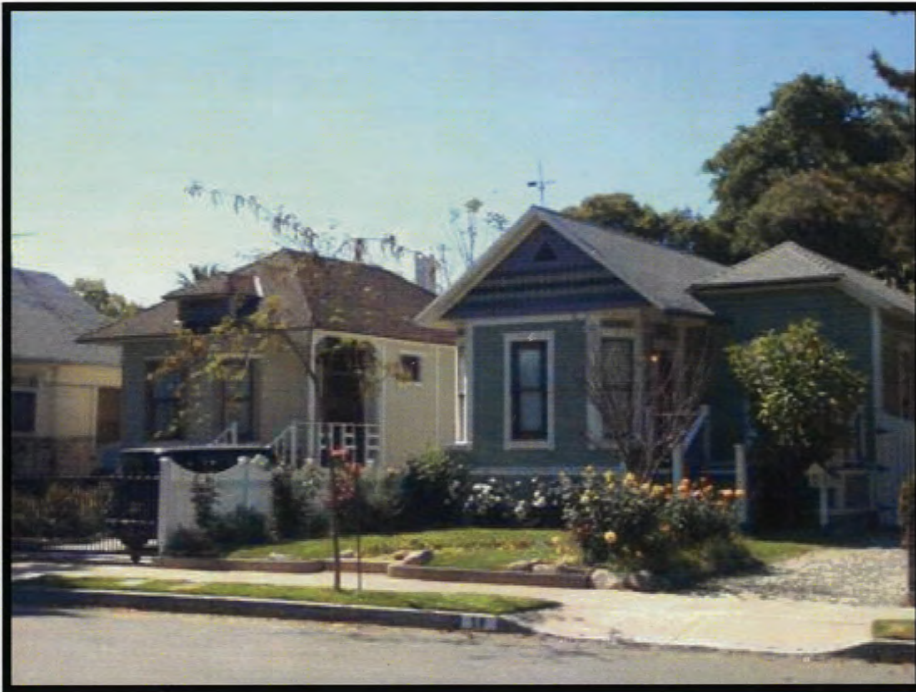
CA_Los Angeles County_New Fair Oaks Historic District_0009