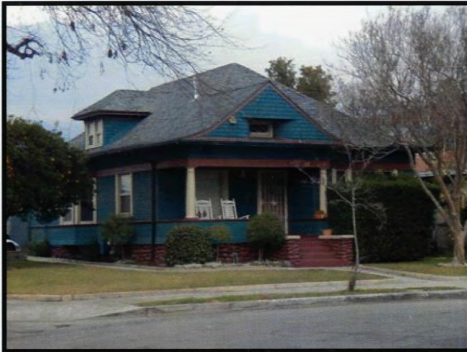
CA_Los Angeles County_New Fair Oaks Historic District_0005