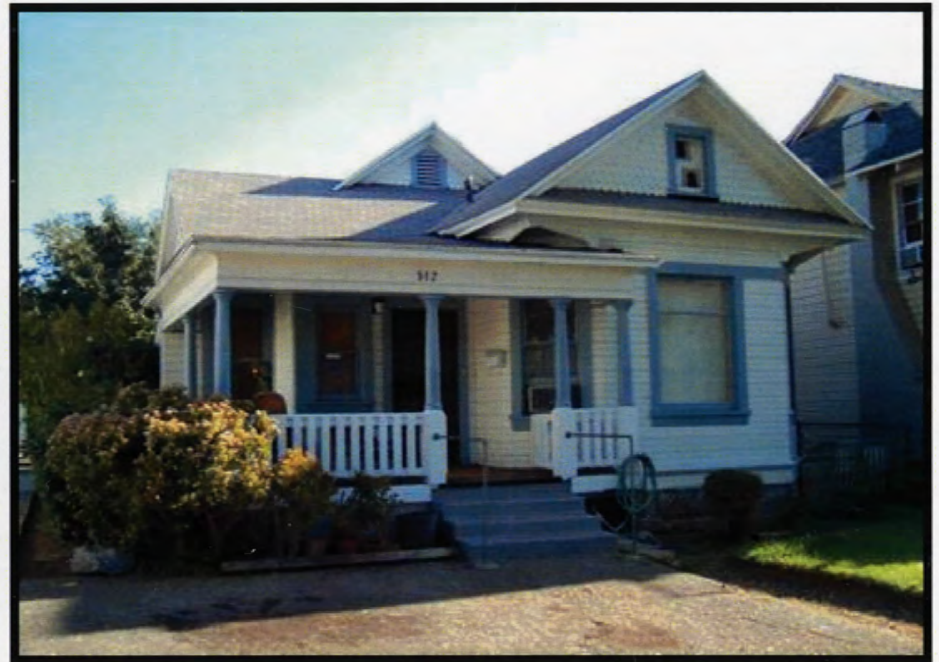
CA_Los Angeles County_New Fair Oaks Historic District_0004