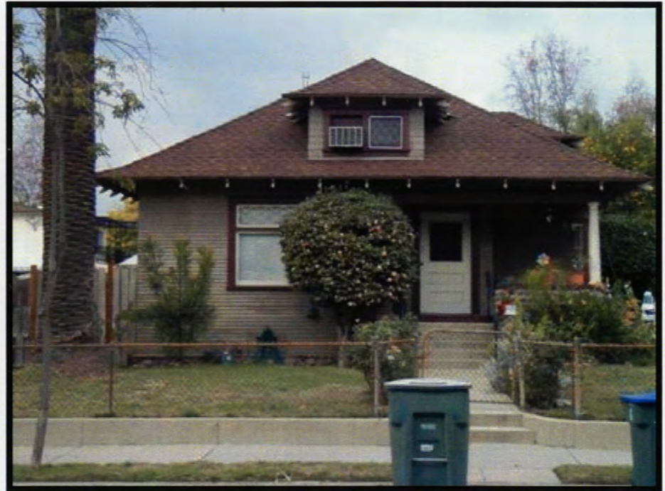
CA_Los Angeles County_New Fair Oaks Historic District_0006