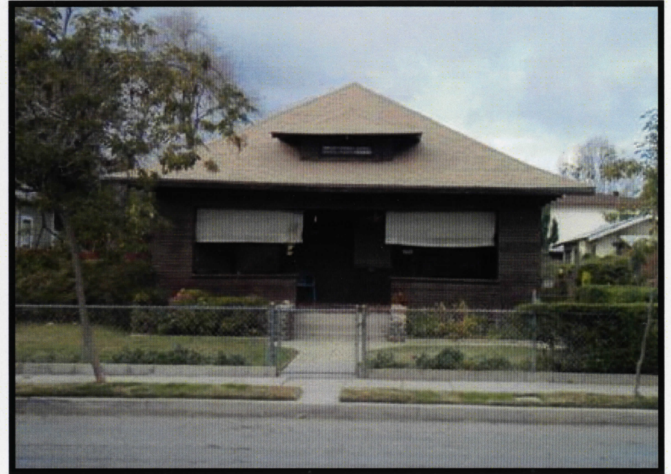
CA_Los Angeles County_New Fair Oaks Historic District_0008