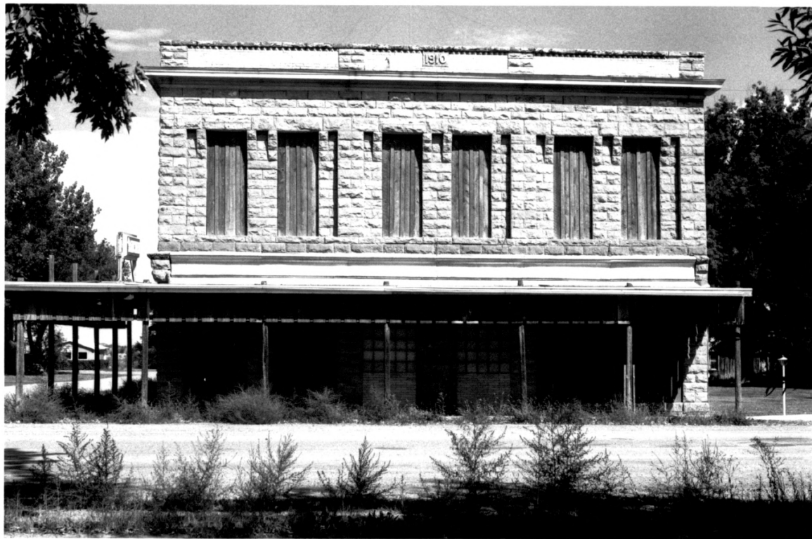
Woodmen Hall, Lawrence County, SD, No. 2