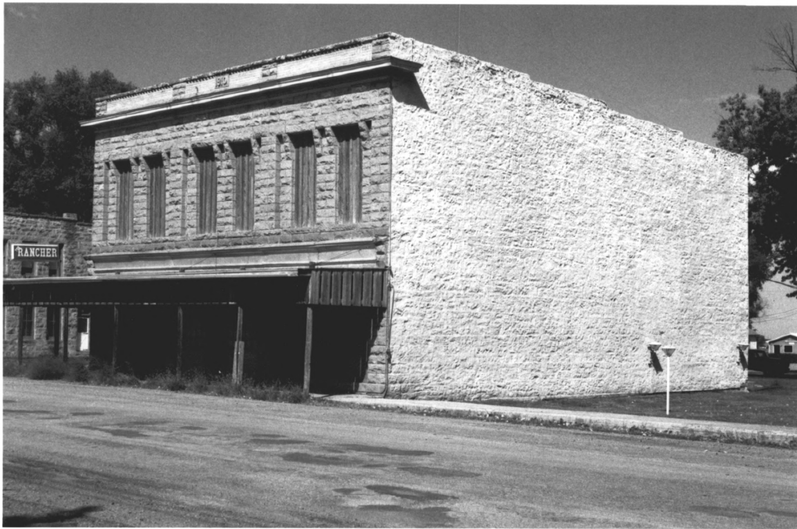
Woodmen Hall, Lawrence County, SD, No. 1