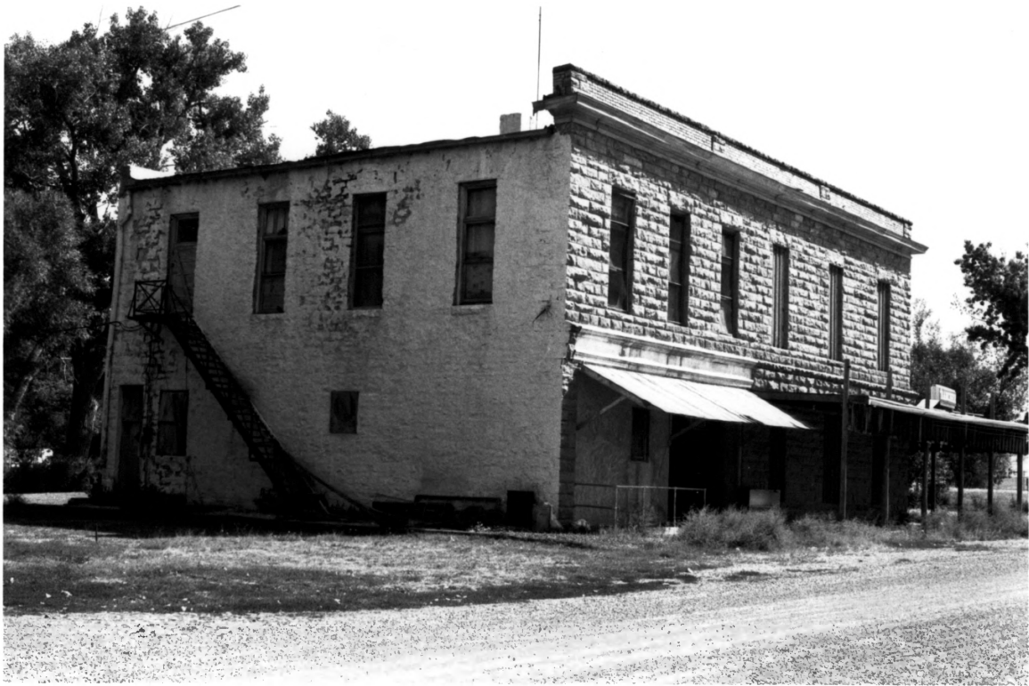
Woodmen Hall, Lawrence County, SD, No. 4