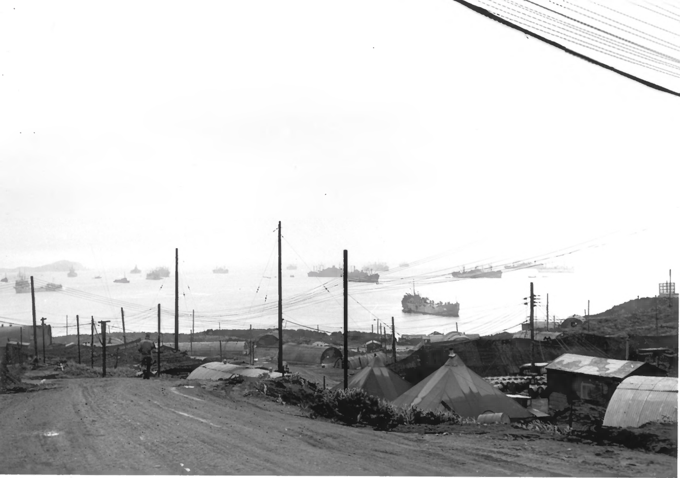
1. American convoy at anchor in Kuluk Bay, Adak, assembling for the invasion of Japanese-held Kiska Island. ca. August, 1943.