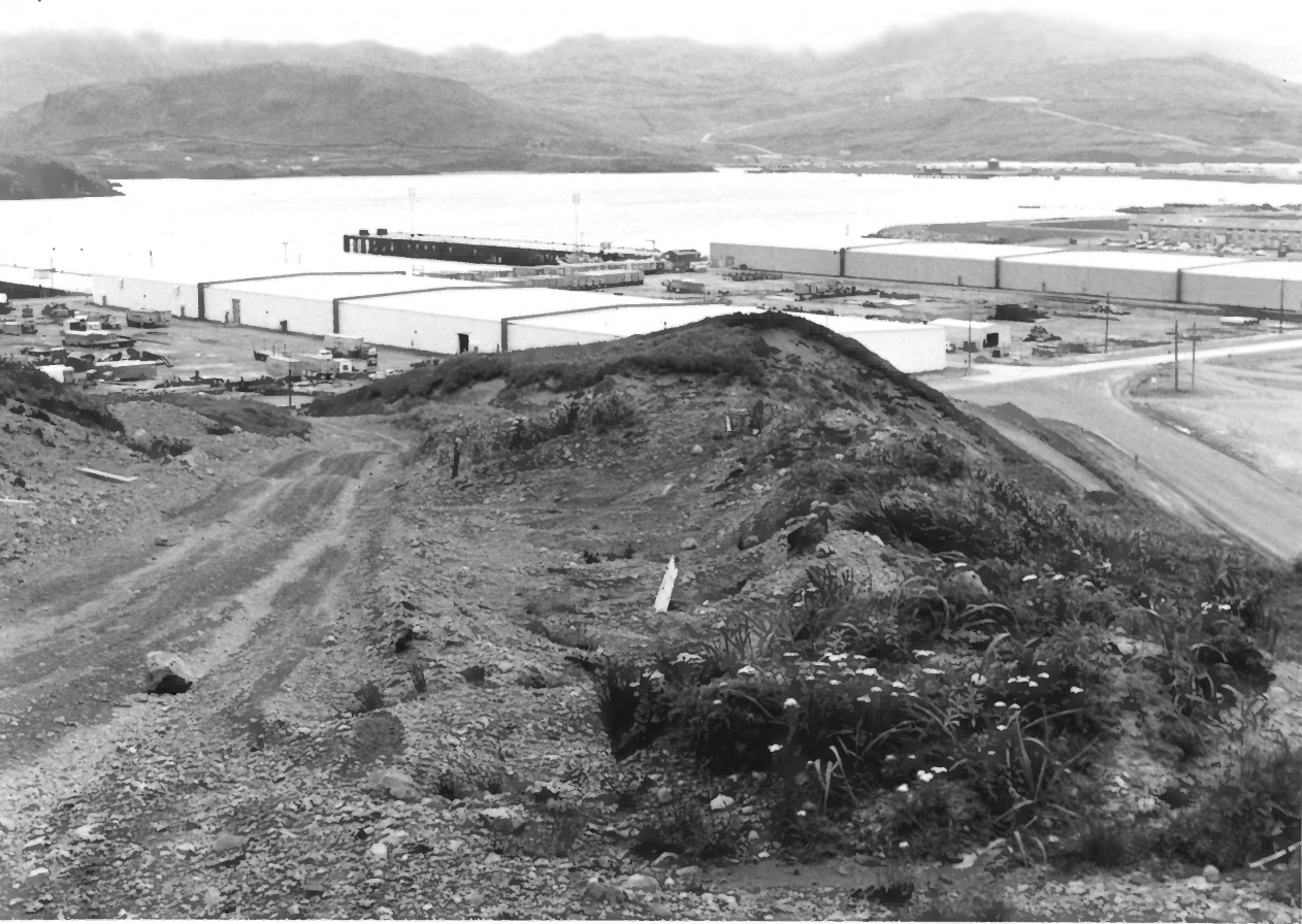
3. Two of three immense army reserve depot warehouses at Sweeper Cove, Adak, built in 1943-44 for a possible invasion of Japan's Home Islands from the north.