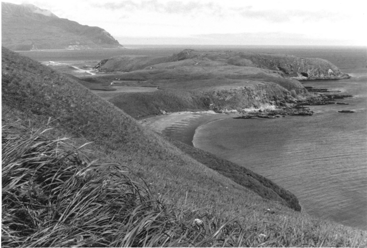
6. Zeto Point, Adak. Ruins of World War II joint harbor entrance control post, gun emplacements, and quonset huts may still be found on this cape, north of Kuluk Bay. This area is severely restricted today because of classified installations.