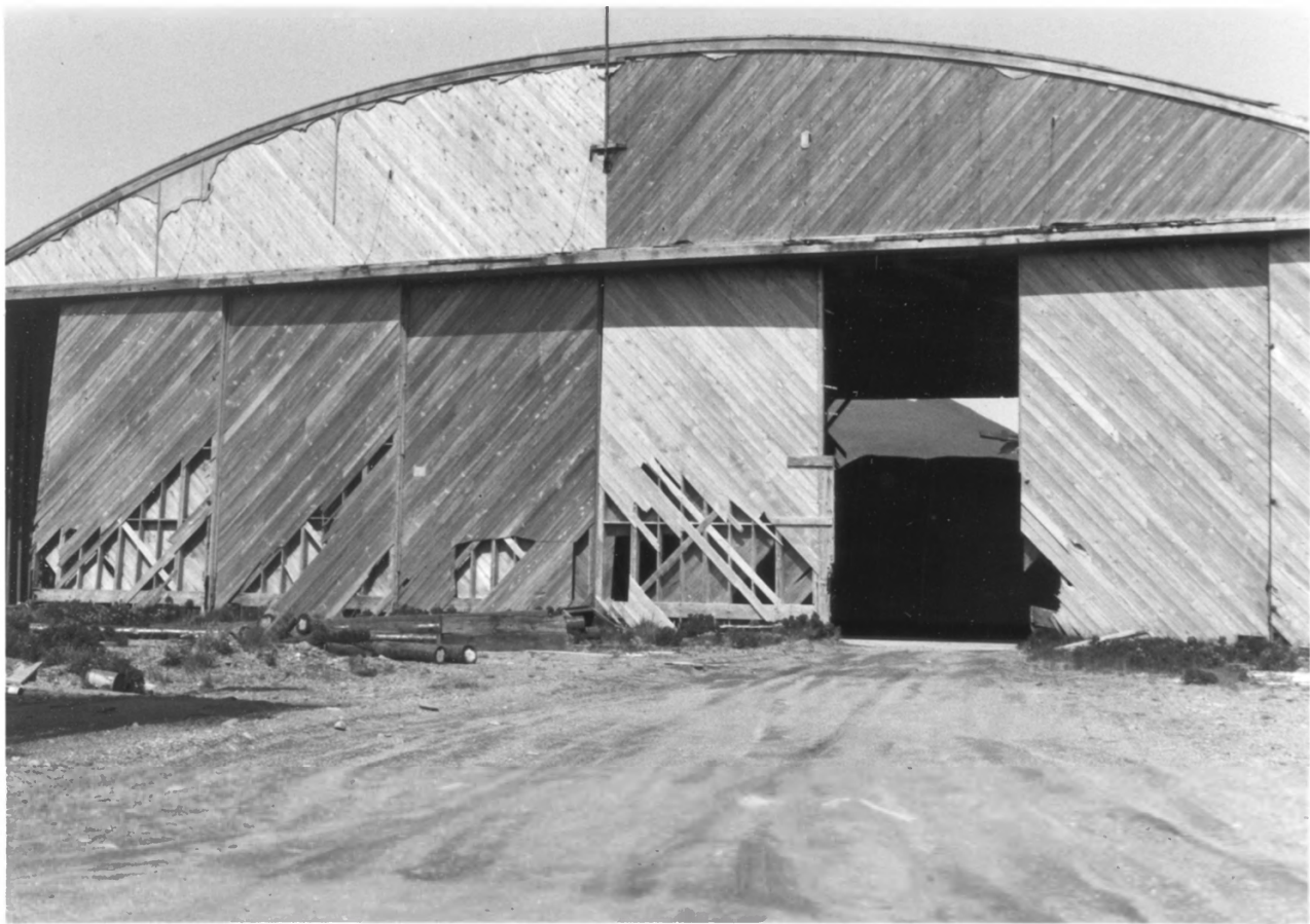
8. Deteriorated aircraft hangar at the World War II naval air station on Adak--one of only two structures still standing at the former station. This general area today is the site of several classified installations.