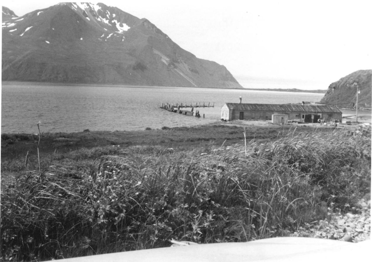
9. Andrew Lake was a part of the World War II naval air station on Adak. It was used by naval flying boats and seaplanes. The boat house dates from the war and is still used by the Navy for recreational boating purposes.