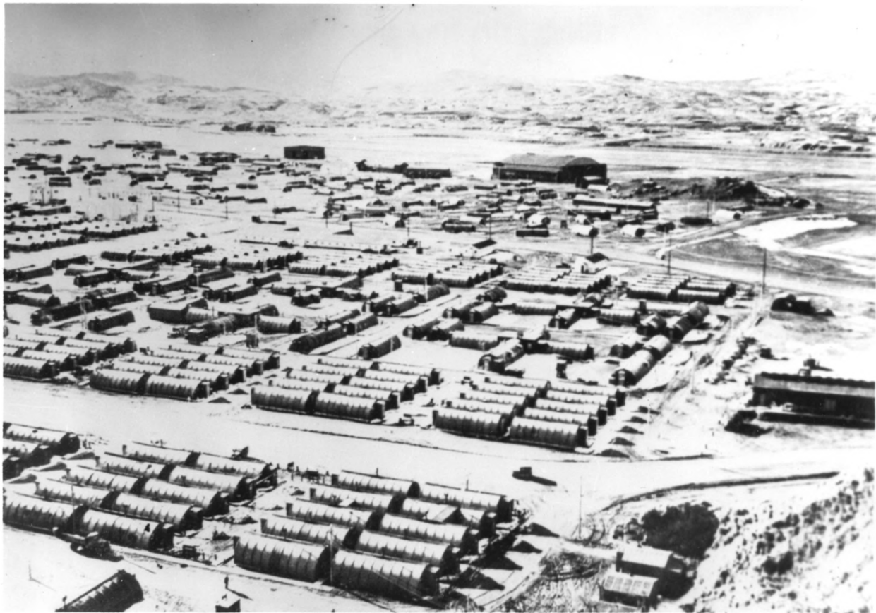
2. A portion of the vast encampment established on Adak for the bombing and invasion of the Japanese-held islands of Kiska and Attu in the Aleutians. The army airfield lies beyond the hangar. 1943.