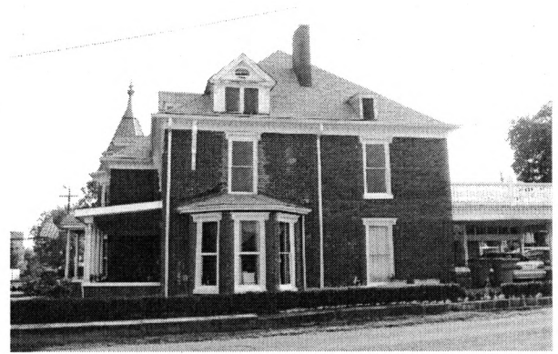
North Elevation, View to the South

dentil molding and brackets found elsewhere on the building. The first floor of the addition is open and used for parking. The second-story deck is surrounded by a new wooden balustrade with heavy wooden balusters.