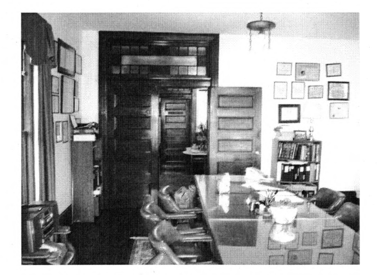
Study Doors and Transom with Parlor Entrance Beyond, View to the South