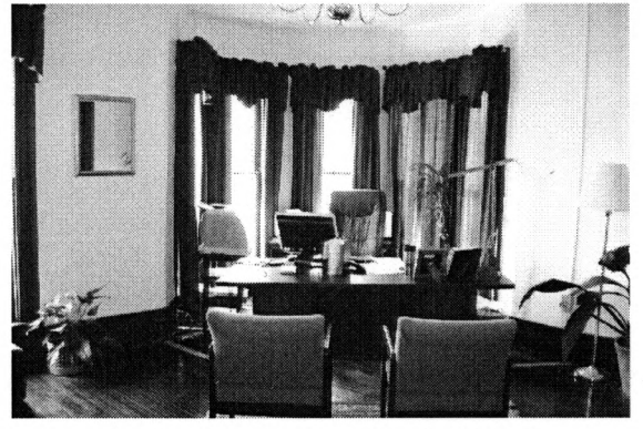
Southeastern Bedroom, View to the Southeast

The southeastern bedroom has narrow wooden floor boards laid parallel to one another, approximately 12inch baseboards, ca. 1915 metal wall vents with wooden molding, plastered walls and ceiling, and a 2003 metal chandelier. The western wall includes a central fireplace with plastered facing, a decorative metal encasement with a floral motif, and a wooden mantel with low-relief pilasters and upper elements. South of the fireplace is a wooden paneled closet door. In the southeastern corner is the five-part tower; in each of its parts is a one-over-one window. In the eastern wall is a one-over-one window. A wooden paneled door leads through the northern wall into the central hall.