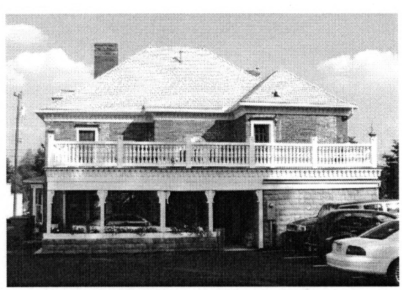
West Elevation, View to the East