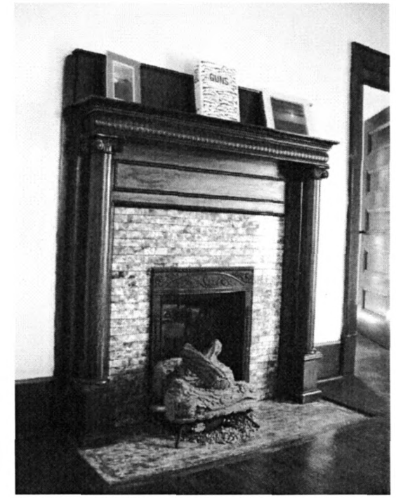
Northeastern Bedroom Fireplace, View to the Northwest

central fireplace with brown, beige, and green glazed tile facing, a decorative metal grate frame, and a wooden mantel with Corinthian colonettes on posts and oval carving on the edge of the upper ledge.