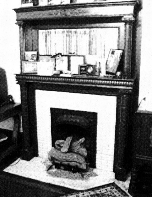
Parlor Fireplace, View to the West

The parlor is in the southeastern corner of the first floor. The room has narrow wooden floor boards, approximately 12-inch wooden baseboards, ca. 1915 metal wall vents with wooden molding, plastered walls and ceiling, and a ca. 1900 hanging light fixture. In its western wall is a fireplace with beige glazed tile facing, a decorative metal grate frame with a flared upper portion, and a wooden mantel and overmantel similar to that found in the living room. In the parlor's southeastern corner is the five-sided tower; within each side is one one-over-one window. Another one-over-one window is in the eastern wall. The pair of paneled wooden doors with a colored glass transom is in the northern wall and leads to the central hall.