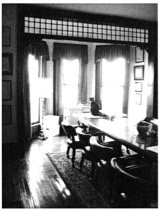
Study, View to the North

Through the northernmost of these entrances is the study. It has plastered walls and ceiling, a ca. 1900 metal hanging light fixture, approximately 12-inch wooden baseboards, ca. 1915 metal wall grates with wooden molding, and narrow wooden floor boards laid in perpendicular inner and outer orientations. In the eastern wall is a one-over-one window, and in the northern wall is a projecting three-sided bay; each side has a one-over-one window. Dividing the bay from the room is a cased opening with a turned-and-sawed wooden grille composed of perpendicularly placed cylindrical-shaped wooden pieces with round wooden pieces at their joints; below are brackets with serrated edges and circular holes in their solid portion. A paneled wooden door with a deep-set doorway in the western wall connects this room to the living room. Above the door is an ornamental grille with wooden trim similar to that used with the window bay. South of the door is a fireplace with green, orange, and beige glazed tile facing, a decorative metal grate frame, and an elaborate wooden mantel. The lower part of the mantel includes, alongside the fireplace, Ionic colonettes with swirl and floral motifs on their capitals and, above them, a shelf with repeated oval carvings along the edge. Similar elements are on the overmantel, where a mirror is the focal point.