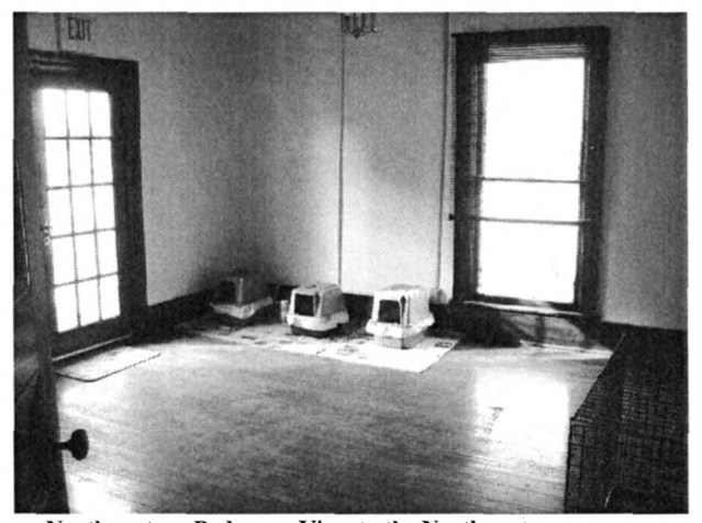
Northwestern Bedroom, View to the Northwest

The northwestern bedroom has a plastered ceiling and walls, a 2003 chandelier, approximately 12-inch baseboards, ca. 1915 metal wall vents with molding, and narrow wooden floor boards laid parallel to one another. Its eastern wall includes a central fireplace with beige glazed tile facing; a decorative metal grate frame with a flared upper portion; and a wooden mantel with columns, curved carving below the ledge, and a curved central upper portion. On each side of the fireplace are wooden paneled doors; the northern one leads to the northeastern bedroom and the southern one leads to a closet. In the northern wall is a one-over-one window. In the western wall is a wooden paneled door leading to the deck. Another paneled wooden door in the southern wall leads to the central hall.