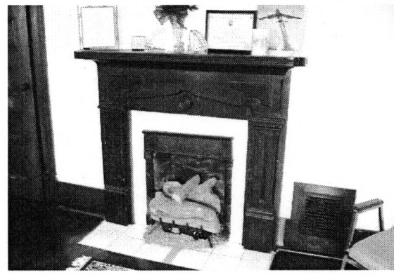
Southeastern Bedroom Fireplace and Vent, View to the Southwest

When the house was constructed ca. 1875, it was as part of a new urban subdivision replacing a former corn field with houses, offices, shops, churches, and government buildings. Many of the properties now proximate to the Gammon House were constructed after 1950. Historic houses remain scattered among the parks and