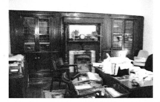
Dining Room Cabinets and Fireplace, View to the East

The dining room is east of the pantry. It has narrow wooden floor boards laid to form a central square and plastered walls and ceiling. A paneled wooden door is in the western wall; it connects the dining room to the kitchenette. In the southern wall is a pair of one-overone windows. The eastern wall is covered by a symmetrical cabinet unit with a central fireplace. The fireplace has brick facing, a decorative metal grate frame with a flared upper portion, and a wooden mantel and overmantel with continuous columns on posts with swirled carving and a mirror. On each side of the mantel is an