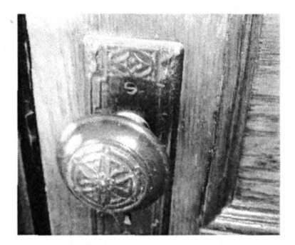
The embellishment on this northwestern bedroom knob is typical of hardware throughout the house.

The northwestern bedroom has a plastered ceiling and walls, a 2003 chandelier, approximately 12-inch baseboards, ca. 1915 metal wall vents with molding, and narrow wooden floor boards laid parallel to one another. Its eastern wall includes a central fireplace with beige glazed tile facing; a decorative metal grate frame with a flared upper portion; and a wooden mantel with columns, curved carving below the ledge, and a curved central upper portion. On each side of the fireplace are wooden paneled doors; the northern one leads to the northeastern bedroom and the southern one leads to a closet. In the northern wall is a one-over-one window. In the western wall is a wooden paneled door leading to the deck. Another paneled wooden door in the southern wall leads to the central hall.