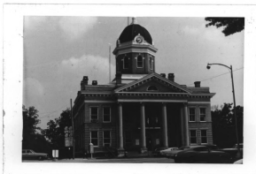
JASPER COUNTY COURTHOUSE