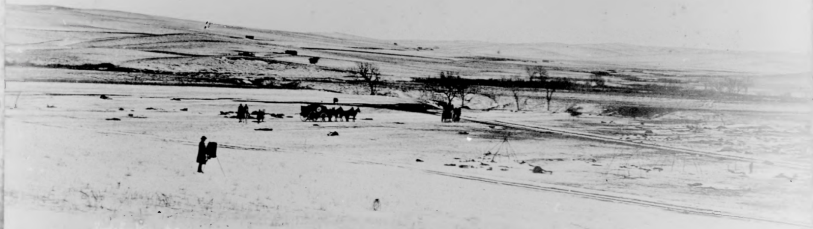
View of Wounded Knee battle-field 2 days after the fight. P.R. Agency. S.D.