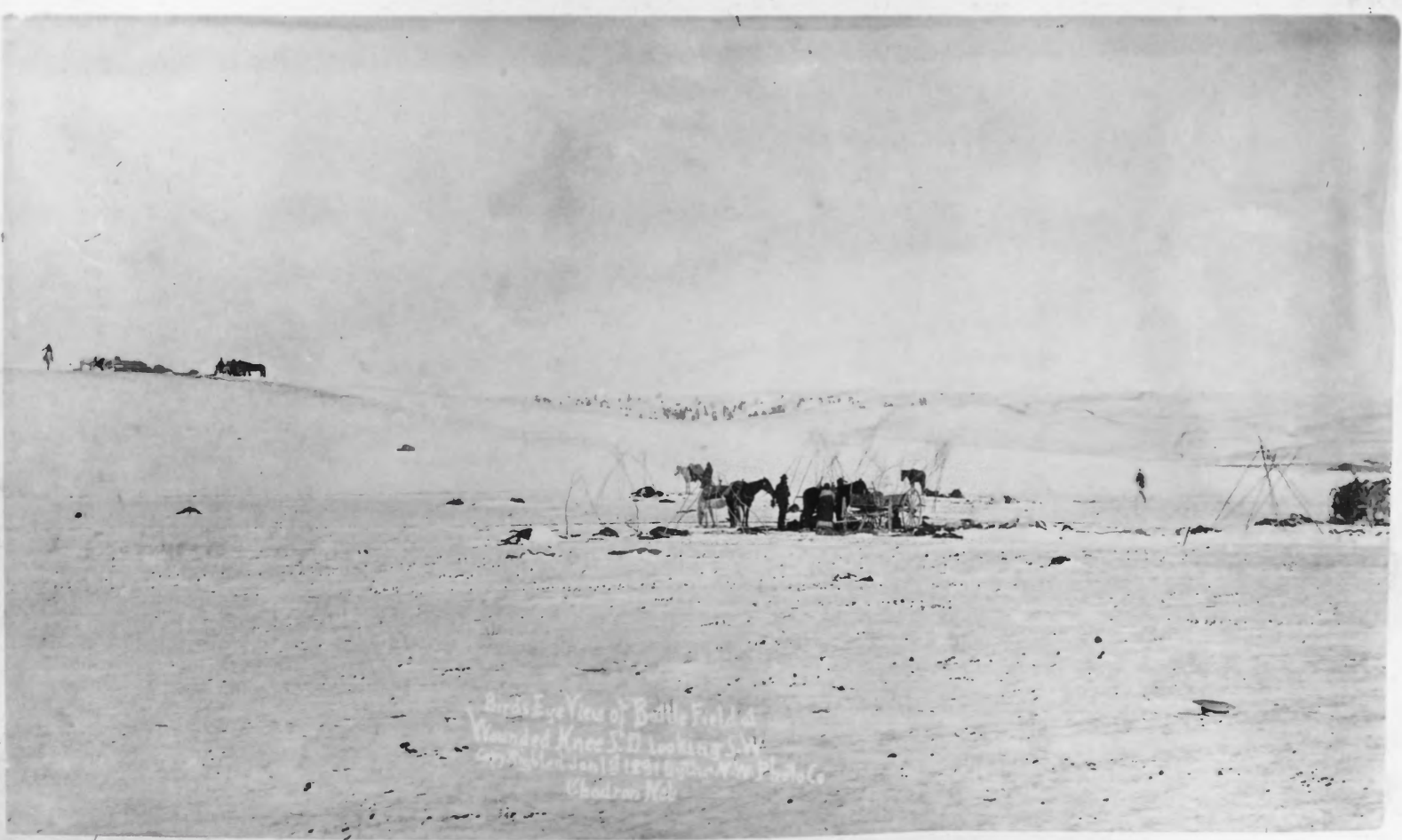
Birds Eye View of Battle Field at Wounded Knee S.D. looking S.W.