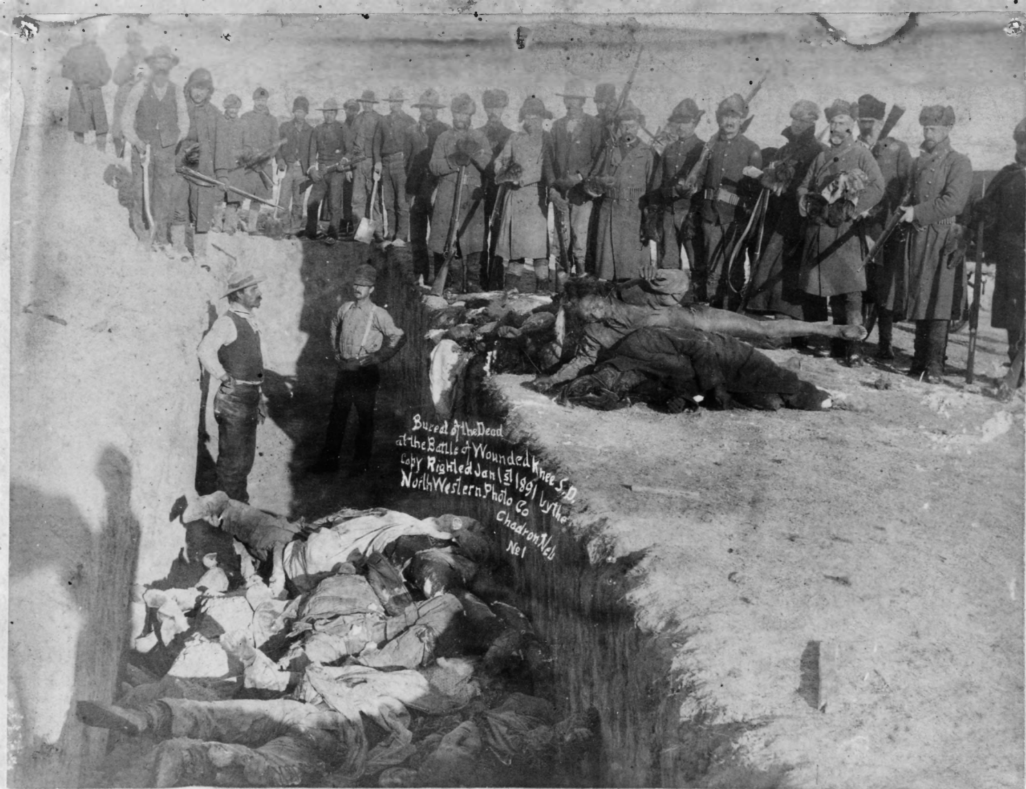
Burial of the Dead at the Battle of Wounded Knee S.D. copy Righted Jan 31 1891 by the North Western Photo Co Chadron Neb No 1