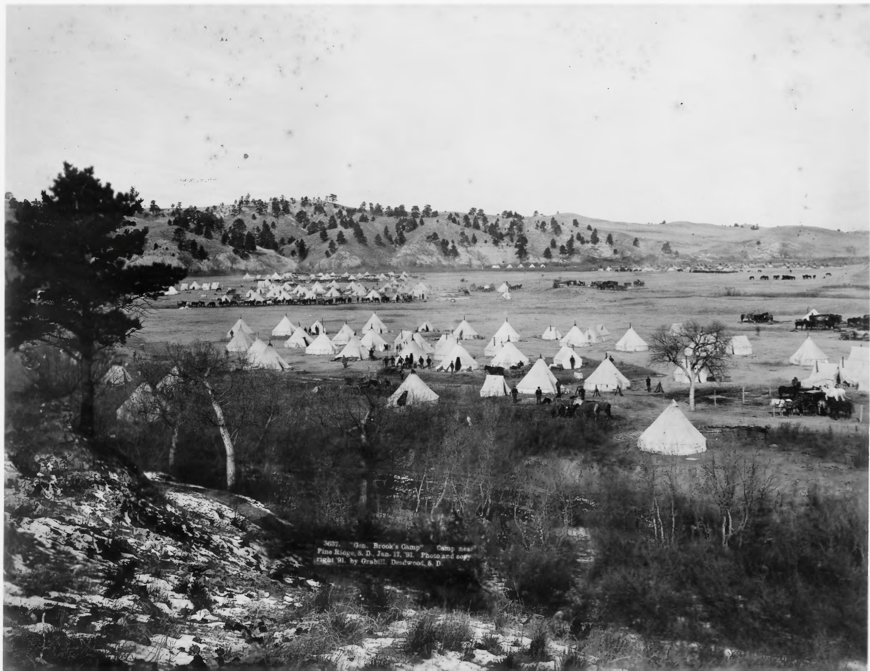
3637. "Gen. Brook's Camp" Camp near Pine Ridge, S. D., Jan. 17, '91.