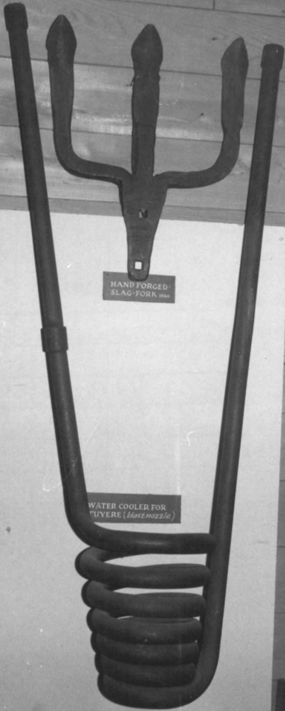
HAND FORGED SLAG-FORK 1860