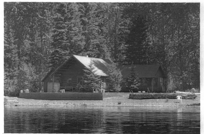
Alice Beck Cabin: Flatheado. Montana: Jessie Ravage; July 2005; neg: Glacier National Park Archives; 5 W elevation of cabin from 'water; ' Photo No.1

Flathead County, Montana View of Alice Beck Cabin from Lake McDonald showing southwest elevation, or front Photograph No.1