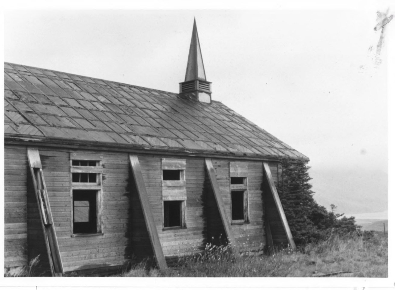
15. A post-battle army chapel on the Hogback, overlooking Massacre Bay, Attu. Soldiers planted the trees--the only ones on Attu.