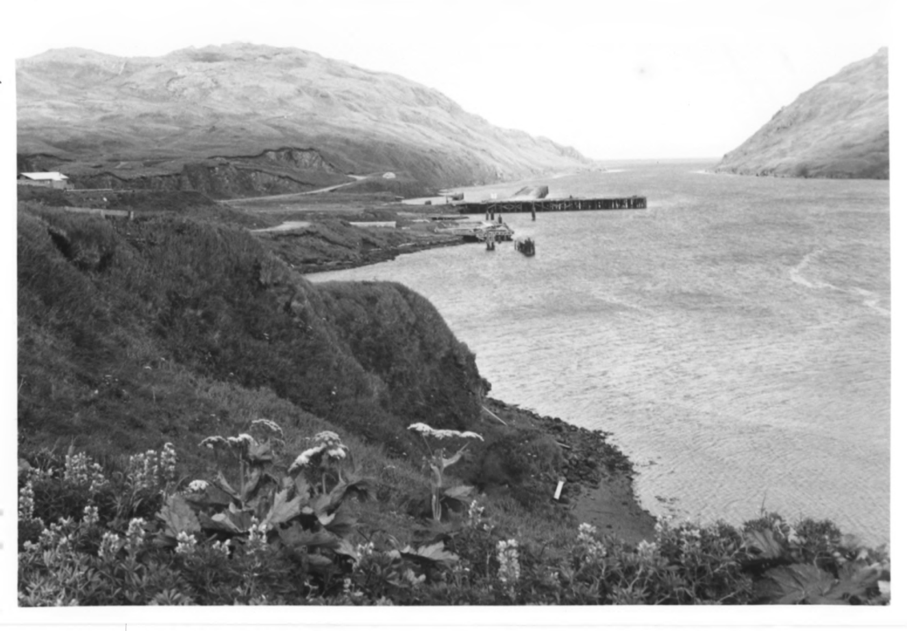
4. Finger Bay, Adak. Here the U.S. Navy established ship repair facilities, motor torpedo-boat base, and other naval operations for the Aleutian Campaign.