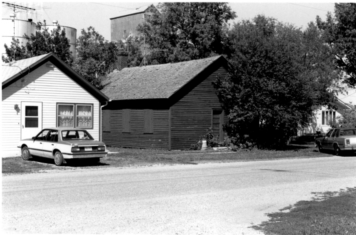
Brown Hall, Brown County, So. Dak., No. 1