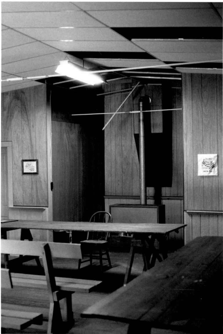
Brown Hall, Brown County, So. Dak., No. 4