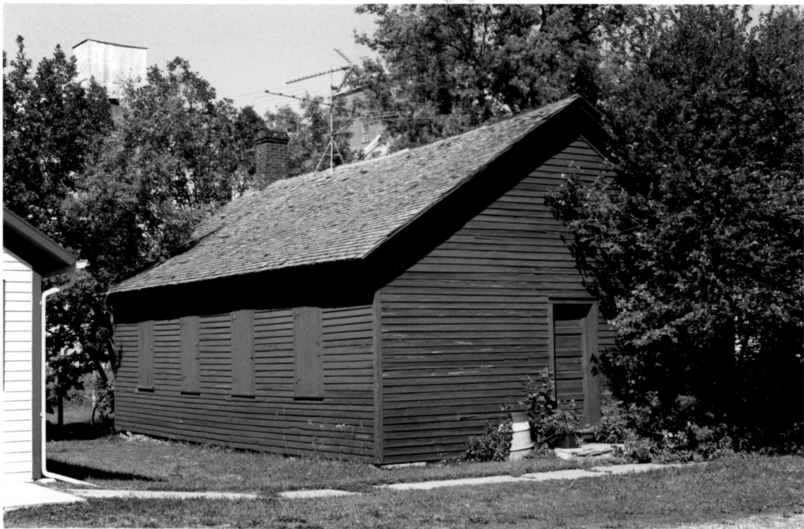
Brown Hall, Brown County, So. Dak., No. 2