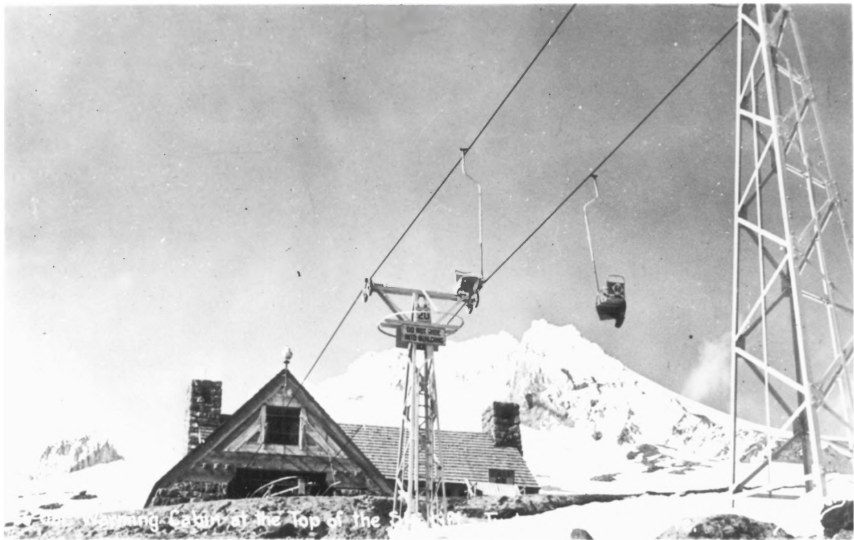
Warming Cabin at the Top of the Ski Lift