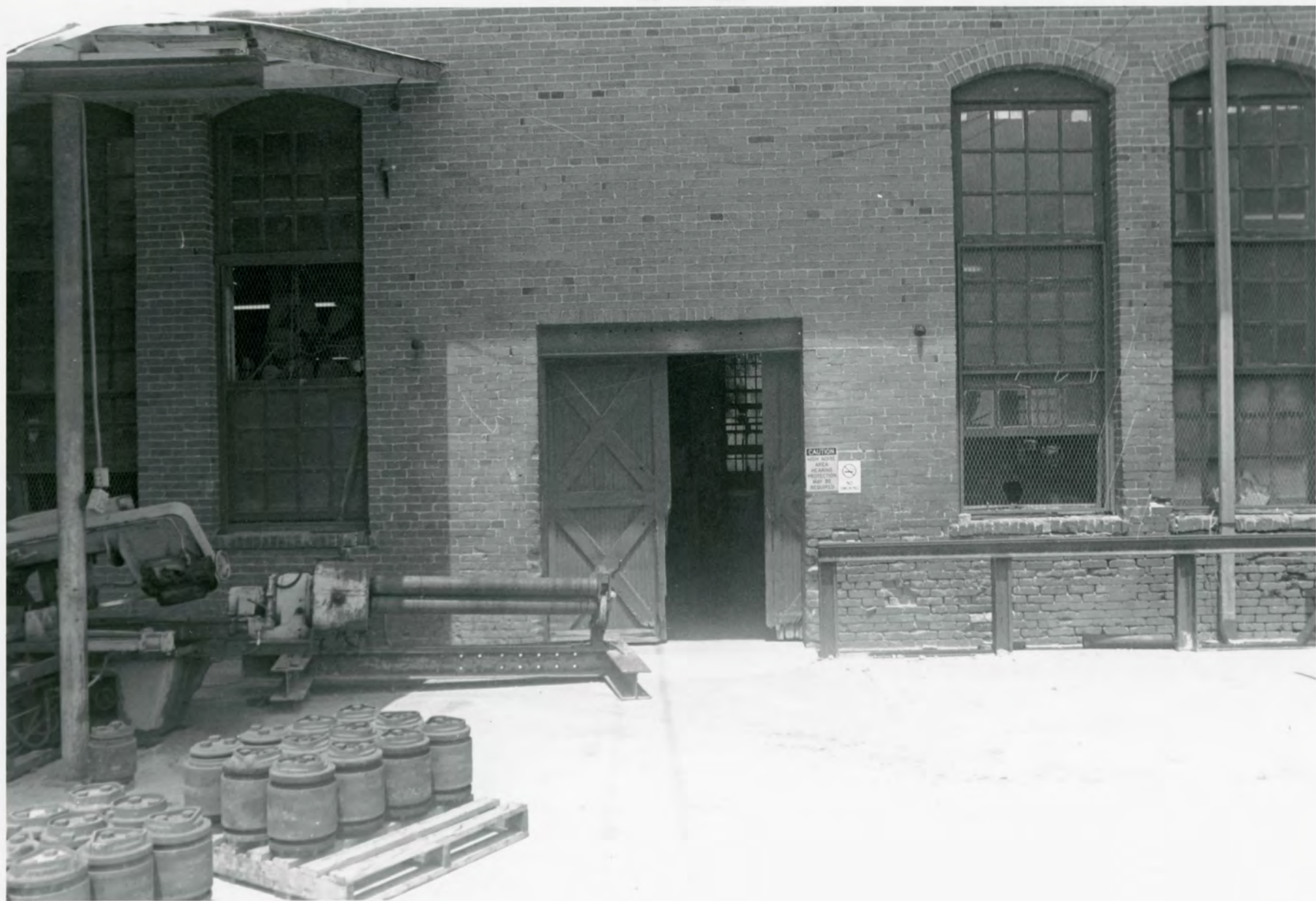
EXHIBIT NO SMOKING ALL FIREARMS MAY BE RECOVERED