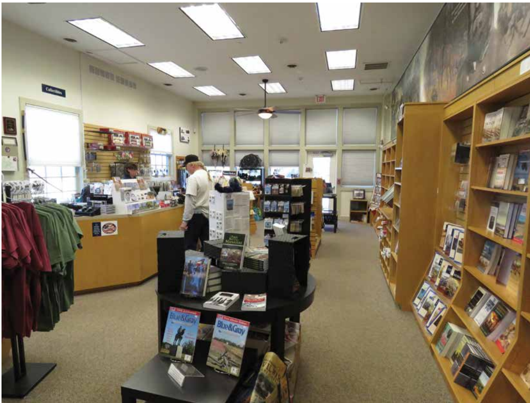
The park's Eastern National store is well-stocked with publications and gift items related to Manassas and the Civil War.

Three other programs currently focus on environmental education. Workshop participants acknowledged the role that natural resources and environmental conditions always play in military confrontations and encouraged those conducting environmental