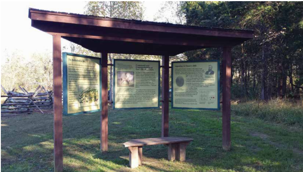
The existing interpretive kiosk on Stuart's Hill offers visitors a glimpse of the hill's role as Confederate command headquarters and signal station during Second Manassas.

battles, and descriptions of the First Manassas walking tour on Henry Hill and the numbered stops on the Second Manassas driving tour. The brochure also lists regulations and provides contact information for the Visitor Center and park website.