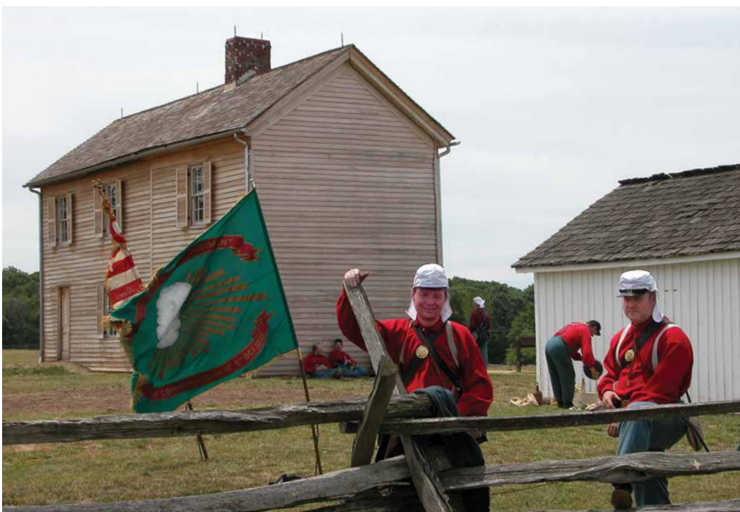
Living history programs on the grounds of the Henry House are among the special programs scheduled throughout the year.

Part of this new exhibit plan will consider removing the tavern bar and associated artifacts. The “tavern” room, however, will