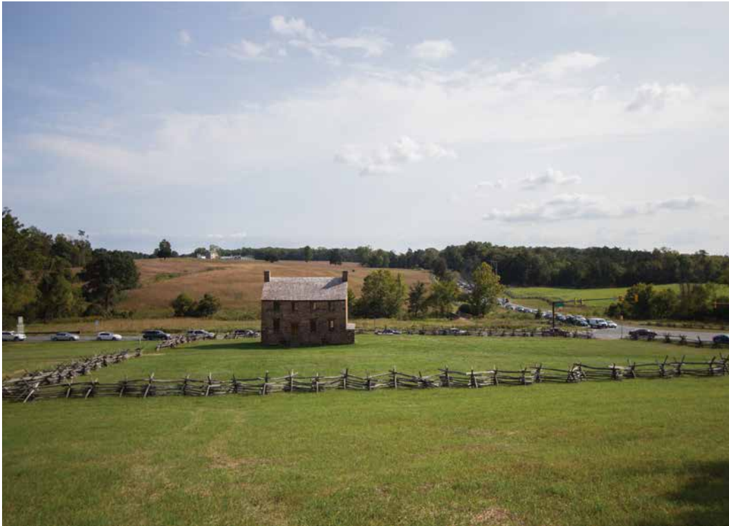
The congested intersection at the Stone House poses challenges for park visitors touring the battlefield.