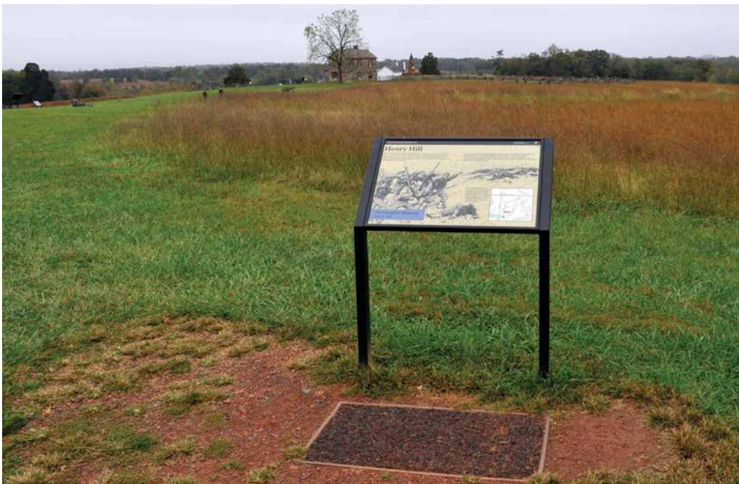
The one-mile loop trail on Henry Hill is the primary means for visitors to tour the First Manassas battlefield. While much of the battlefield is visible from the trail, the hill itself witnessed the day's heaviest fighting.