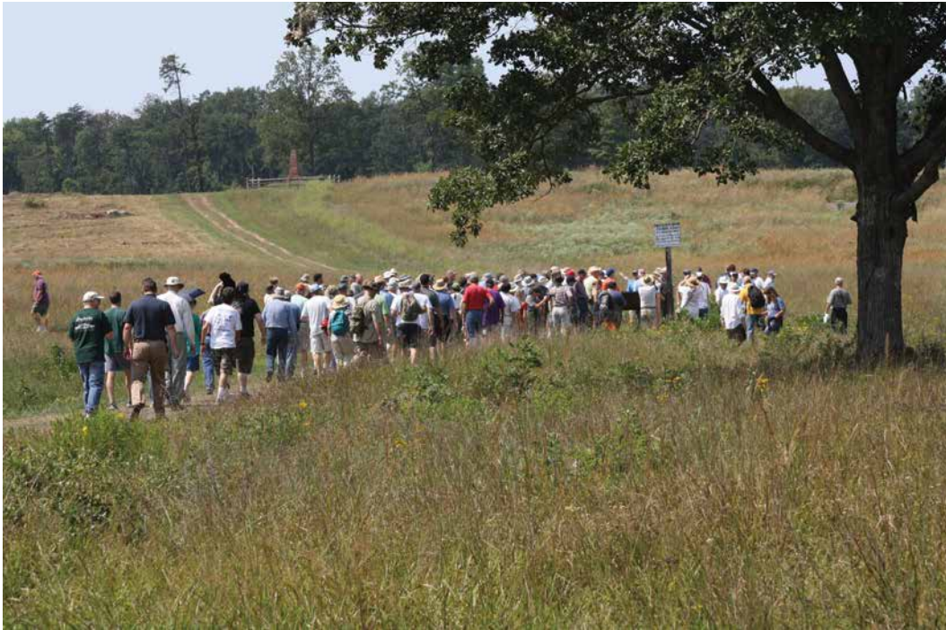
Walking tours are popular program offerings during battle anniversaries. The Deep Cut tour, pictured here, provides visitors with the opportunity to follow in the steps of Union soldiers in the largest Federal attack during Second Manassas.

trails, offering the public the opportunity to take an extended walk with an interpretive ranger, covering five to six miles and lasting several hours. The staff have also offered special evening programs in the summer, many of which have involved longer walks on the battlefield. Known as the “History at Sunset” series, the program series focuses attention on lesser-known or visited sites in the park.