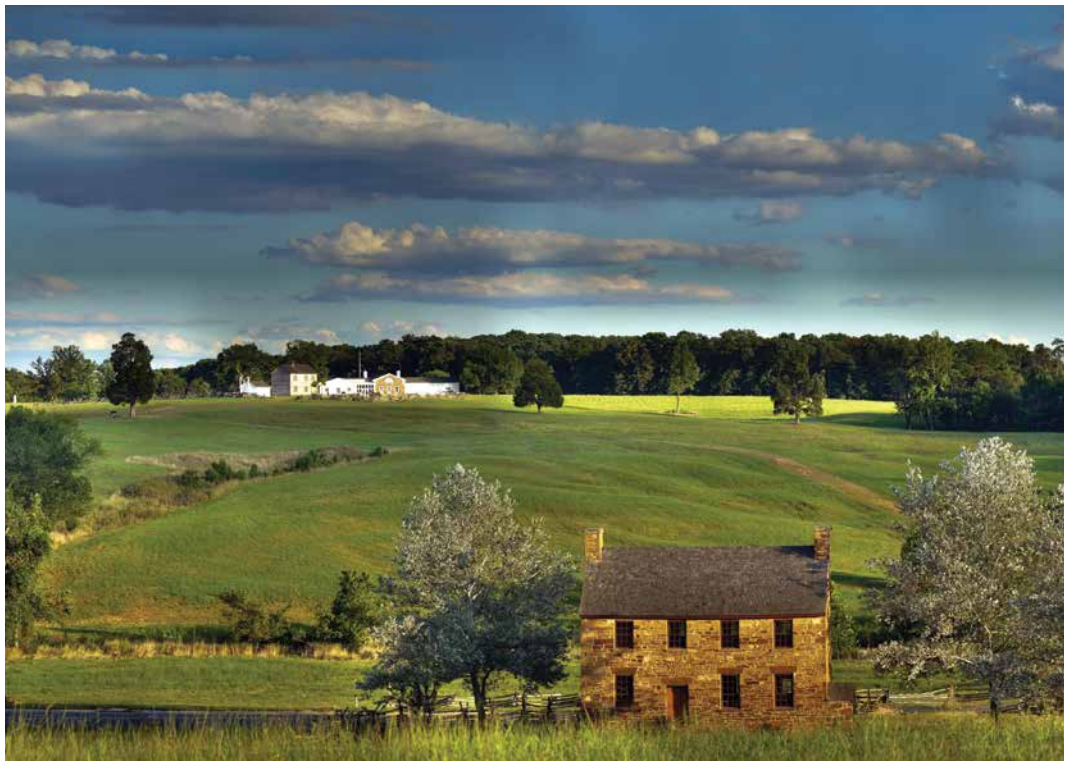
Henry Hill witnessed critical action during both battles of Manassas. This view is from Buck Hill, looking toward the Henry House and the visitor center.