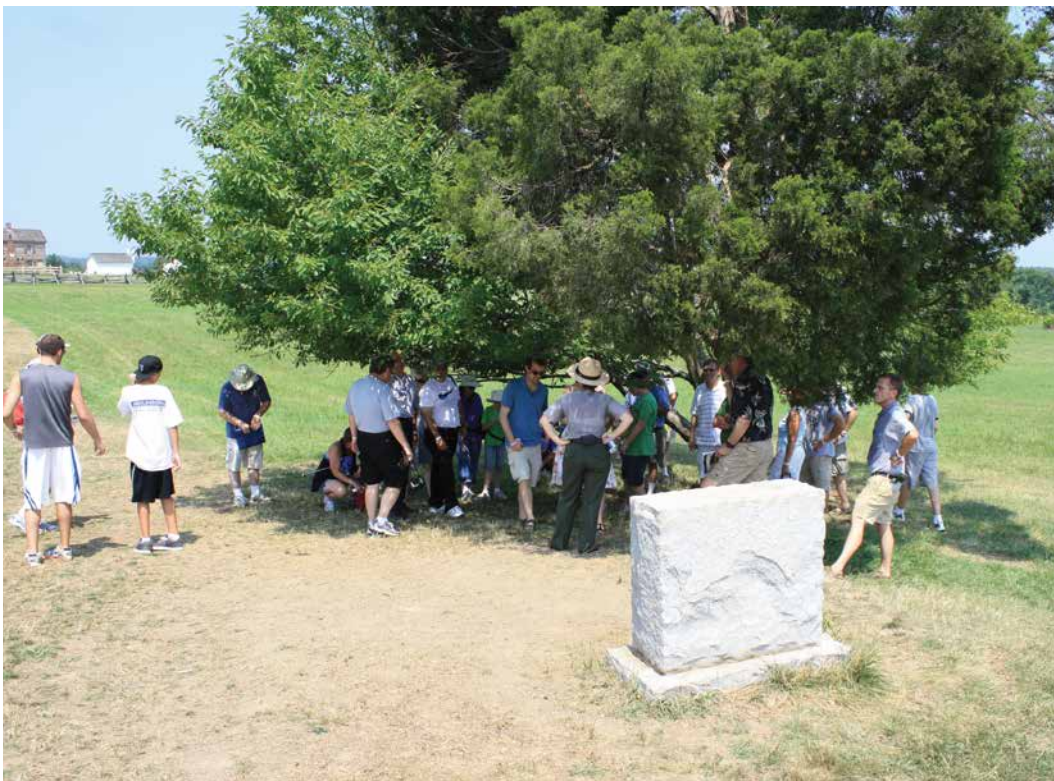
The ranger-led walking tour on Henry Hill is a popular interpretive program from spring through fall.

The park also invited participants interested in engaging youth. Their input will lead to specific recommendations in Part 2 of this plan.