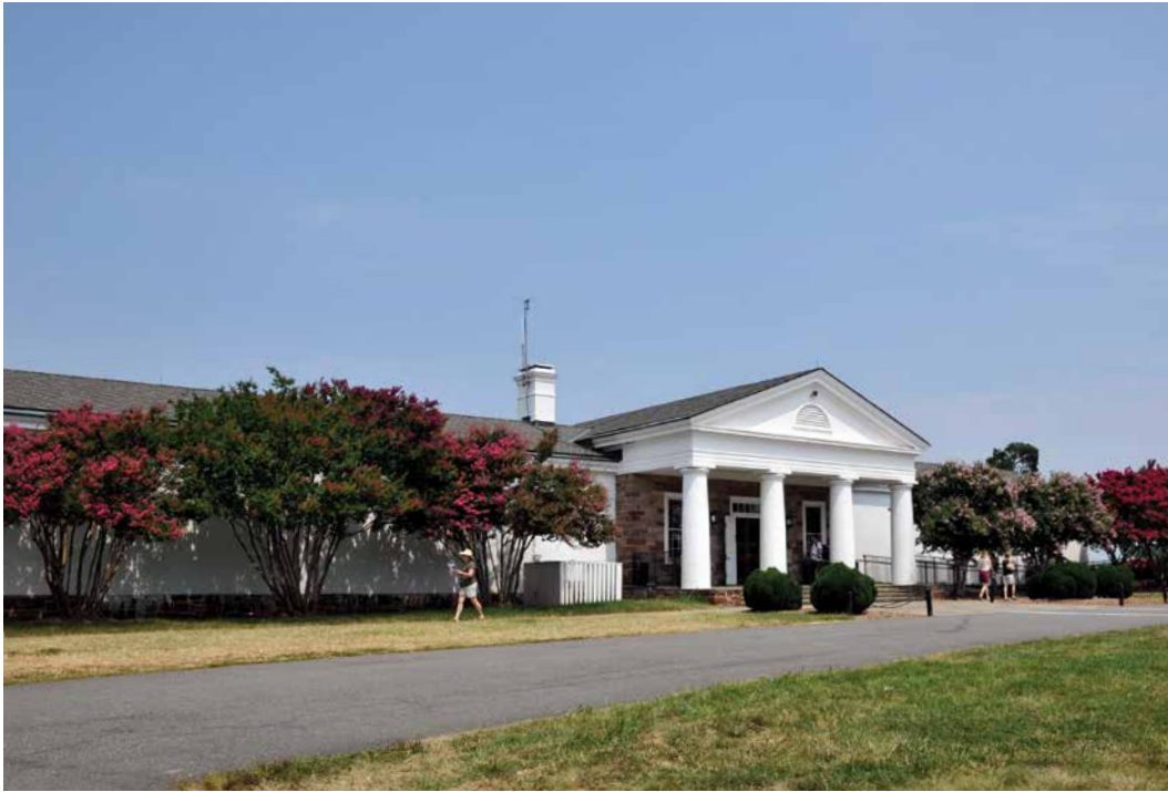
Built in 1942 and enlarged in 1962 and 1999, the Henry Hill Visitor Center is the most heavily-visited site in the park.

orientation and interpretation that happens there will focus on place-based interpretation of the initial moments of Second Manassas. The farm will provide a logical first stop for a visit to the Second Manassas battlefield. Continued staffing will offer another critical opportunity for visitors to interact with knowledgeable personnel who can answer questions and reorient visitors touring the battlefield.