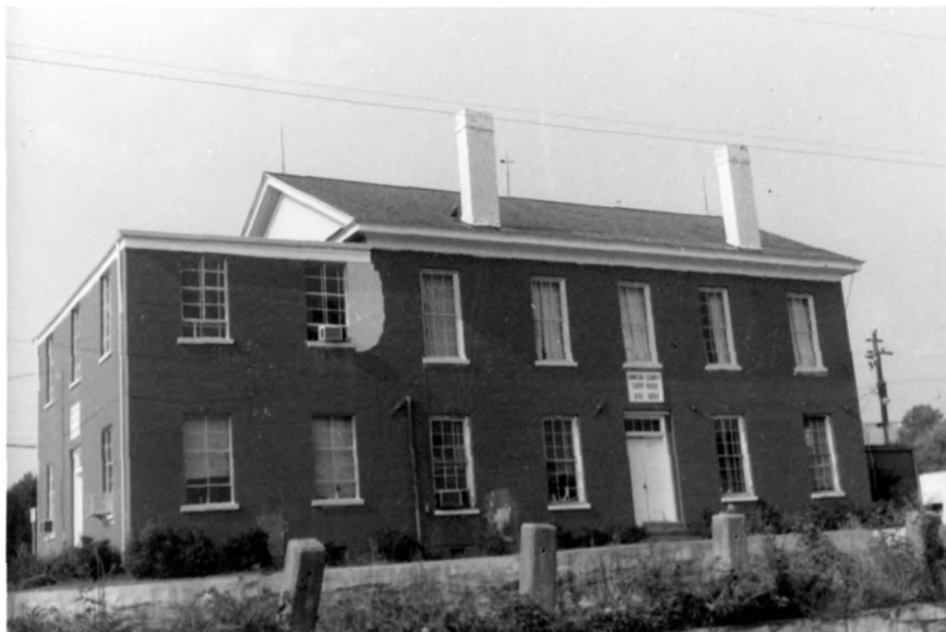
DAWSON COUNTY COURTHOUSE