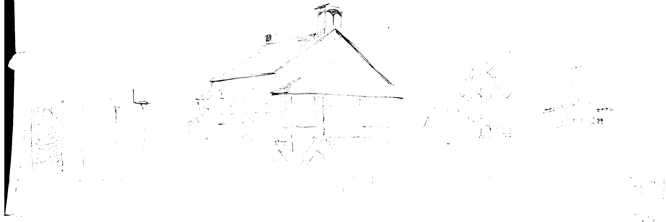
GRISBY BLUFF SCHOOL.