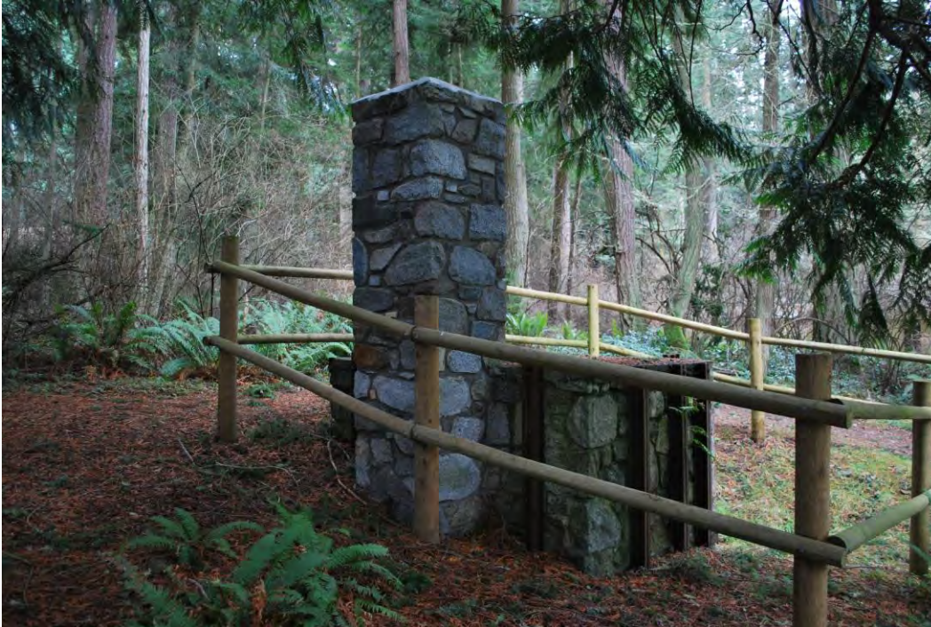
Photo 2 of 4: Cornet Bay Incinerator, view to southeast taken 12/22/2014.