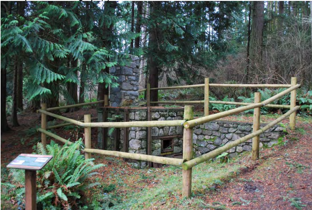
Photo 1 of 4: Cornet Bay Incinerator, view to northeast taken 12/22/2014.