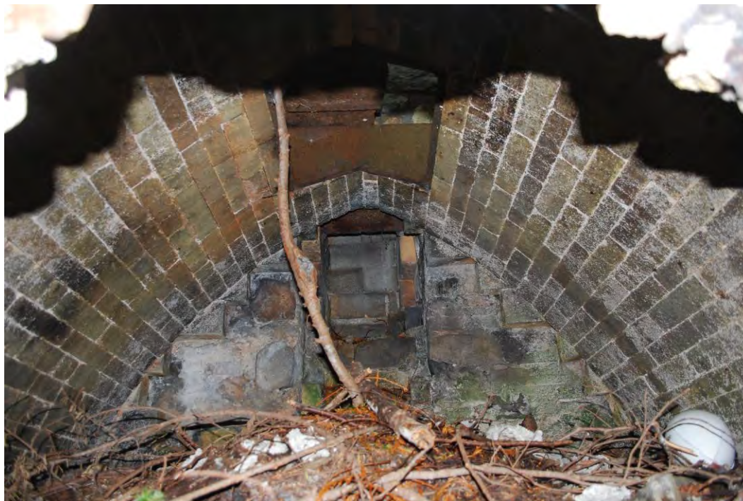
Photo 4 of 4: Cornet Bay Incinerator, view of fire box interior to north taken 12/22/2014.