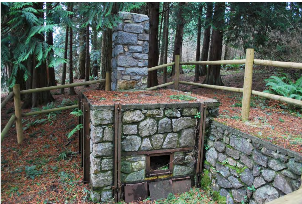
Photo 3 of 4: Cornet Bay Incinerator, detail view to north taken 12/22/2014.