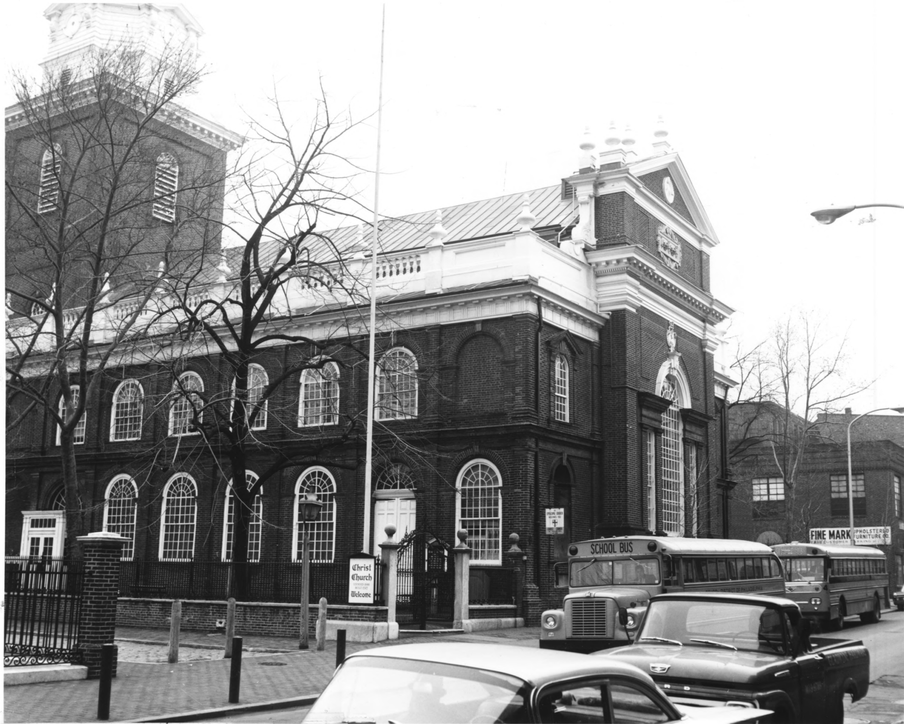
Christ Church, Philadelphia, Pennsylvania 184