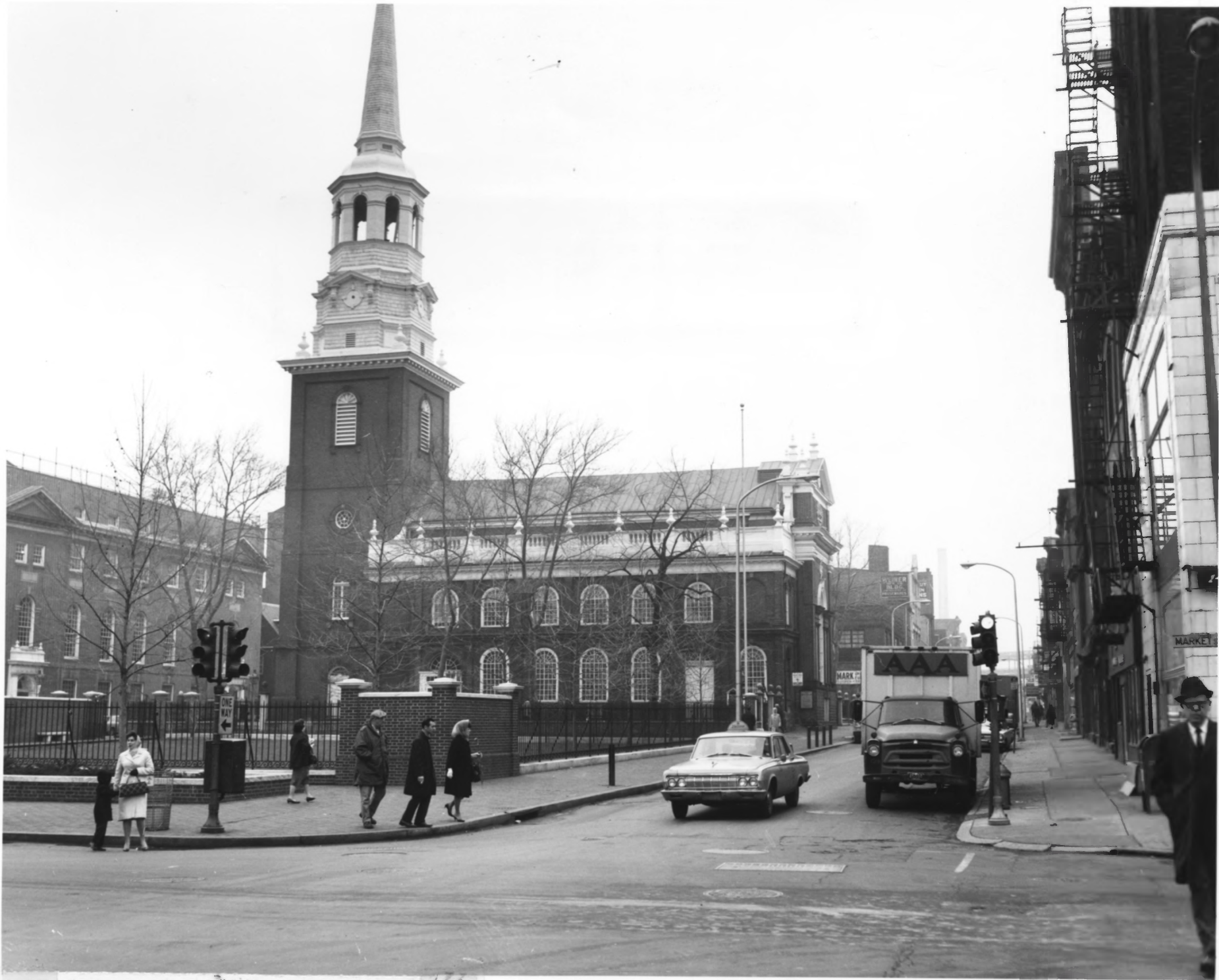
Christ Church, Philadelphia, Pennsylvania