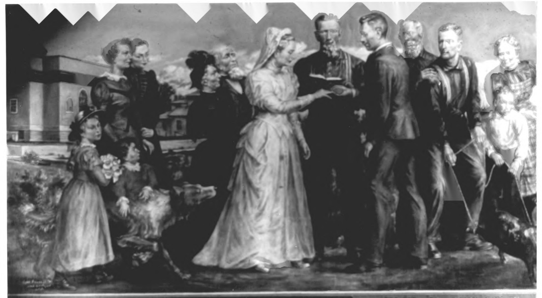
ERASTUS W. McINTIRE FIRST JUSTICE OF THE PEACE.