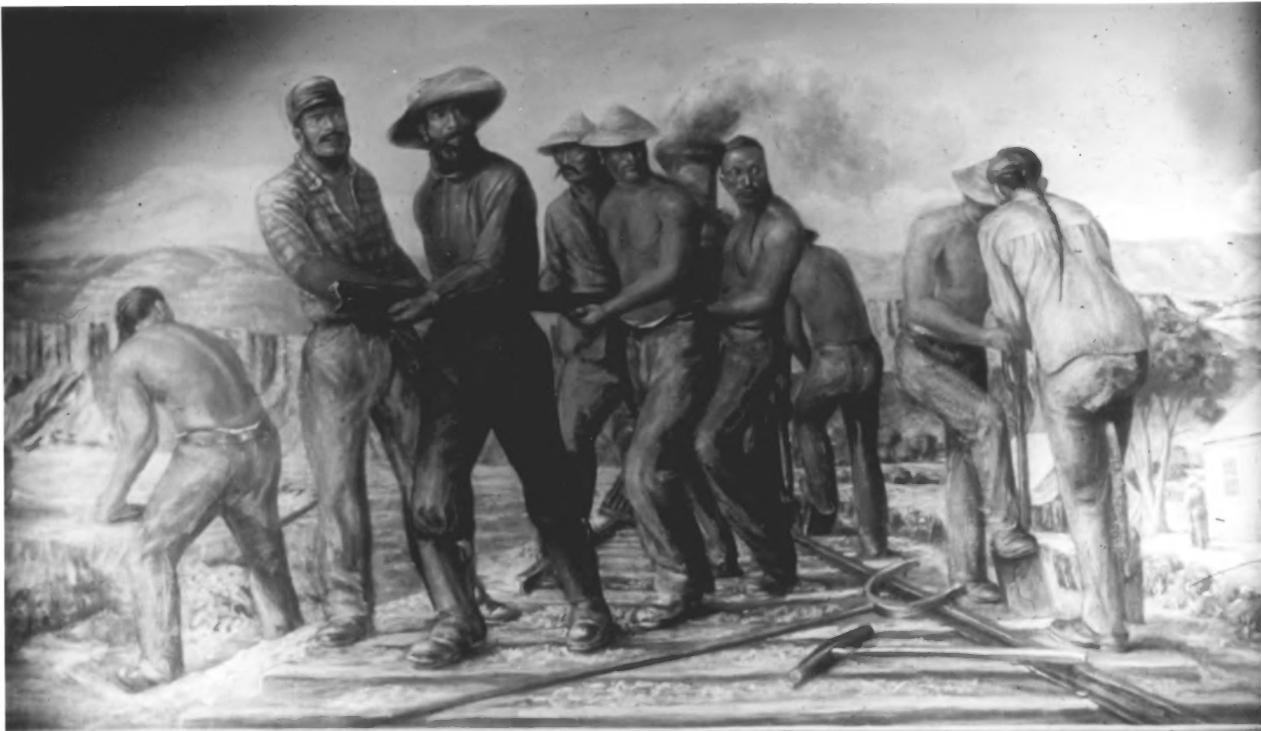
BUILDING DENVER AND RIO GRAND WESTERN RAILROAD 1882 AND 1883