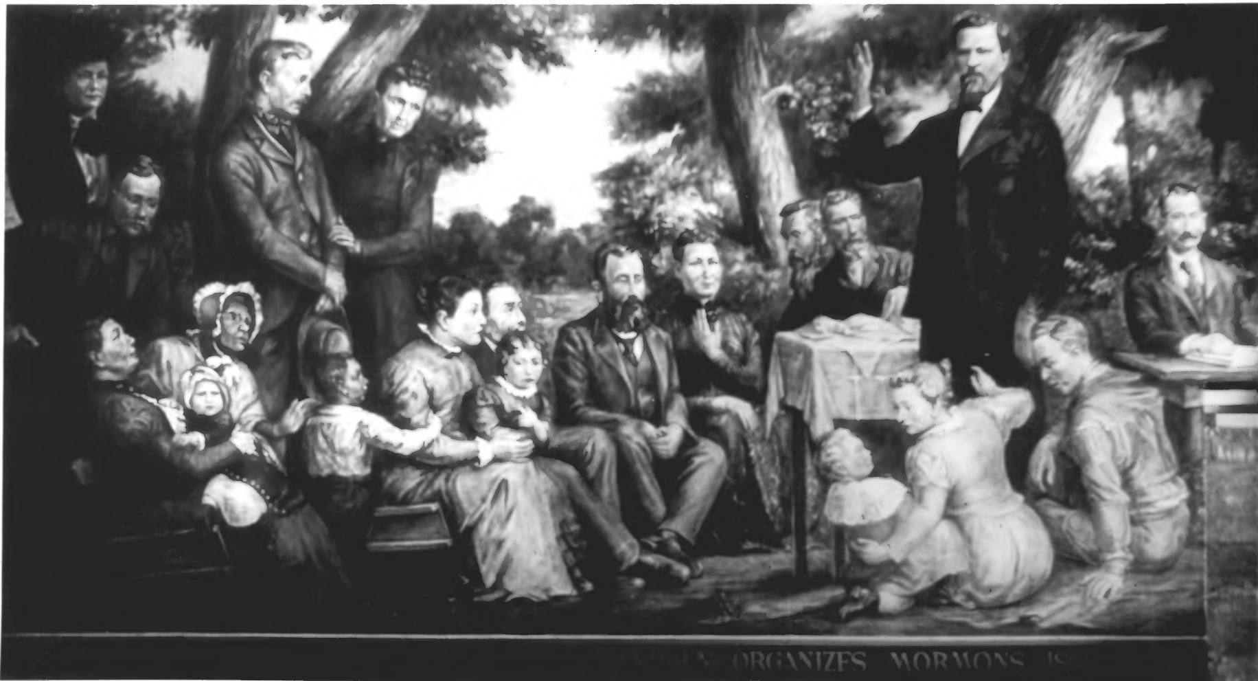
BRIGHAM YOUNG ORGANIZES MORMONS IN