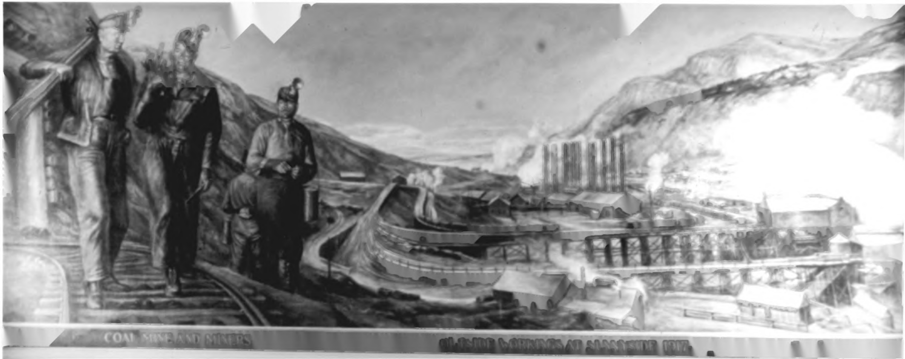
COAL MINERS AND MINERS