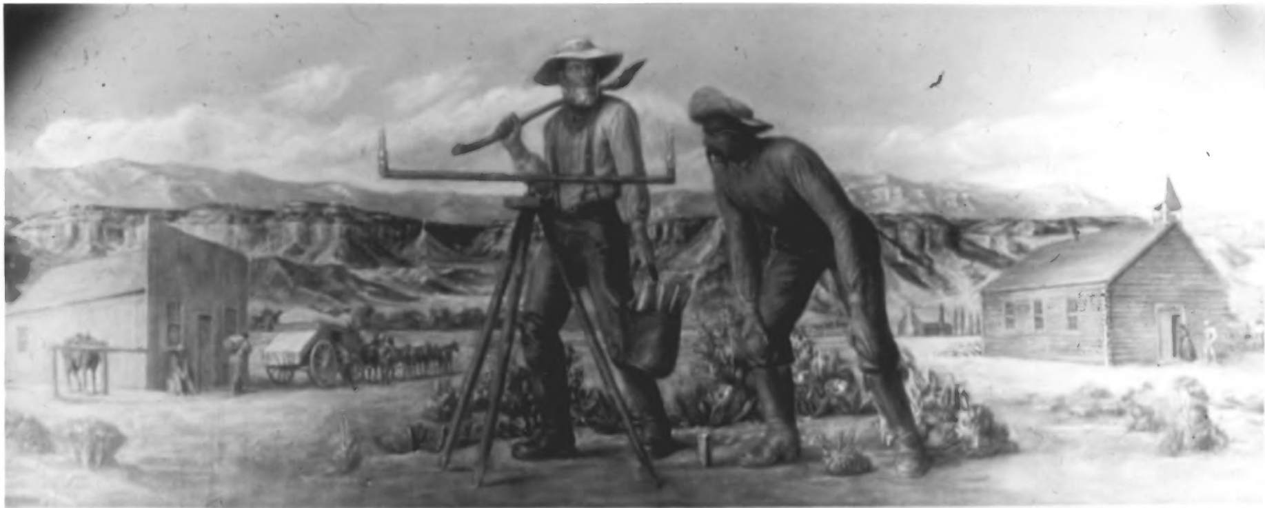
GRAMES' FIRST STORE AND POST OFFICE, 1883