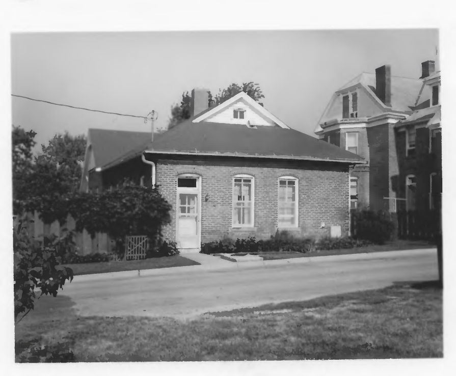
Building 39 624 Thomas Ave. Rear View - Looking Northwest July 1976