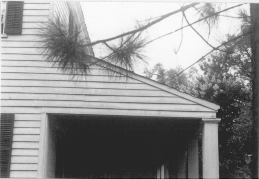
JOHN FOX HOUSE (Old Lutheran Seminary ( Lexington, South Carolina.