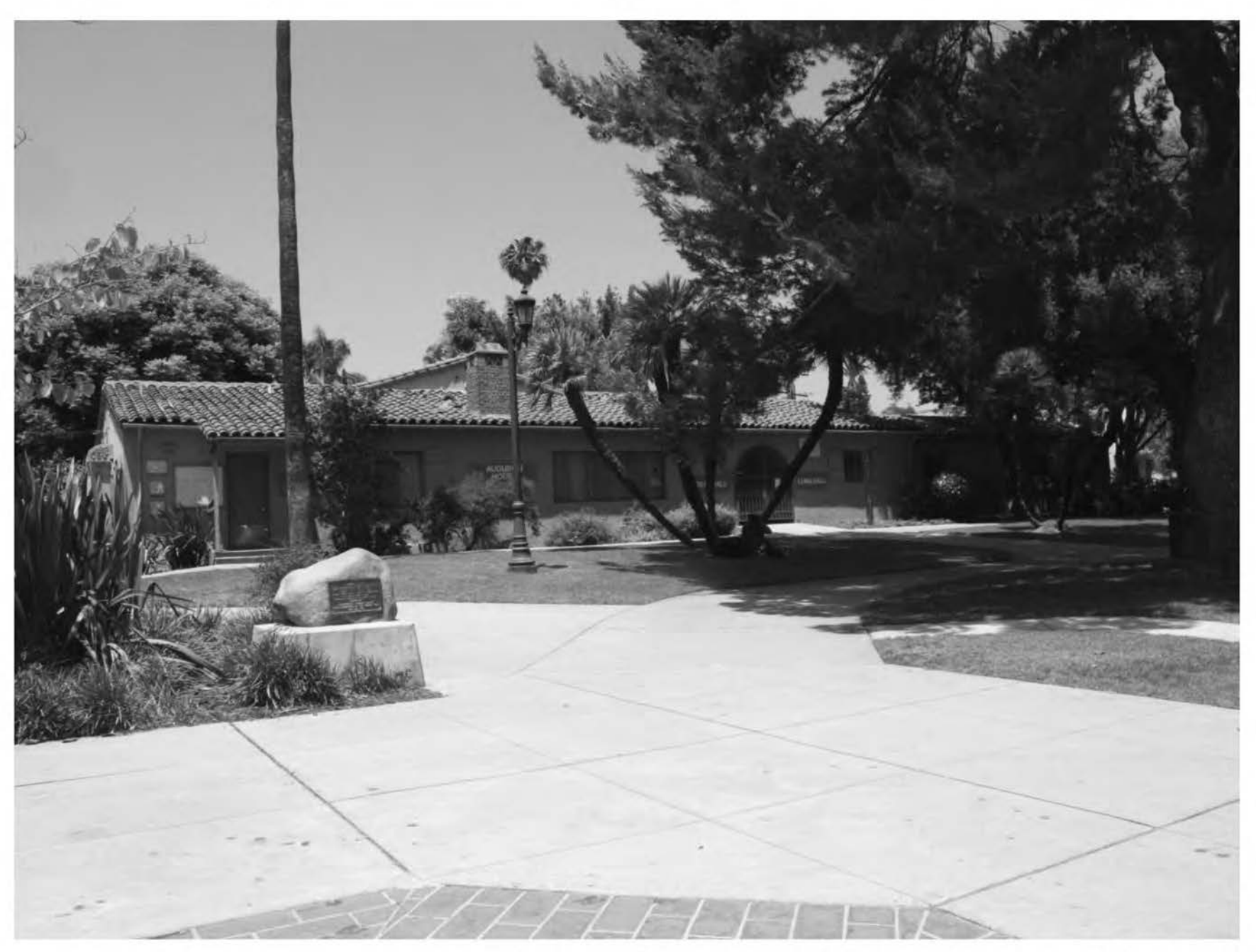
CA_Los Angeles County_Plummer Park Community Clubhouse_001