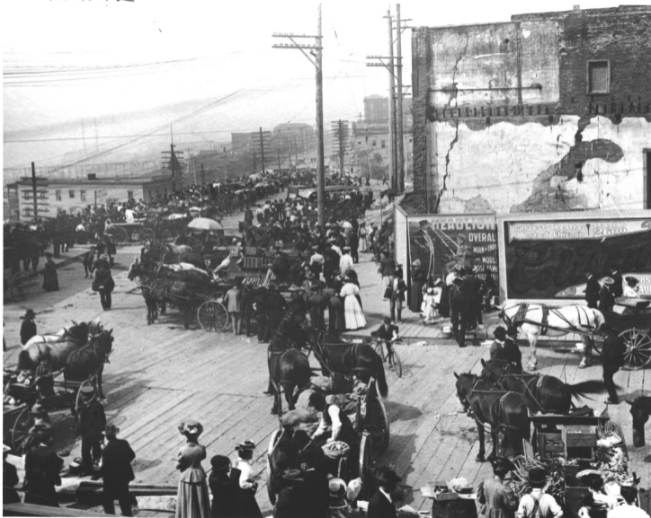
PIKE PLACE PUBLIC MARKET - SEATTLE · C. 1907