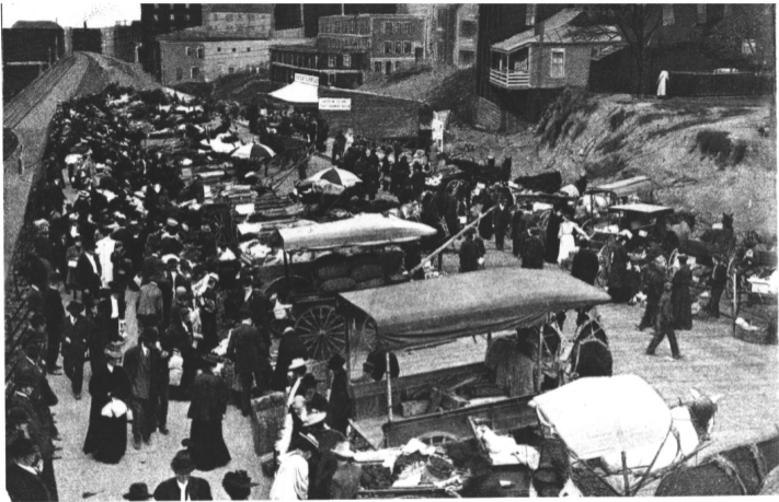
Street Market Scene, Seattle, Wash.