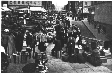
Public Market, Seattle, Wash.