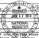
DATE OF PHOTO: 8/72 NEGATIVE FILED AT: 35 mm slide--Pike Project Office