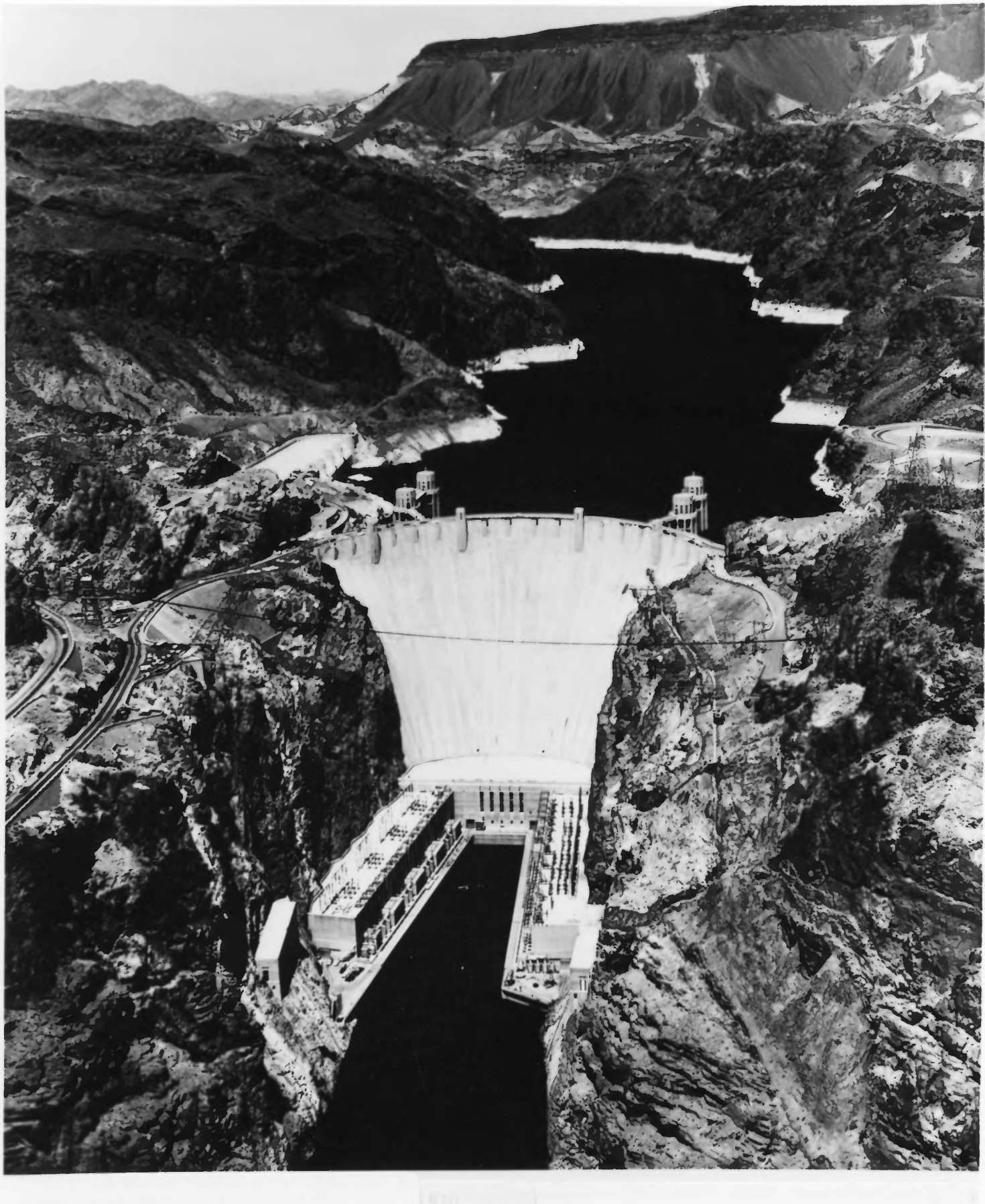
Hoover Dam National Historic Landmark Arizona-Nevada border