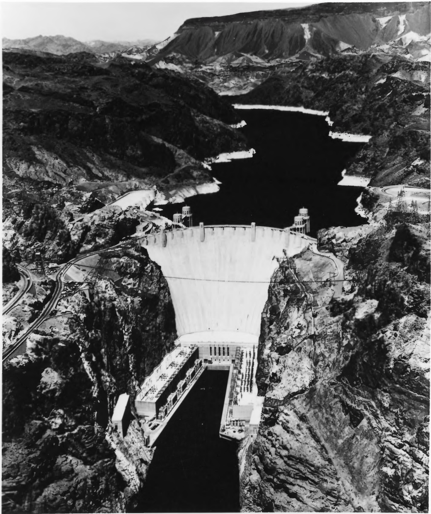
Hoover Dam National Historic Landmark Arizona-Nevada border

470 Colorado Series, photograph PA3-300-10769