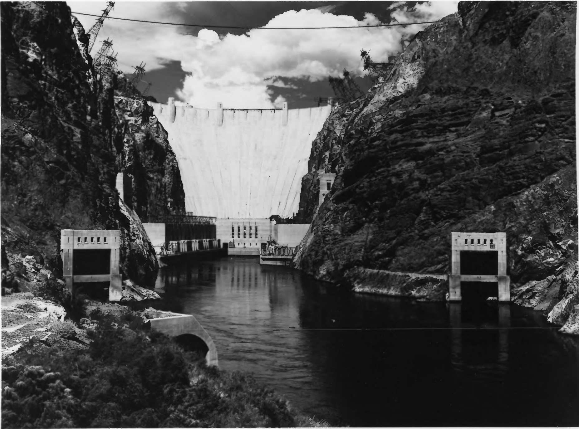
Hoover Dam, 1967

Bureau of Reclamation, Lower Colorado Region, photograph P45-300-7493