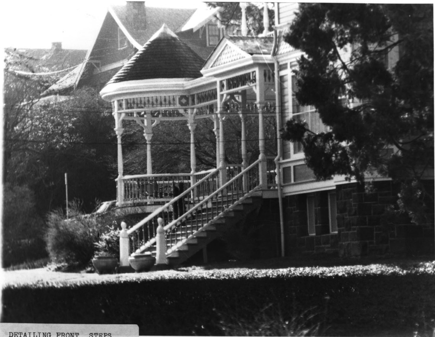
DETAILING FRONT STEPS