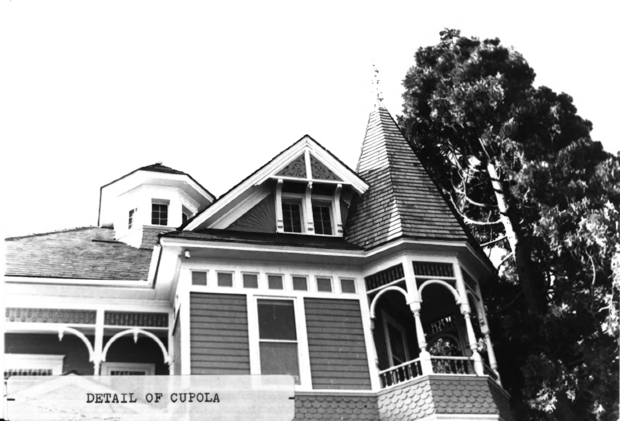
DETAIL OF CUPOLA