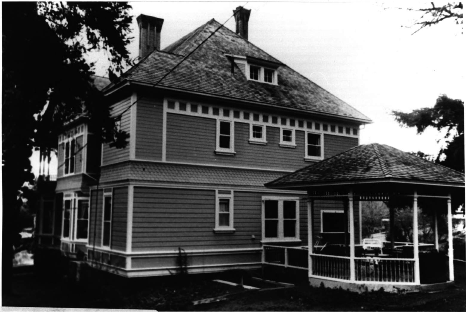
WEST & SOUTH SIDES SHOWING GAZEBO