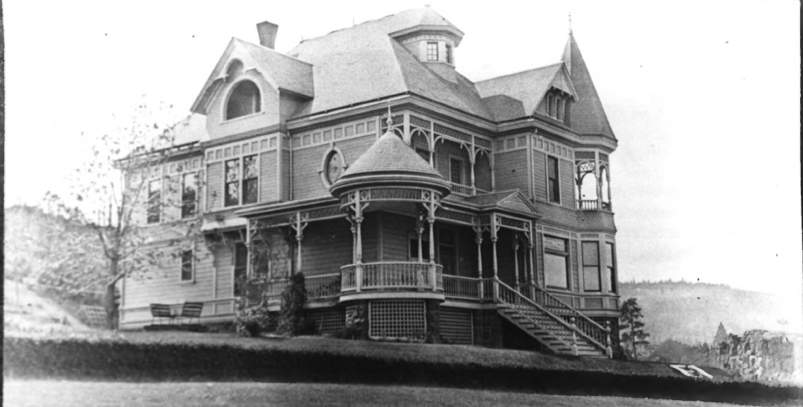
VIEW OF HOUSE TAKEN APPROXIMATELY 1905