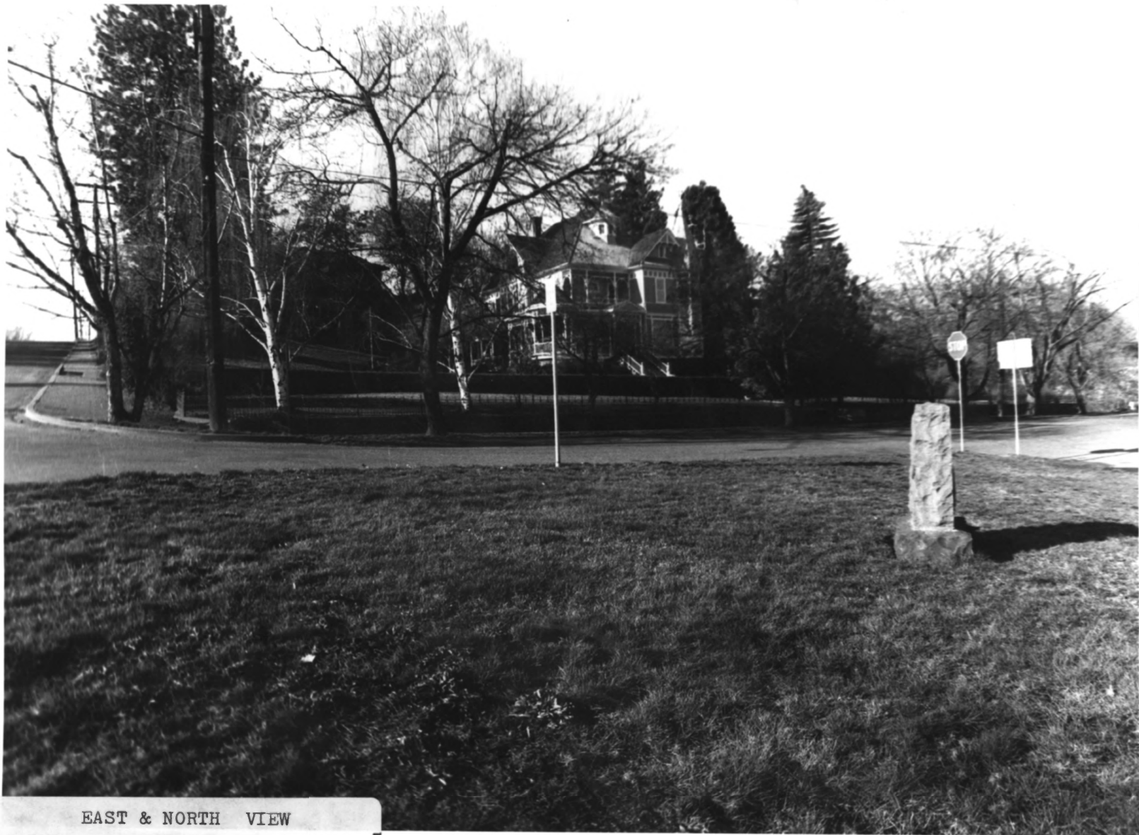
EAST & NORTH VIEW FROM WEST THIRD PLACE