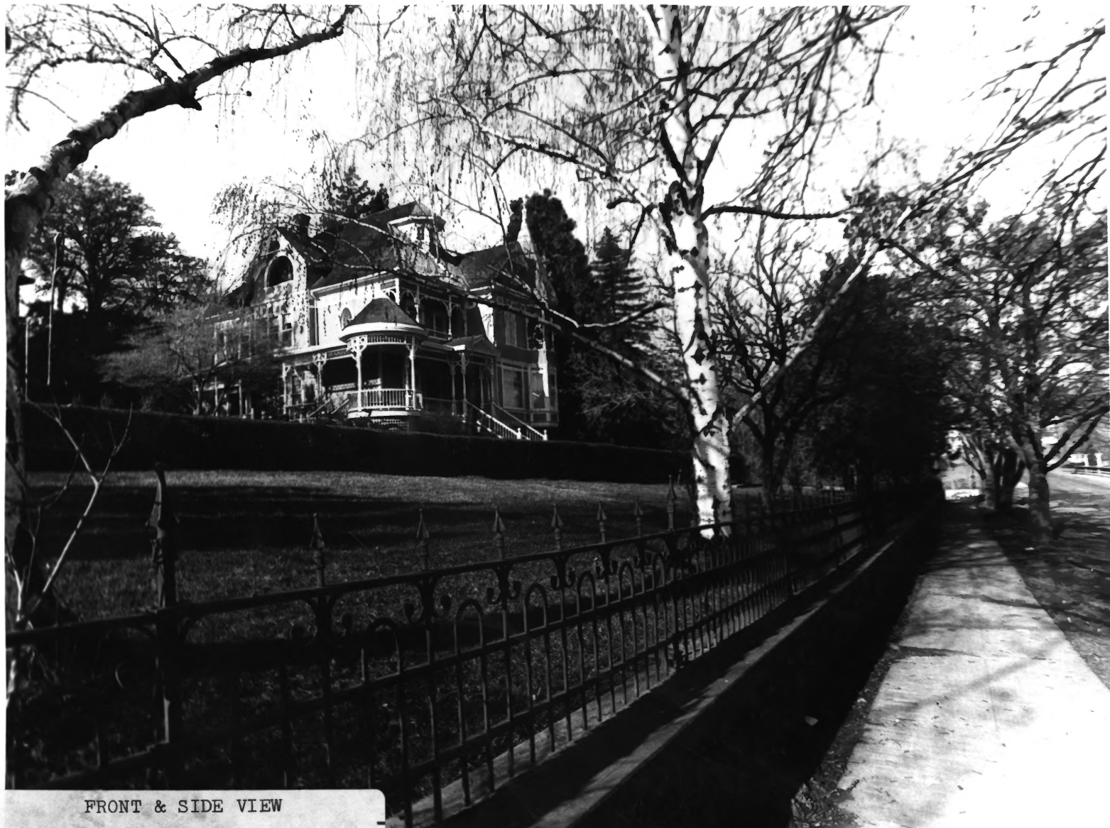
FRONT & SIDE VIEW CORNER OF TREVIT & WEST SIXTH