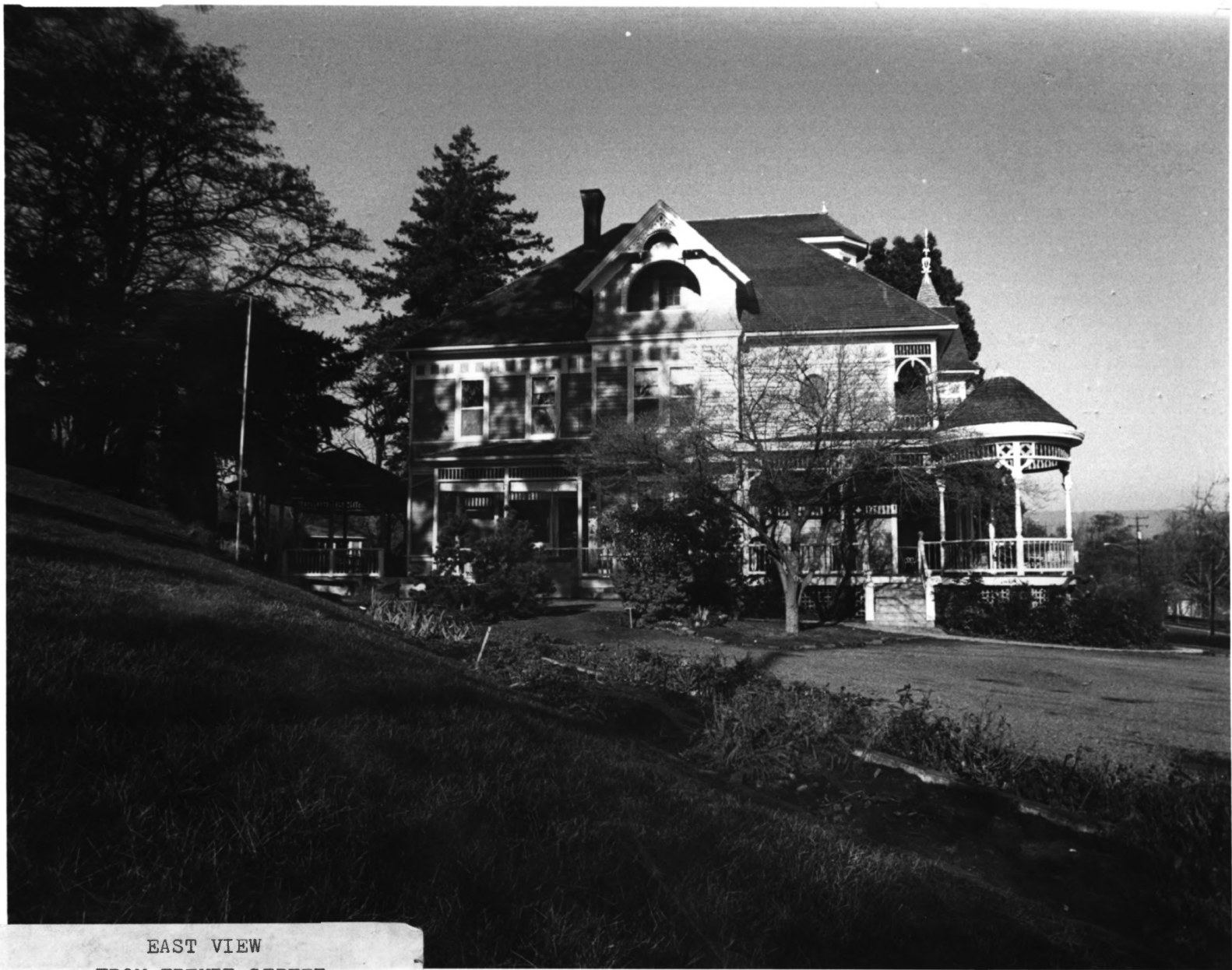
EAST VIEW FROM TREVIT STREET