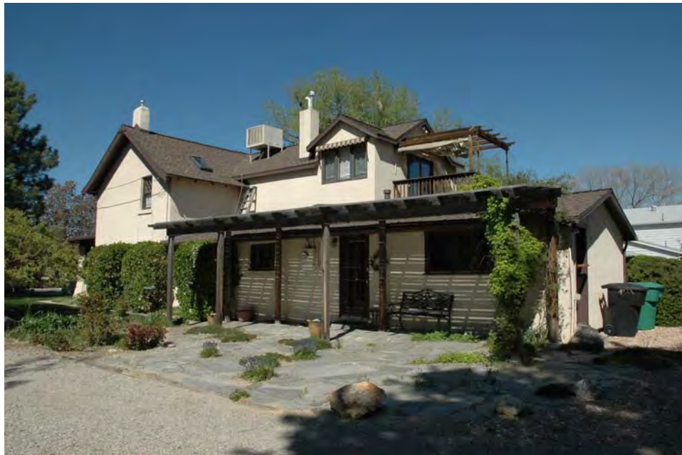
Photograph 4 of 9 West and south elevations of Bradford House. Camera facing northeast.