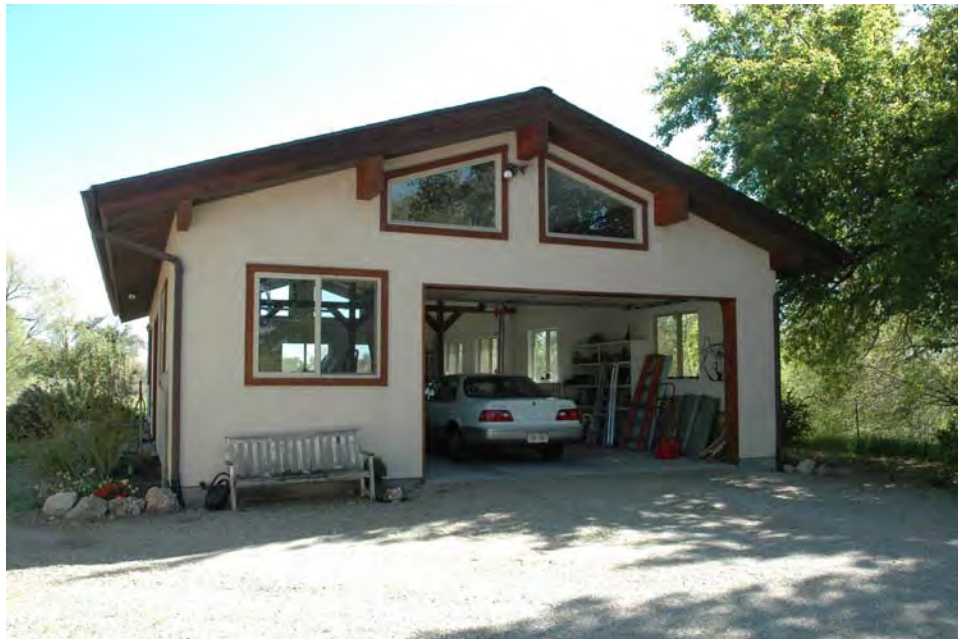
Photograph 6 of 9 North elevation of garage. Camera facing south.