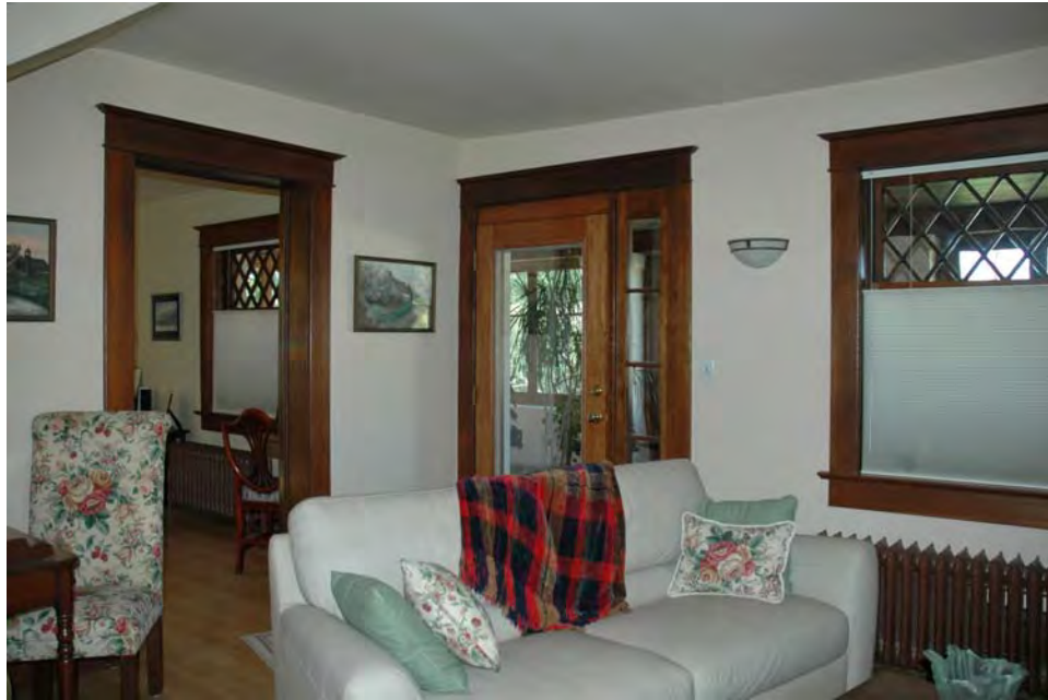
Photograph 8 of 9

Interior of Bradford House, main floor, living room. Camera facing northwest.