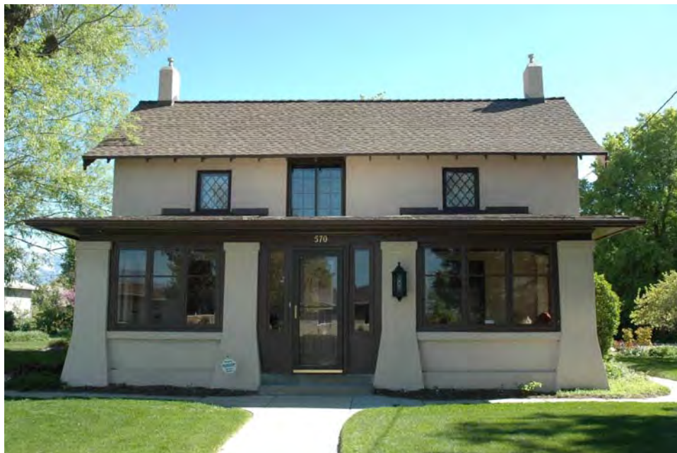
Photograph 2 of 9 North elevation of Bradford House. Camera facing south.