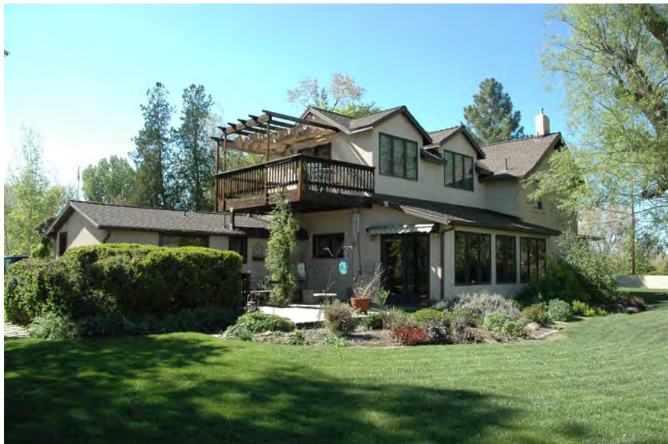
Photograph 5 of 9 East and south elevations of Bradford House. Camera facing northwest.