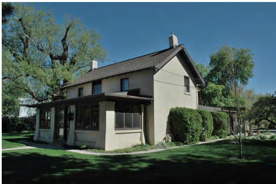
Photograph 3 of 9 North and west elevations of Bradford House. Camera facing southeast.