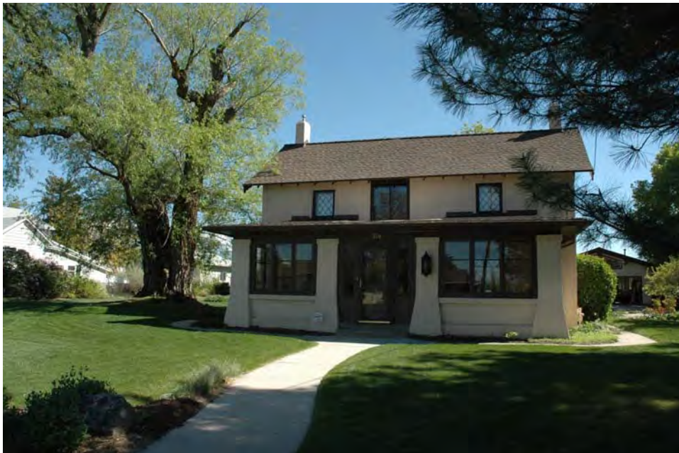
Photograph 1 of 9 View of site and north elevation of Bradford House. Camera facing south.

Name of Property: Bradford, Rawsel & Jane, House City or Vicinity: 570 E. 4800 South, Murray City County: Salt Lake State: Utah Date Photographed: May 2014