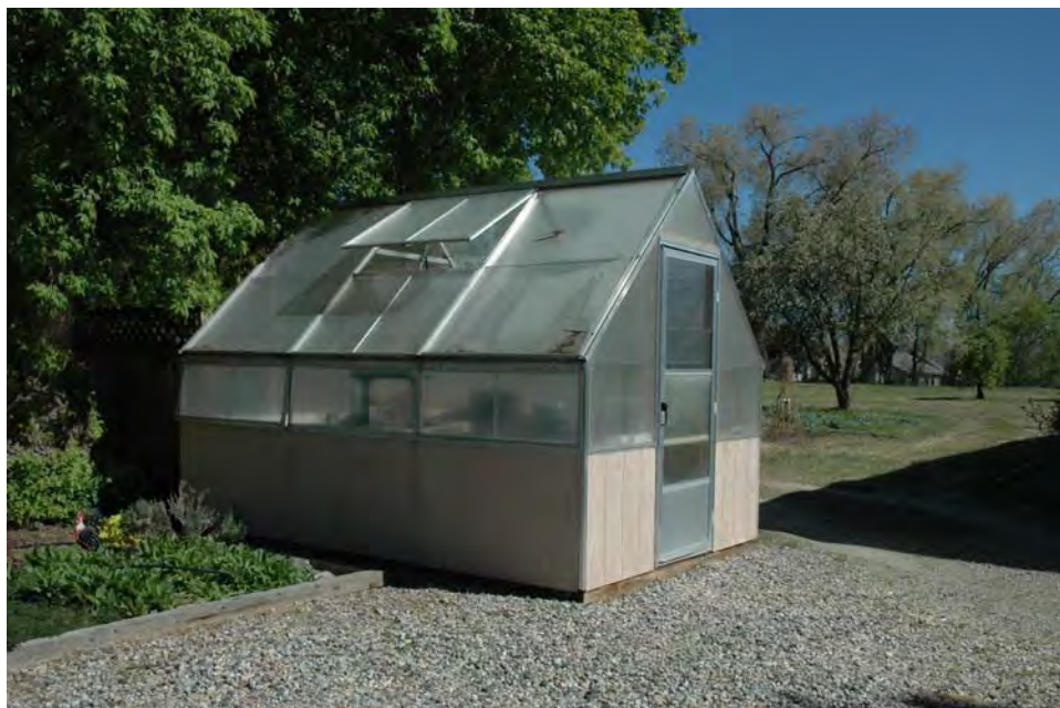
Photograph 7 of 9 North and west elevations of greenhouse. Camera facing southeast.