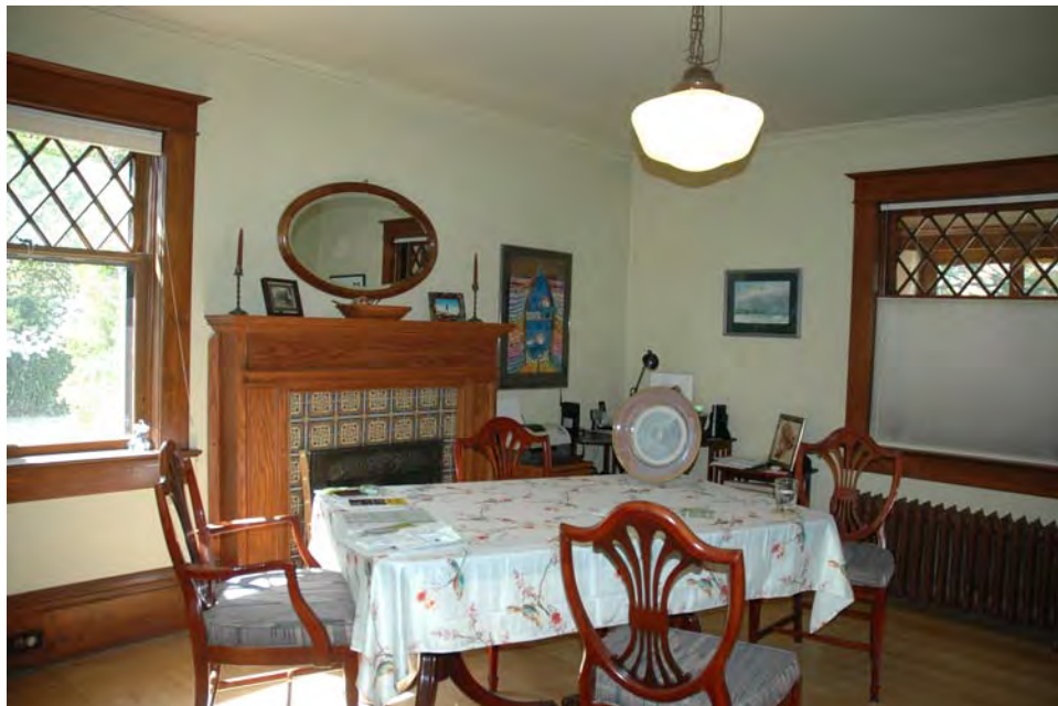
Photograph 9 of 9

Interior of Bradford House, main floor, living room. Camera facing northwest.