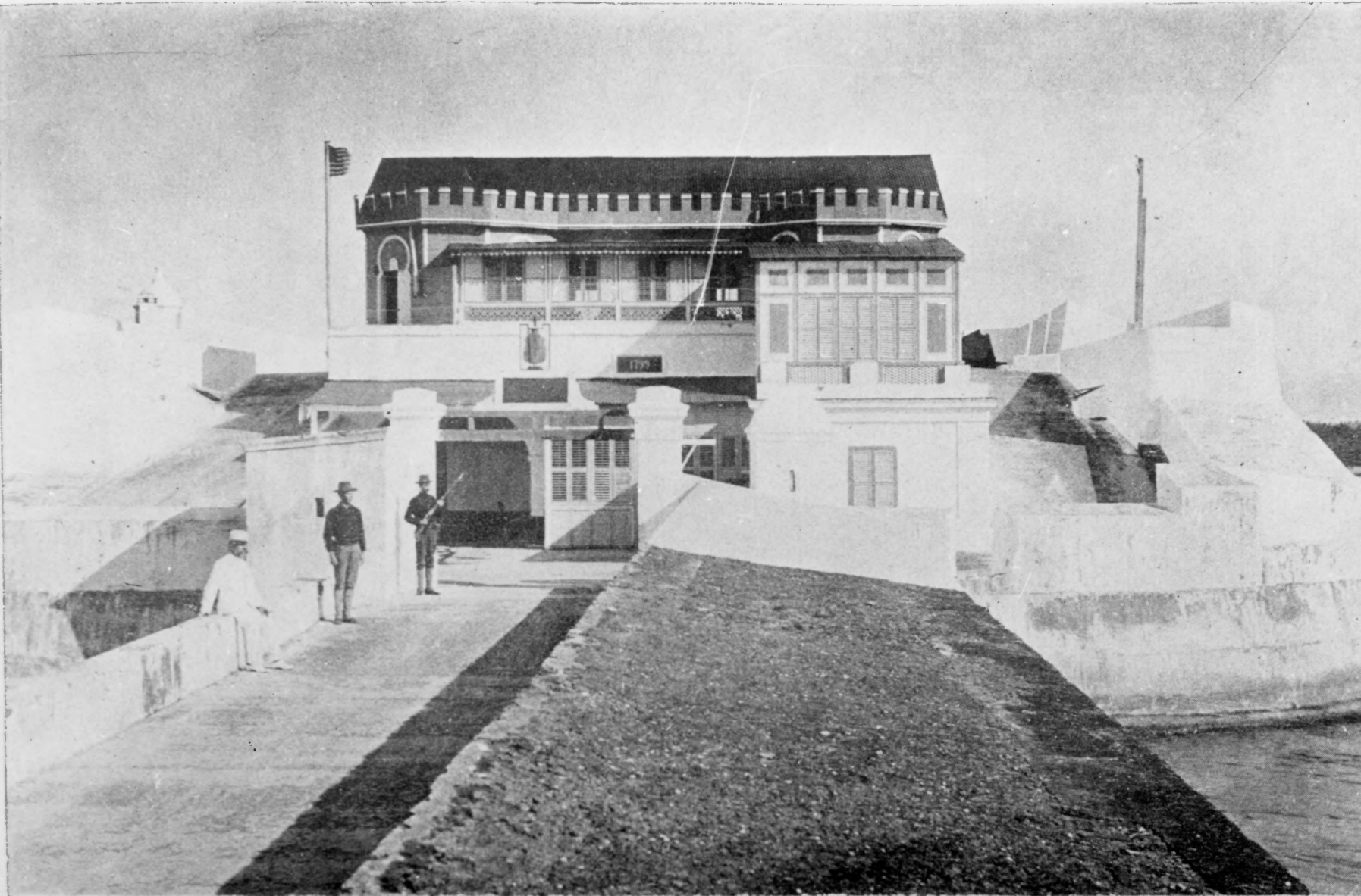
Castillo de San Gerónimo en San Juan.