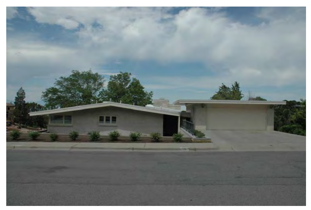
Photograph 8 of 10 East elevation of Price House, garage on right. Camera facing west.