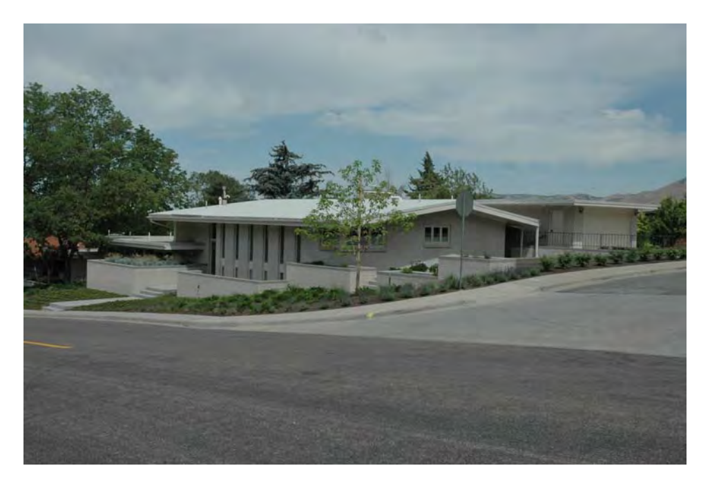
Photograph 1 of 10 South and east elevations of Price House. Camera facing northwest.