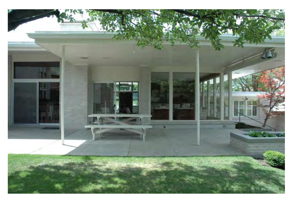
Photograph 7 of 10 North elevation of Price House, patio detail. Camera facing south.