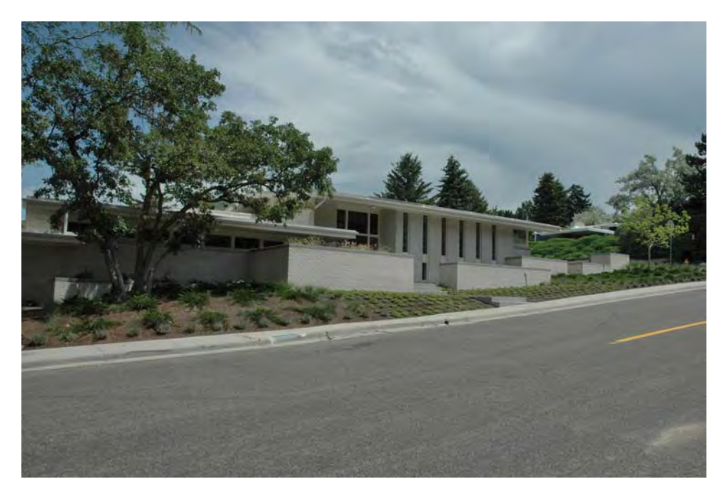
Photograph 4 of 10 South elevation of Price House. Camera facing northeast.