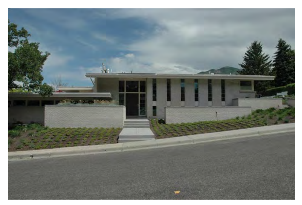
Photograph 2 of 10 South elevation of Price House. Camera facing north.