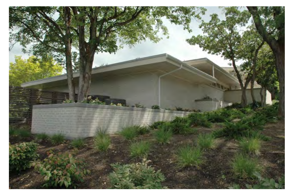
Photograph 5 of 10 West and south elevations of Price House. Camera facing northeast.