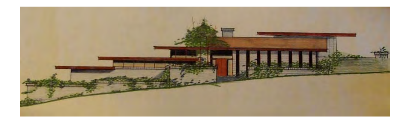
Figure 1 Rendering of Jack Price House, 1959.