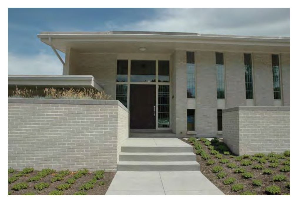
Photograph 3 of 10 South elevation of Price House, entrance detail. Camera facing north.