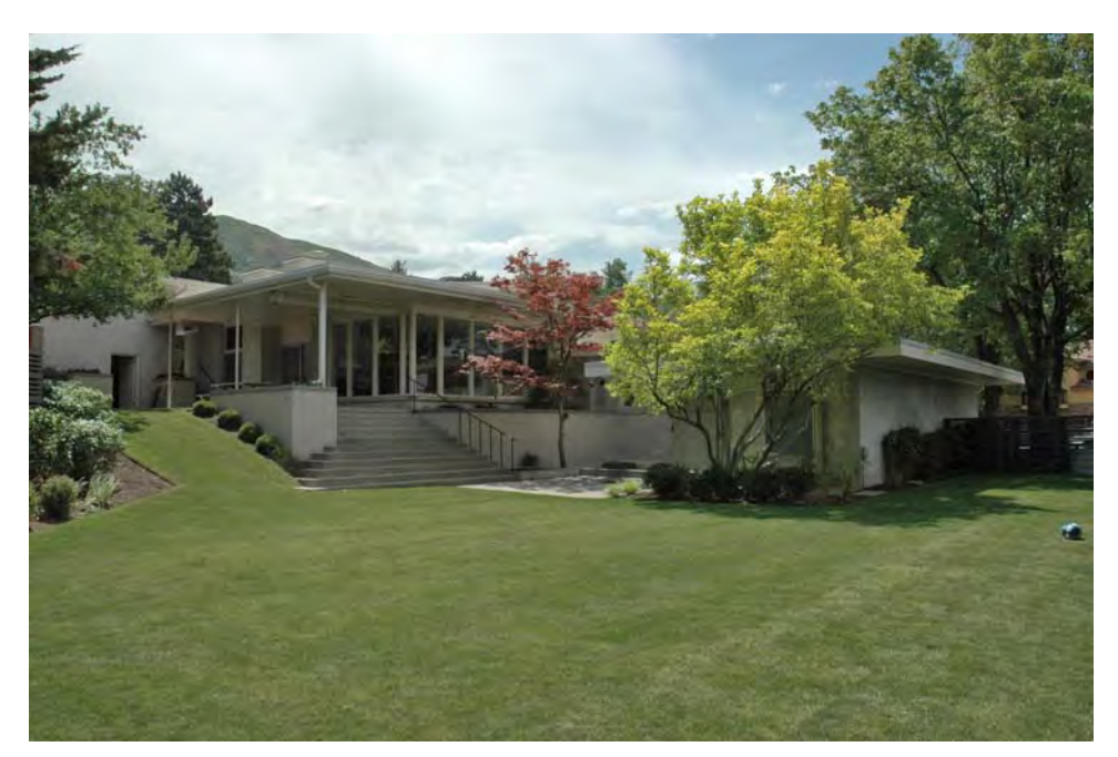
Photograph 6 of 10 North and west elevations of Price House. Camera facing southwest.