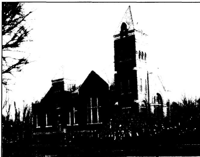
Burr Oak United Methodist Church, 1912.